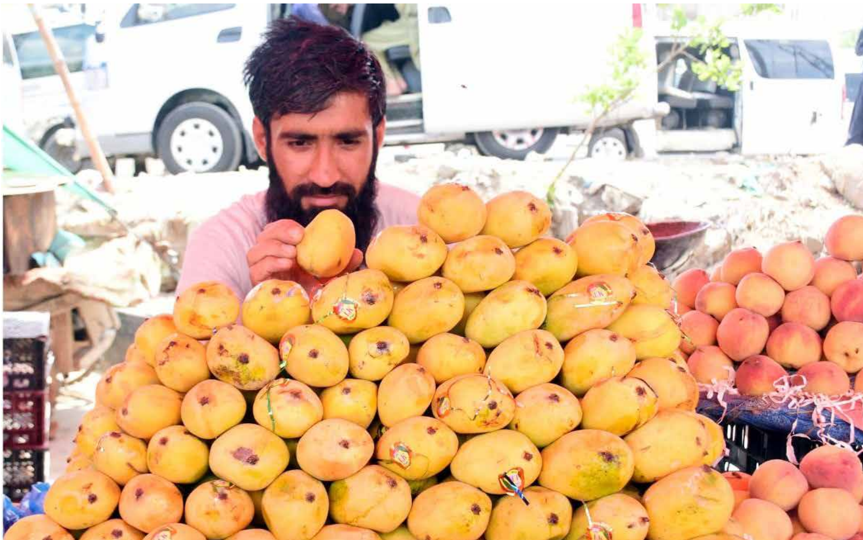
ISLAMABAD: A fruit seller arranges mangoes at his stall outside Fodd and Vegetable Market of Sector 1-11 in the Federal Capital.

Rana Mashhood announced a prize of ten lakh rupees for each player on behalf of the Prime Minister. According to Rana Mashhood, on May 15, the Prime Minister's patron-in-chief for hockey will meet the national team at the Prime Minister's House. In a thrilling final showdown, Japan secured victory over Pakistan in the Sultan Azlan Shah Cup final, triumphing 4-1 in a penalty shootout. The closely contested final culminated in a penalty shootout after both teams ended full time with a deadlock at two goals each.