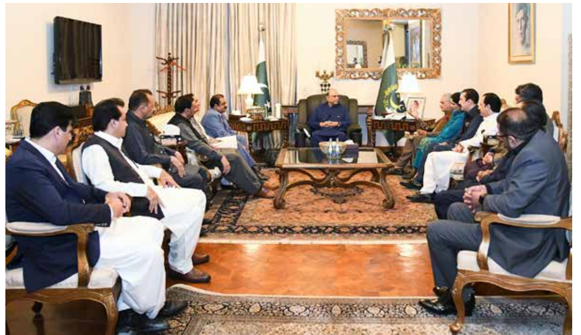
ISLAMABAD: A delegation of members of the Azad Jammu and Kashmir Legislative Assembly, belonging to Pakistan People's Party Parliamentarians, called on President Asif Ali Zardari, at Aiwan-e-Sadr.