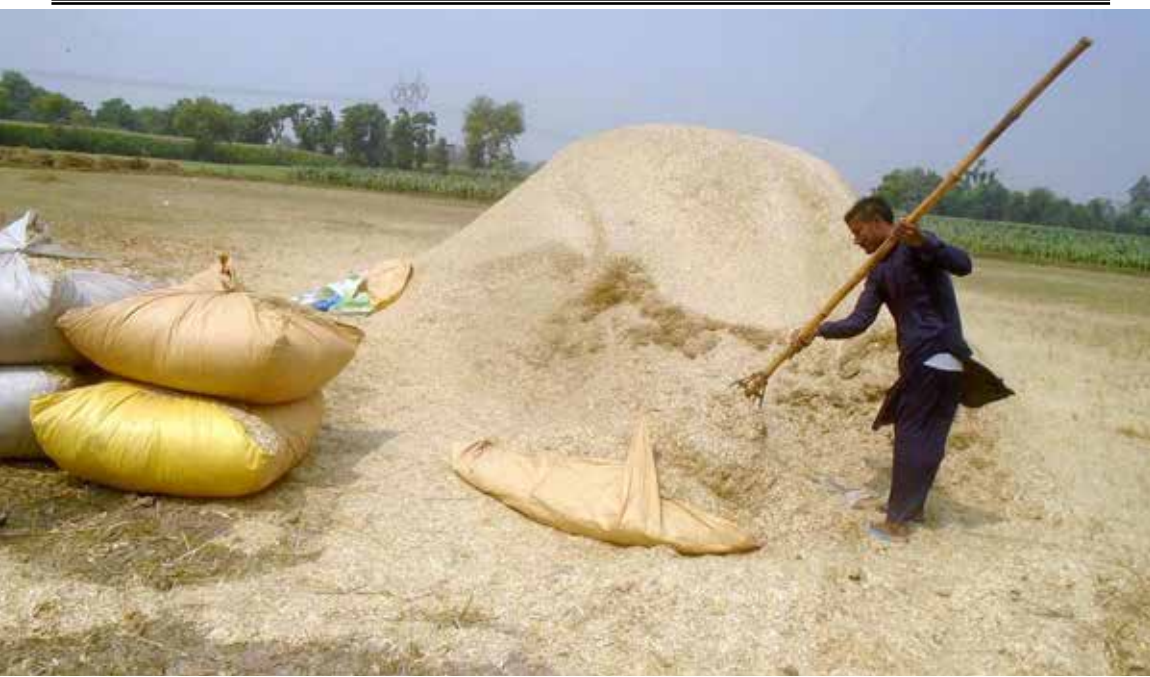
CHINIOT: A farmer busy in filling bags with chaff (husk from wheat) after threshing wheat crop in his field.

KARACHI: The Karachi Board of Higher Secondary Education has unveiled the much-anticipated timetable for the annual first and second-year examinations. As per the announcement by Interboard Karachi, the inaugural phase of the Intermediate Part I and Part II examinations for the year 2024 is slated to commence from Tuesday, May 28th, 2024.