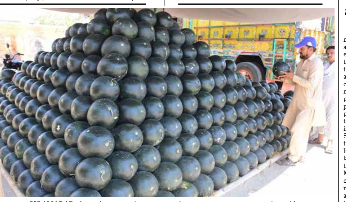
ISLAMABAD: A vendor arranging water melons to attract customers alongside a road in the Federal Capital.

RAN and 6G" was held under PTA- GSMA Centre of Excel-