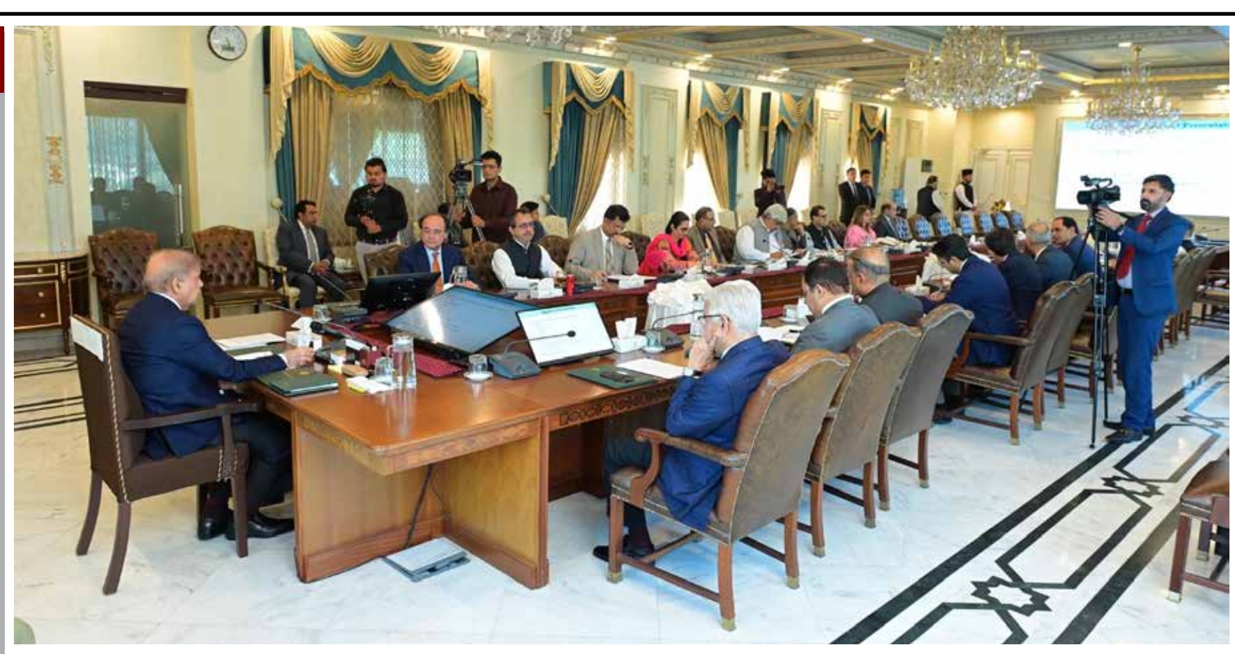
ISLAMABAD: Prime Minister Muhammad Shehbaz Sharif chairs a review meeting on the matters related to Ministry of Privatisation and Privatisation Commission.

tions and for the ECP". According to the data leak assessed by economists and reporters, the number of residential properties owned by foreigners in Dubai put Indians first, at 35,000 properties and 29,700 owners. The total value of these properties is estimated at $17 billion that same year. Owners with Pakistani nationality come second among foreigners at 17,000 owners of 23,000 residential properties followed by UK citizens and Saudi nationals. Among the Pakistani owners, the average value per owner is estimated at $0.41 million