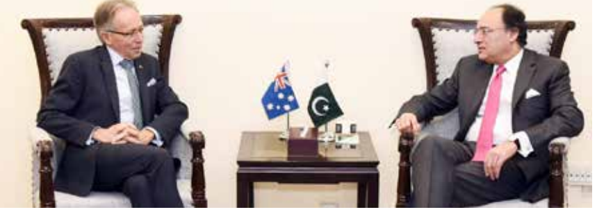
ISLAMABAD: Federal Minister for Finance & Revenue Senator Muhammad Aurangzeb was called on by Australian High Commissioner to Pakistan H.E. Mr. Neil Hawkins in Islamabad. - DNA

The Australian High Commissioner briefed the Finance Minister on the engagements of the Australian Government with Agriculture Universities in Pakistan