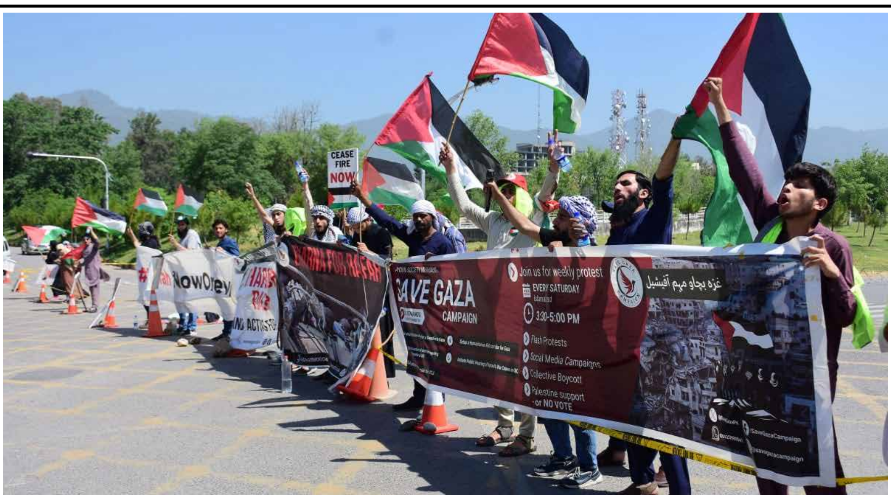
ISLAMABAD: Youngsters stage a protest demonstration against the Israeli brutalities at D-Chowk in the Federal Capital.