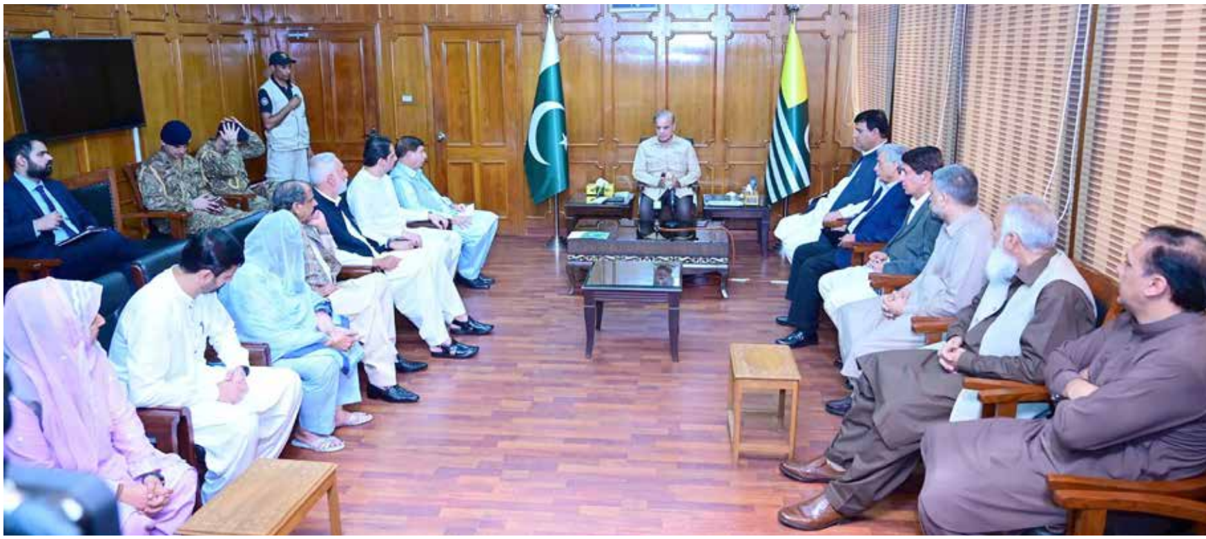
MUZZAFFARABAD: A delegation of Pakistan Muslim League (N) Azad Jammu and Kashmir calls on Prime Minister Muhammad Shehbaz Sharif.

ISLAMABAD: Oil and Gas Development Company Limited (OGDCL) has announced a significant production enhancement at Nashpa Well-10, located in the Karak District of the Khyber Pakhtunkhwa as part of its production enhancement campaign. Through a production enhancement strategy, OGDCL has implemented rigless intervention techniques in various formations, resulting in a significant increase in hydrocarbon production. With the successful optimization, the cumulative production from the well now stands at an impressive 1870 BPD of oil and 7.02 MMSCFD of gas. The extracted gas is being efficiently injected into the Sui Northern Gas Pipelines Limited (SNG-PL) network. Prior to the production enhancement, the well had been producing 1700 BPD of oil and 2.45 MMSCFD of gas. The Nashpa-10 production is projected to save $30.67 million annually in foreign exchange as import substitution for the country.