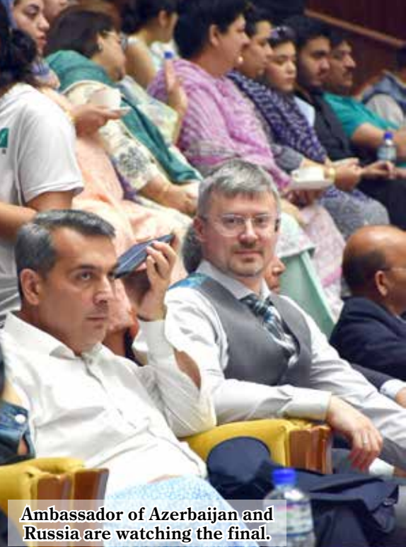
Ambassador of Azerbaijan and Russia are watching the final.

ISLAMABAD: Pakistan have defeated Turkmenistan in the final of the Central Asian Volleyball Association (CAVA) Nation's Volleyball League at the Liaquat Gymnasium in Islamabad today. Pakistan claimed a 3-1 win with set scores of 25-21, 25-19, 20-25, and 25-14. The home side showcased strong offensive and defensive strategies, securing early leads in the first two sets. Turkmenistan made a comeback in the third set, taking it 25-20. However, Pakistan regained control in the fourth set, decisively winning 25-14 to clinch the match. Earlier, Kyrgyzstan won the third place game by beating Sri Lanka 3-1. Kyrgyzstan had kept dominance in the first two sets, claiming by 25-20 and 25-17. But, the