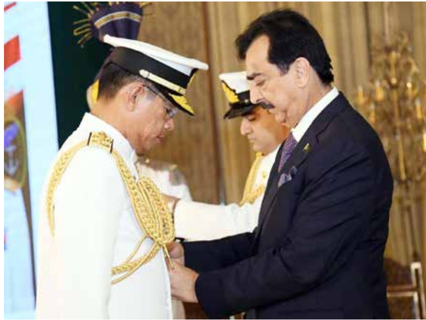
ISLAMABAD: Acting President Syed Yousuf Raza Gillani conferring the award of Nishan-e-Imtiaz (Military) upon the Chief of the Royal Malaysian Navy, Admiral Tan Sri Abdul Rahman bin Ayob, during a special investiture ceremony, at Aiwan-e-Sadr.