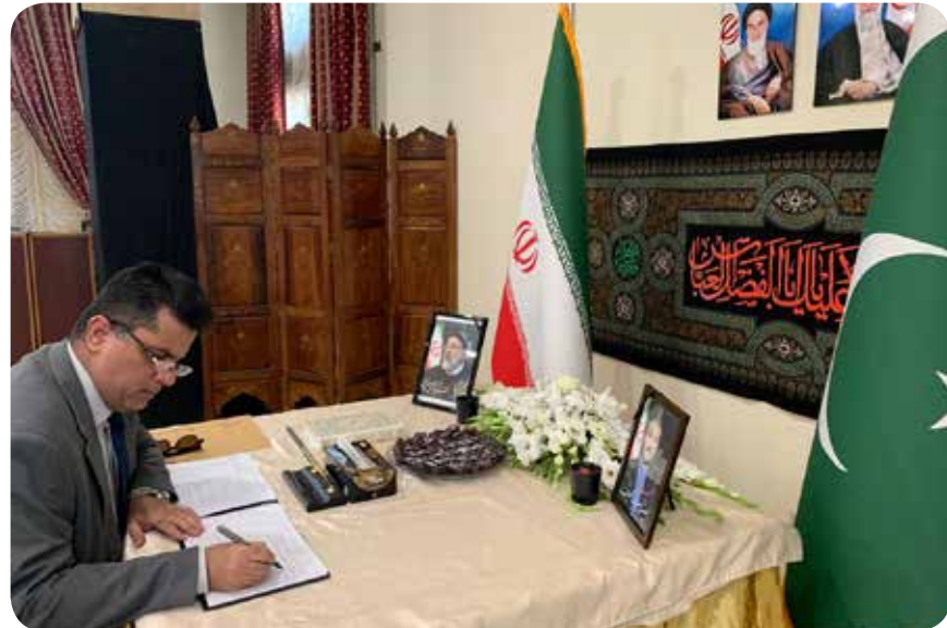
ISLAMABAD: The ambassadors of Palestine, Oman, Iraq, and Syria visited the Embassy of Islamic republic of Iran to sign the Book of Condolences. The ambassadors expressed heartfelt condolences on the sad demise of the President of Iran. — DNA