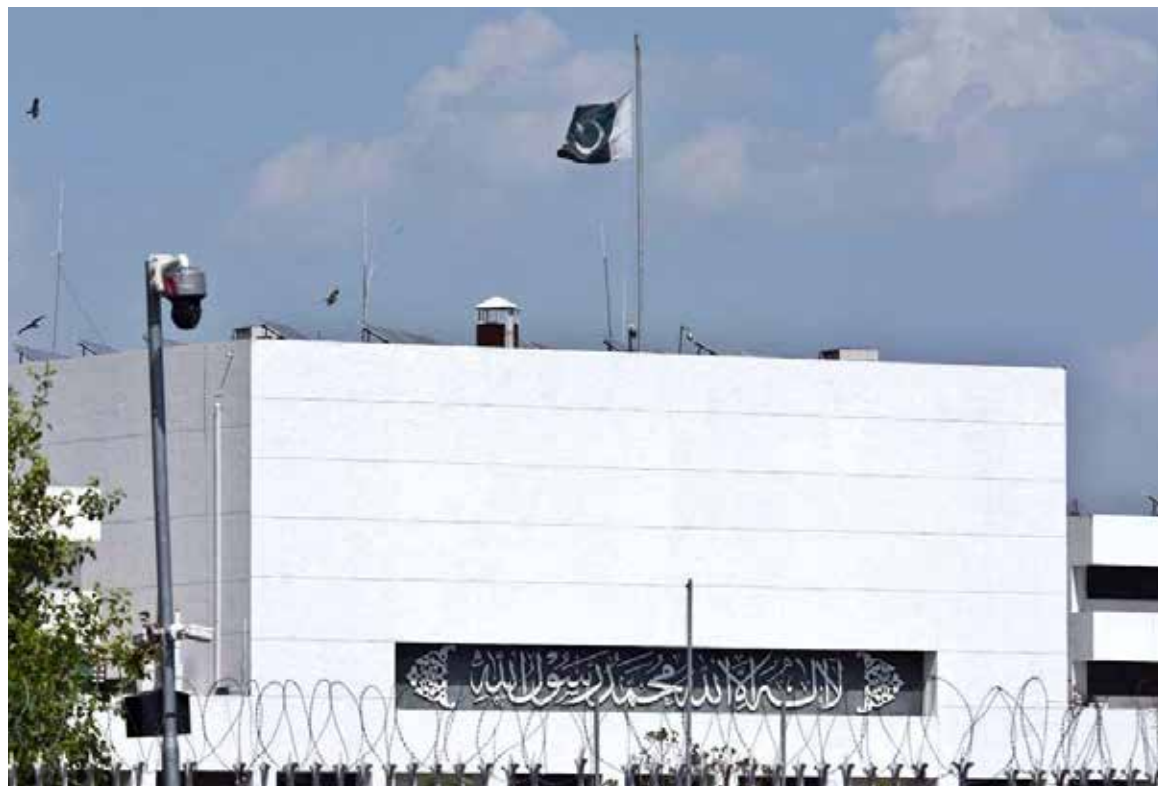
ISLAMABAD: National flag flies half mast at National Assembly building as Prime Minister announce a day of mourning in the country over the death of Iranian President Ebrahim Raisi who died in a helicopter crash.

LONDON: Wikileaks founder Julian Assange can bring a new appeal against extradition to the US, the High Court has ruled. He was granted permission to appeal against the order that he be sent to the US to stand trial for leaking military secrets. The decision means Mr Assange will be able to challenge US assurances over how his prospective trial would be conducted and whether his right to free speech would be infringed. Mr Assange's lawyers hugged each other in court after this latest ruling in the legal saga. They have argued that the case against him is politically motivated. In a short ruling this morning, two senior judges granted him permission to appeal against an earlier order, ruling that he needs to be given a full appeal in the UK. - Agencies