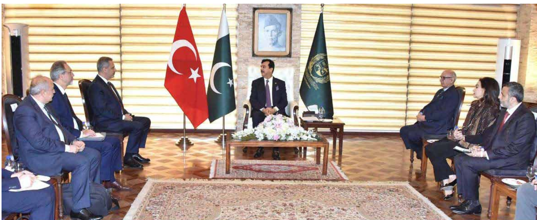
ISLAMABAD: Chairman Senate, Syed Yousuf Raza Gilani in a meeting with Turkish Foreign Minister Hakan Fidan at Parliament House.