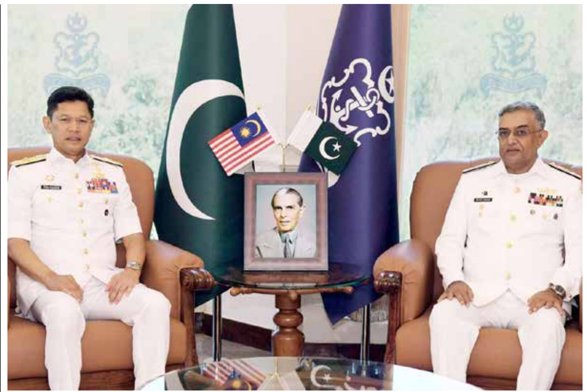
ISLAMABAD: Chief of the Naval Staff Admiral Naveed Ashraf during call-on with Chief of Royal Malaysian Navy Admiral Tan Sri Abdul Rahman Bin Ayob at Naval Headquarters.

ly committed to ensure sustainable development. Under the leadership of Prime Minister Shehbaz Sharif, large-scale economic reforms are going on in the country. Thanks to the best economic policies, the country is on the path of economic development." Rana Tanveer Hussain said that the private sector was responsible for development of the economy as the sustainable economic development could be achieved only through close cooperation between the government and private sector. Agriculture sector was the main pillar of Pakistan's economy, he said and added that industries were taking measures to improve agricultural production by providing machinery, fertilizers and processing facilities. There was a special focus on agriculture to ensure food security and there was also determination to increase per acre yield of food grains across the country, while a road map had been chalked out to increase agricultural production, he said and added that an integrated strategy had been created for development of industry and agriculture, which would increase exports. The authority had been formed, "Working under an integrated strategy to supply urea and DAP fertilizers to farmers" issued instructions to the industry for uninterrupted supply of fertilizers to farmers, he said.