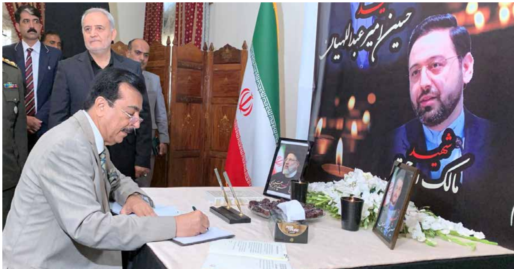
ISLAMABAD: Acting President/Chairman Senate Yousaf Raza Gillani signing the condolence book on the sad demise of the Iranian President and other high-ranking officials killed in helicopter crash.