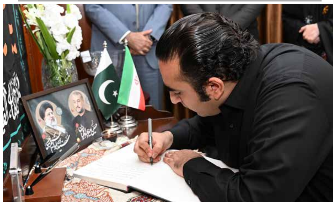
ISLAMABAD: Chairman Bilawal Bhutto Zardari signing the condolence book at the Iranian embassy.