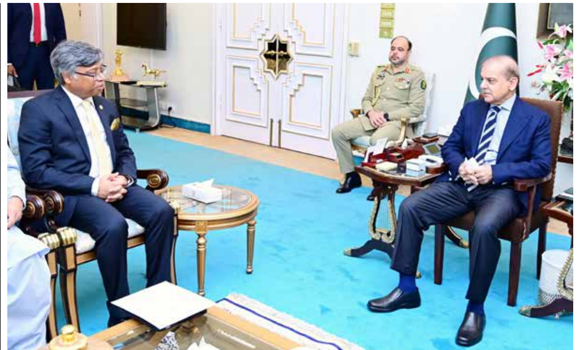
ISLAMABAD: Secretary General of South Asian Association of Regional Cooperation Muhammad Golam Sarwar calls on Prime Minister Muhammad Shehbaz Sharif.