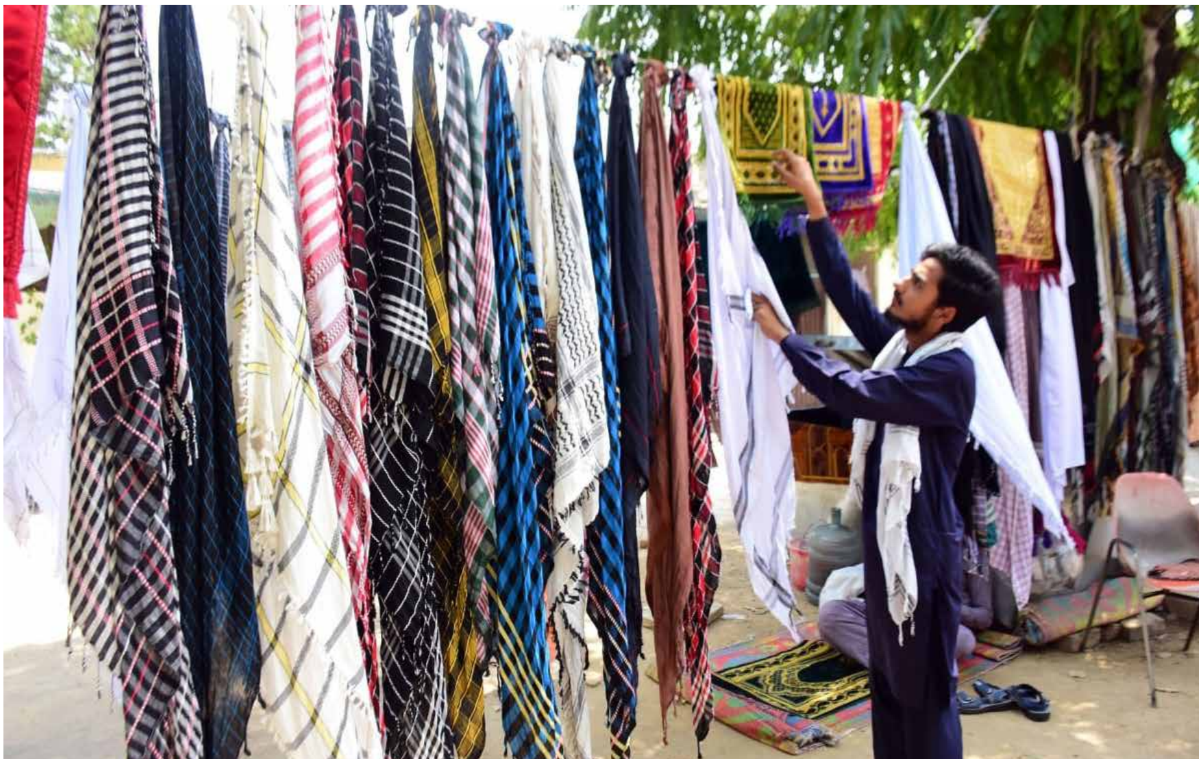
ISLAMABAD: A vendor selling men scarf outside Laal Masjid in the Federal Capital.