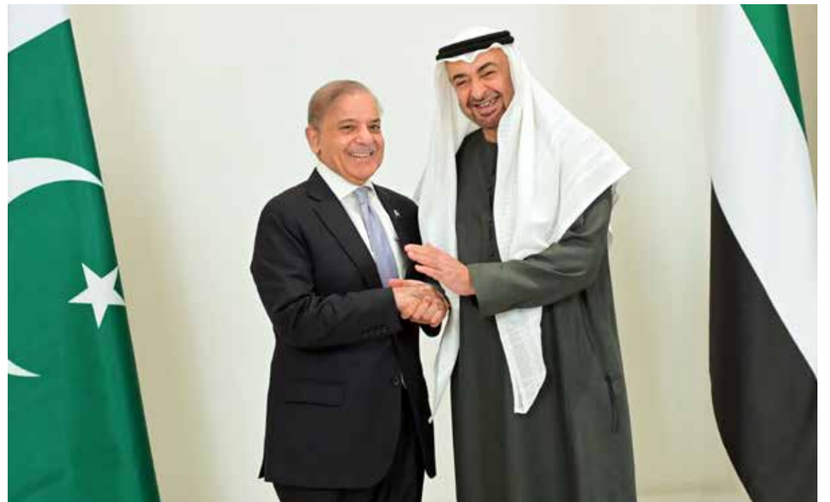
ABU DHABI: Prime Minister Muhammad Shehbaz Sharif and President of UAE H.H. Sheikh Muhammad bin Zayed Al Nahyan meet in Abu Dhabi.