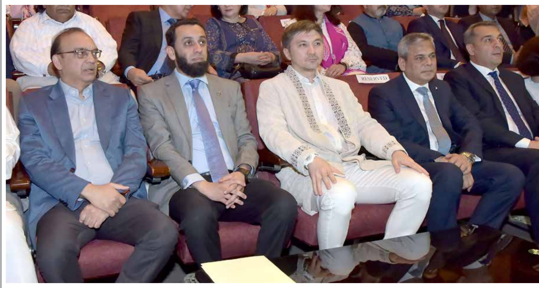
ISLAMABAD: Federal Minister for Information and Culture Attaullah Tarar, Ambassador of Kazakhstan Yerzhan Kistafin, Ambassador of Azerbaijan Khazar Farhadov and others watching the Kazakh movie "Kazakh Khanate - The Golden Throne, at the PNCA. The minister lauded the effort of the Kazah embassy and assured his full support in further strengthening especially the cultural linkages between the two countries. The minister promised to arrange country-wide screening of the movie. - DNA

Movie unfolds in the XV century, showcasing key events in the formation of Kazakh statehood