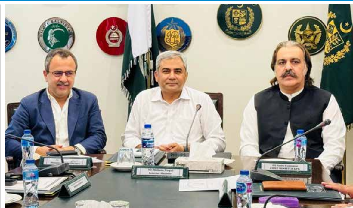
ISLAMABAD: Federal Minister for Interior Mohsin Naqvi and Federal Minister for Energy Sardar Awaiz Ahmad Khan Leghari in a meeting with Chief Minister Khyber Pakhtunkhwa Ali Amin Gandapur.