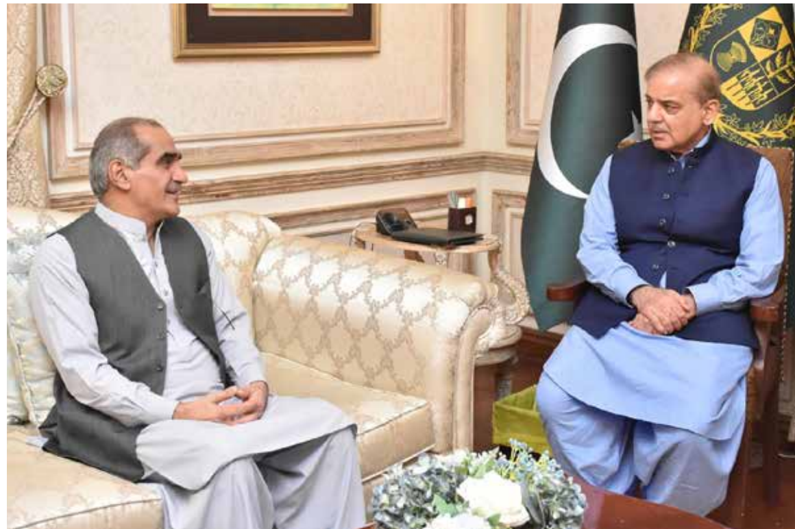
LAHORE: Former Federal Minister Khawaja Saad Rafique calls on Prime Minister Muhammad Shehbaz Sharif.

Moreover, the Met Department has also predicted thunderstorms in Karachi, Thatta, Badin, and Hyderabad in May, which will not only bring relief from the heat but also provide some much-needed water for the parched cities. However, the Met Department has warned that the severe heat wave is likely to continue in upper regions from May 28, with temperatures expected to soar 6 to 8 degrees higher in central and southern regions of the country. This could potentially disrupt daily routines and pose a challenge for people, especially the vulnerable segments of society.