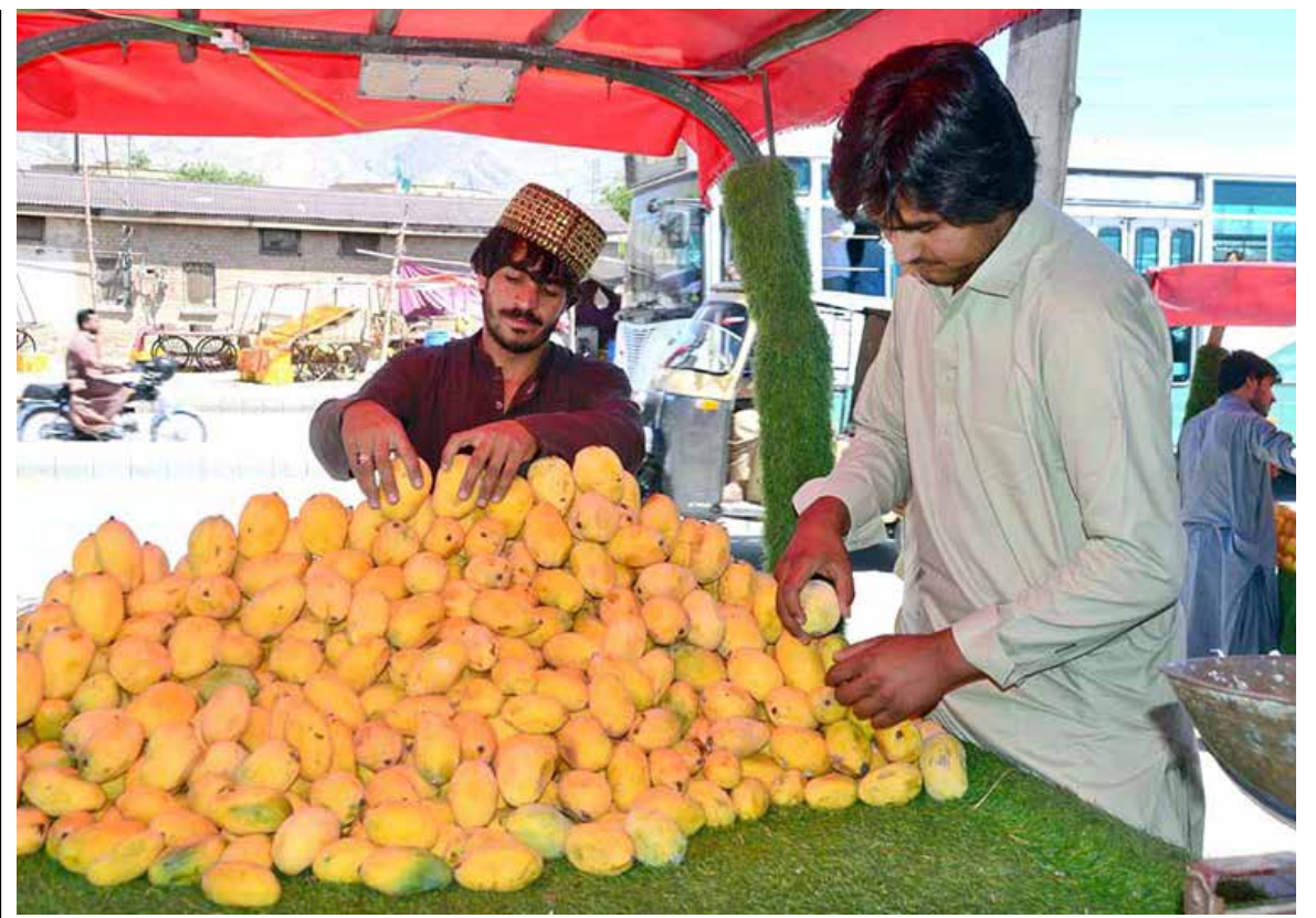
QUETTA: Vendors arranging and displaying mangoes to attract the customers.

support SMEs. He emphasized the importance of accessing untapped markets such as Africa, Central Asia, and ASEAN countries to boost exports. Besides textiles, rice, and leather, he highlighted the potential of sectors like halal food, pharmaceuticals, IT and engineering to enhance exports. He called for resolving payment issues in the IT sector to increase its export potential and suggested creating a mechanism to ensure all remittances are brought to Pakistan rather than held in foreign banks. The president noted that the Ministry of Commerce was leveraging existing PTAs and FTAs with other countries. He suggested reassessing trade agreements with countries where Pakistan faces trade deficits despite these agreements. He mentioned the potential signing of an FTA between Pakistan and the GCC within the next three to four months and noted existing trade agreements with Tajikistan and Uzbekistan. He also discussed the implementation of a barter trade mechanism with Iran, Afghanistan and Russia through SRO-642 in the coming months, expressing hope for improved trade with neighboring countries. Addressing sector-specific issues, he pointed out the restriction on jewelers to bring back 50 per cent gold and 50 per cent foreign exchange from their exports under SRO-760.