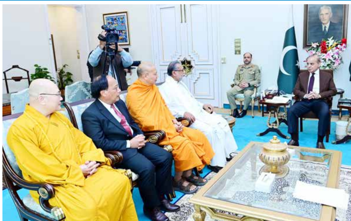
ISLAMABAD: A delegation of Buddhist Monks led by Minister of Budhasasana and Religious Affairs of Sri Lanka H.E Vidura Wickramanayaka calls on Prime Minister Shehbaz Sharif. - DNA