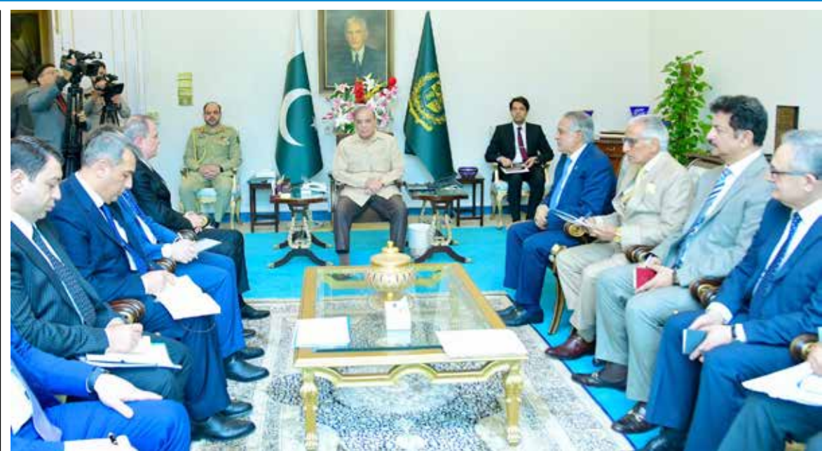
ISLAMABAD: Minister of Foreign Affairs of Azerbaijan Mr. Jeyhun Bayramov calls on Prime Minister Muhammad Shehbaz Sharif. - DNA