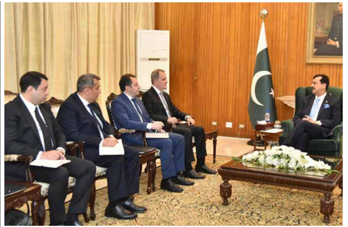
ISLAMABAD : The Foreign Minister of Azerbaijan, Mr Jeyhun Bayramov, along with his delegation, called on the Acting President, Syed Yousuf Raza Gillani, at Aiwan-e-Sadr.

tant for countries, companies, communities, and individuals to start looking at their carbon footprint," she asserted. Senator Rehman emphasized the financial challenges associated with climate action, stating, "Adaptation costs four times more than normal development spending, and as the World Bank's assessment indicates, Pakistan needs $348 billion by 2030, with $196 billion dedicated to mitigation. These figures underline the immense financial challenge of adaptation and mitigation." Regarding public and private financing, she noted, "While there is often a call to unlock private financing as a solution, it's essential to acknowledge that private financing alone may not suffice. Private financing typically seeks profits, and in disaster situations, investing in disaster zones may not always align with profit motives. Therefore, relying solely on private financing overlooks the need for robust public funding mechanisms. It's imperative to ensure that public funds are accessible and efficiently utilized, especially in vulnerable countries like Pakistan. Additionally, there should be a concerted effort to streamline the process of accessing climate financing, reducing bureaucratic barriers, and ensuring that funds reach communities in a timely manner." "This is not a victim conversation. Seeking an entitlement is never a victim conversation, either from your own government, your community, or the global north," she concluded.