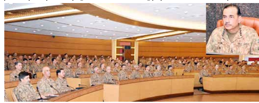
RAWALPINDI: Army Chief presides over corps commanders conference, in Rawalpindi.

The forum also expressed complete solidarity with the people of Palestine and condemned serious human rights violations and war crimes being perpetrated in Gaza, supporting the International Court of Justice decision to stop Rafah Operation and all other operations within the Gaza Strip. The forum underscored that politically motivated and vested digital terrorism, unleashed by conspirators duly abetted by their foreign cohorts, against State institutions is clearly meant to try to induce despondency in the Pakistani nation, to sow discord among national institutions, especially the Armed Forces, and the people of Pakistan by peddling blatant lies, fake news, and propaganda. However, the nation is fully cognisant of their ugly and ulterior motives and surely the designs of these nefarious forces will be comprehensively defeated, InshaAllah. The forum noted that planners, perpetrators, abettors, and facilitators of 9th May need to be brought to justice for the collective good of the country, and that without swift and transparent dispensation of justice to the culprits and establishing the rule of law, stability in the country will ever remain hostage to the machinations of such elements.