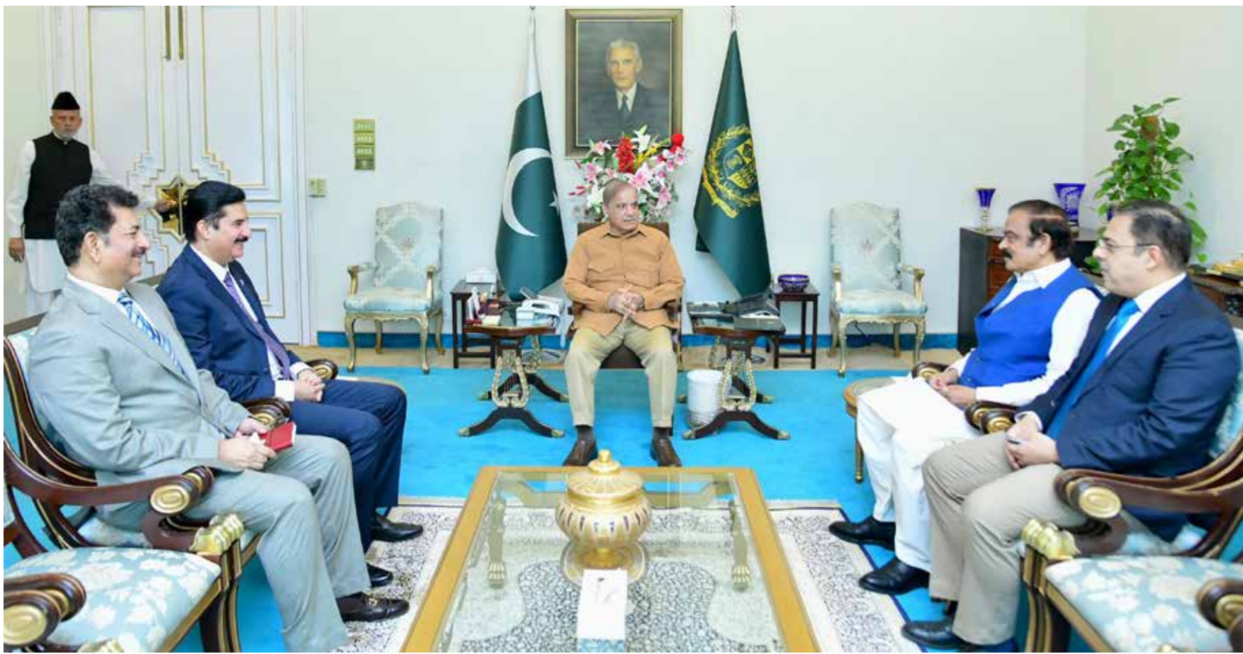
ISLAMABAD: Governor Khyber Pakhtunkhwa Faisal Karim Kundi calls on Prime Minister Muhammad Shehbaz Sharif.