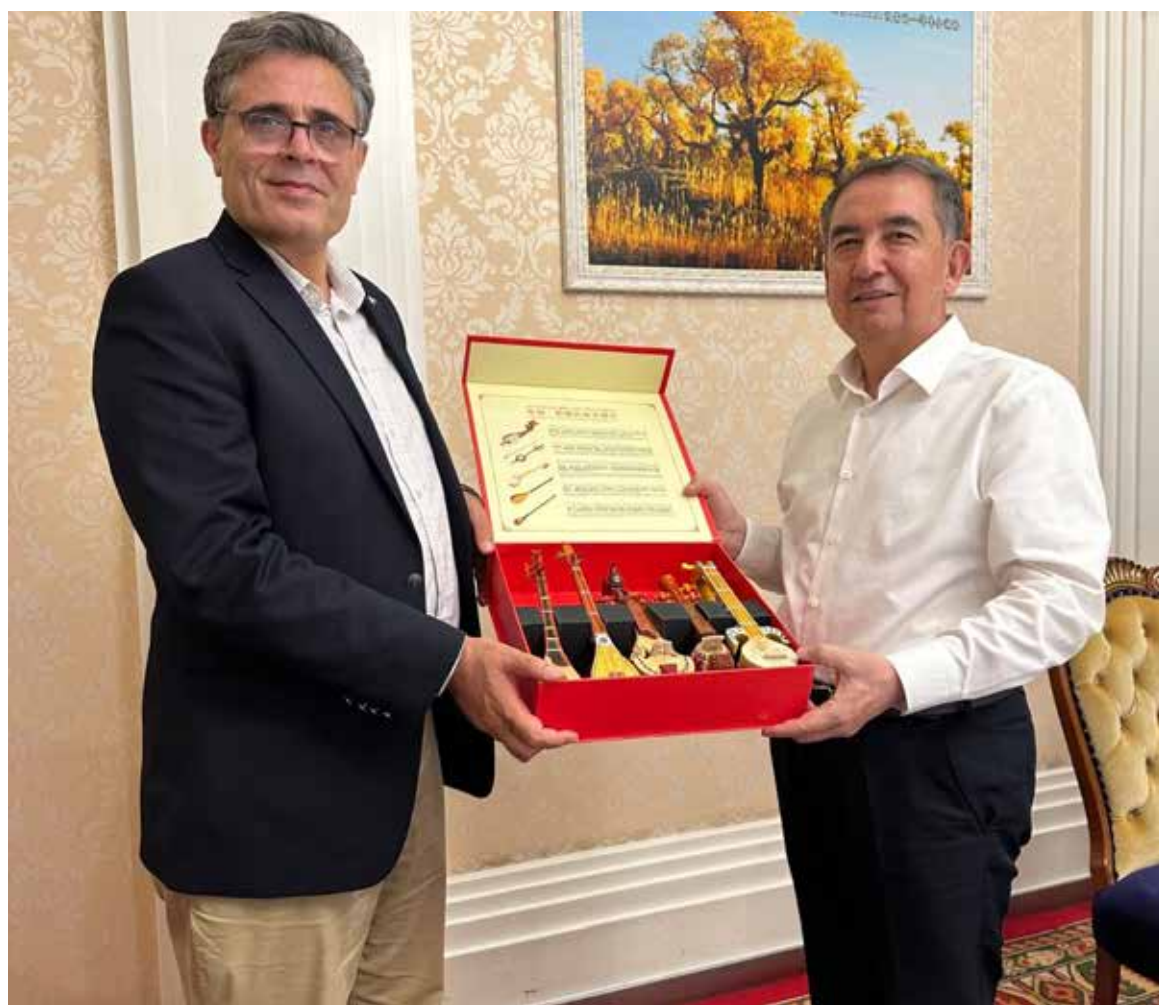
BEIJING: Pakistan Ambassador Khalil Hashmi meet with Anivar Tursen, Commissioner of the Kashi Prefectural Region. Both exchanged views on strengthening bilateral cooperation.—DNA