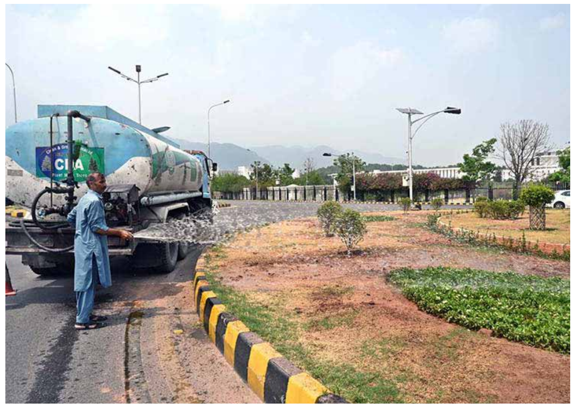
ISLAMABAD: CDA worker busy in showering water on plants in front of Parliament House.

relations between the two countries will increase. He said that for the promotion of bilateral trade between the two countries, not only the market but also sector diversification is needed, which will increase mutual trade. The Senior diplomat said that the role of the local private sector, especially the Chamber of Commerce of Baluchistan, is important in the bilateral economic integration of the two countries. Rahmat said that the business community and chambers in Pakistan should go ahead and promote trade between Indonesia and Pakistan. He said that there is a need for further promotion of people-to-people relations between the two countries so that the people of the two countries come closer to each other.