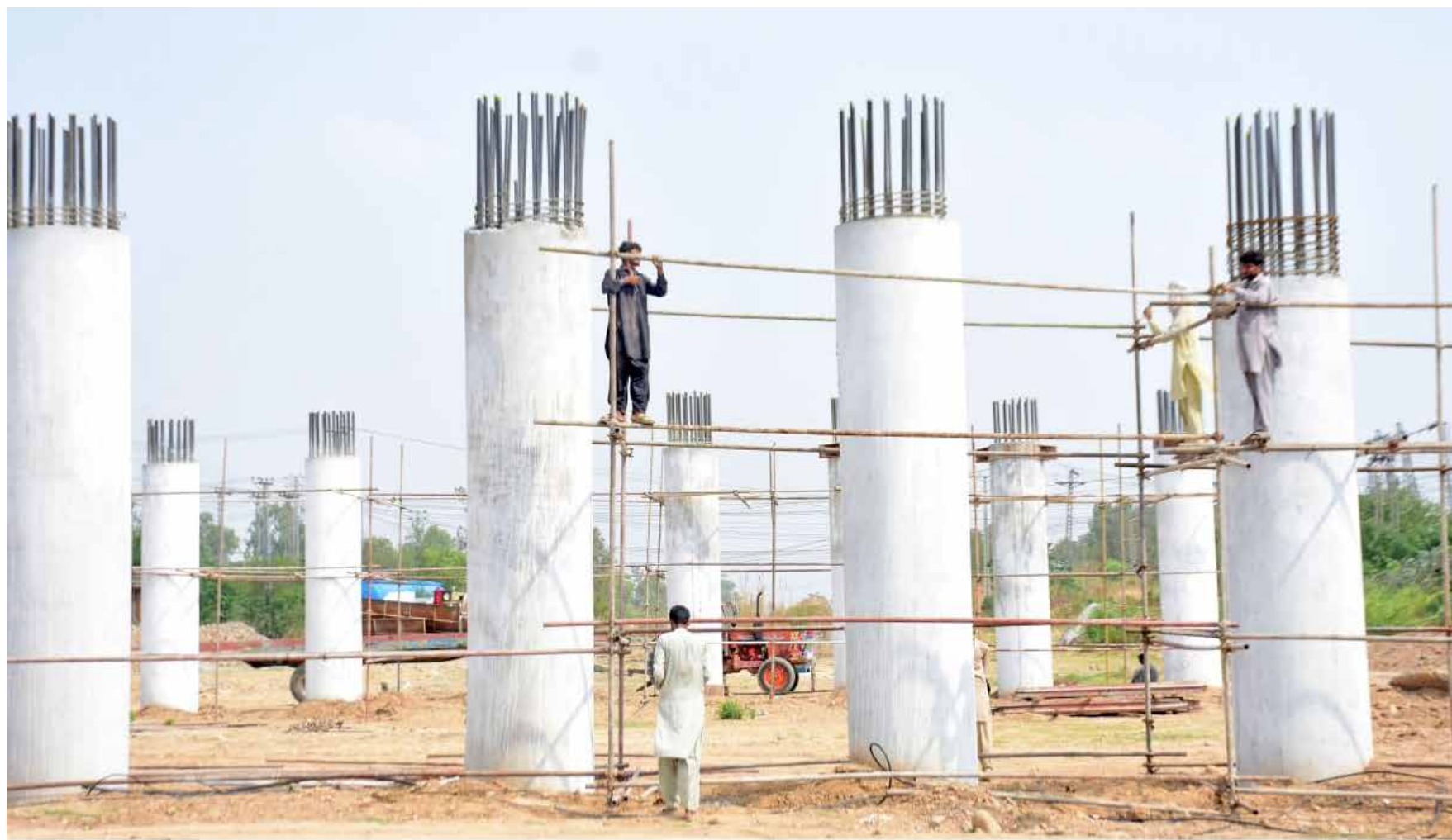
ISLAMABAD: Work continue on the construction project of an Overhead bridge at Sector 1-10 for connecting Sector H-10 to 1-10 and onwards with Margallah Avenue in the Federal Capital.