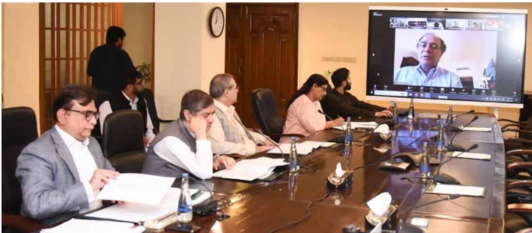
ISLAMABAD: Federal Minister for Finance & Revenue Senator Muhammad Aurangzeb presiding over a meeting of Economic Coordination Committee (ECC) in Islamabad.

NIGER: At least 18 people have been killed and 30 injured in a series of deadly blasts in Nigeria thought to have been carried out by female suicide bombers. One of the bombings is reported to have killed six people and injured others at a wedding ceremony on Saturday, in the north-eastern Borno state. The state's emergency management agency said the co-ordinated attacks targeted a wedding, the victims' subsequent funeral and a hospital in the town of Gwoza. President Bola Tinubu condemned the attacks calling them "desperate acts of terror" in a statement shared by his media aide on Facebook. He vowed stern action against those responsible for the killings in the town of Gwoza and insisted that the incident had not undermined recent gains made against jihadists. "The president declares that the purveyors of wanton violence shall have a certain encounter with justice. - Agencies