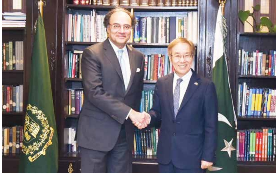
ISLAMABAD: Federal Minister for Finance and Revenue Senator Muhammad Aurangzeb had a meeting with the Korean Ambassador and representatives of Korean Companies working in Pakistan.—DNA

Korean companies briefed the Minister on their concerns regarding project timelines and operational efficiency. The Finance Minister underscored the significant macroeconomic improvements and noted the positive trend in foreign exchange reserves. Furthermore, Senator Mr. Muhammad Aurangzeb reiterated the commitment of the Government to address the challenges faced by Korean companies operating in Pakistan and in this regard urged the relevant authorities to ensure their facilitation for smooth business operations. The meeting concluded with a pledge to strengthen economic cooperation between Pakistan and Korea and to work collectively towards addressing mutual concerns for the benefit of both nations.—DNA