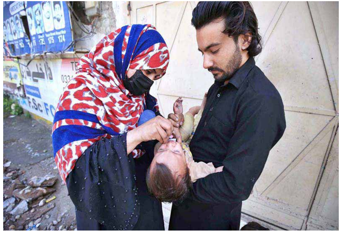
PESHAWAR: Lady Health Worker administering polio drops to a child during anti polio campaign in the Provincial Capital.

her. The PM's aide underscored that the press club was more than most welcome for collaborations to organise capacity building workshops and awards for supporting the journalist fraternity in improving its climate reporting skills.