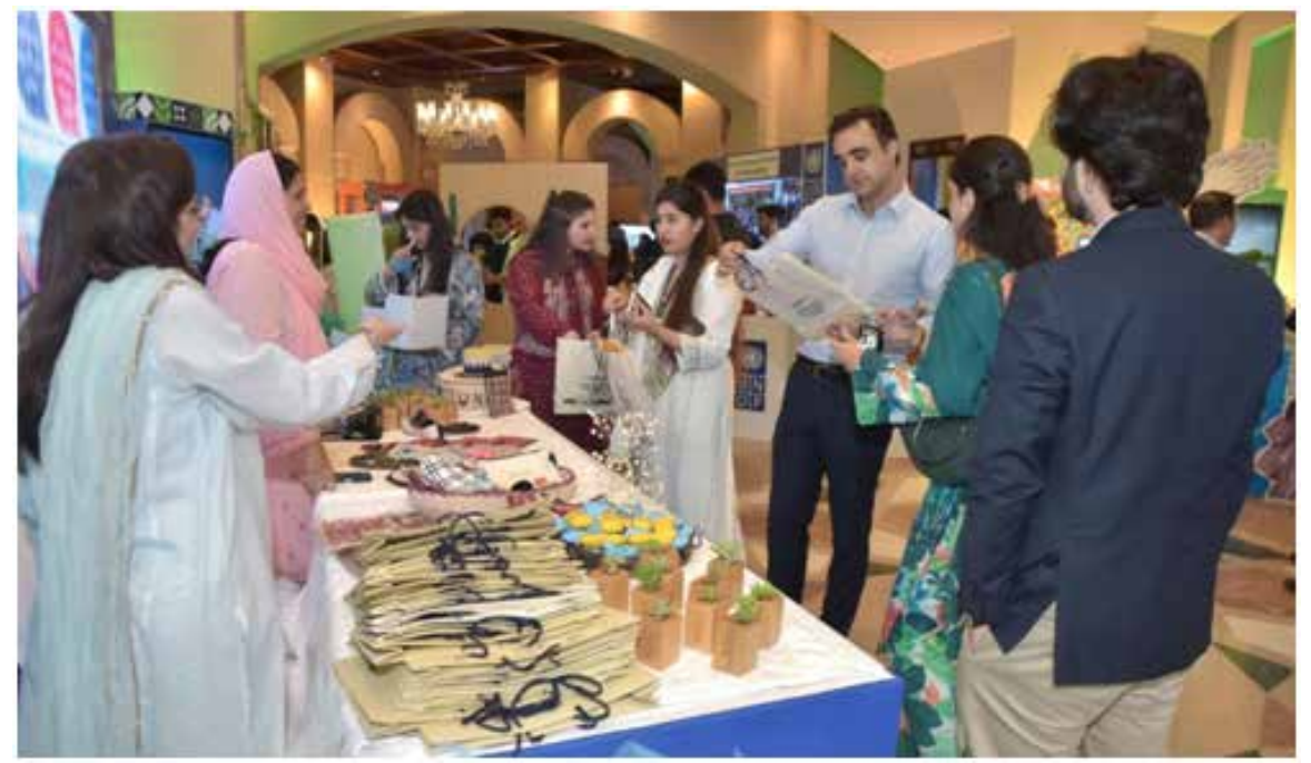
ISLAMABAD: Visitors taking interest in various items displayed on the sidelines of the World Environment Day celebrated at Islamabad Serena Hotel.