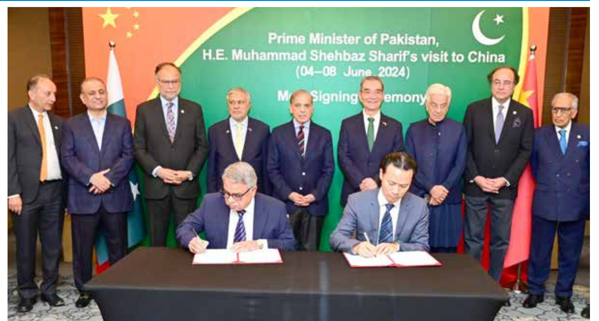
BEIJING: Prime Minister Shehbaz Sharif witnesses signing of Memorandums of understanding regarding cooperation in different fields between China and Pakistan on 6 June 2024.