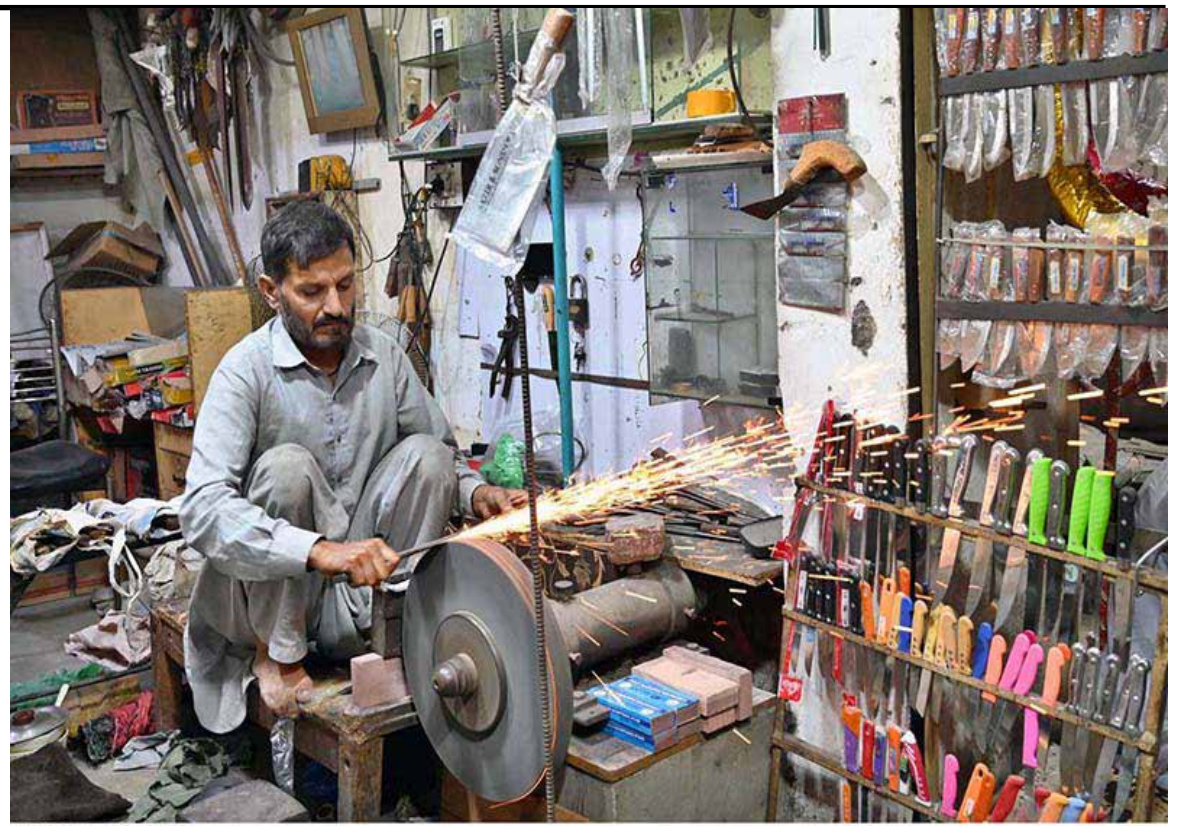
LAHORE: A blacksmith busy in sharpening knives to be used for slaughtering sacrificial animals during upcoming Eid ul Azha.

and that appointment of a focal person by the ICCI will definitely go a long way in strengthening this collaboration. Secretary General United Business Group Zafar Bakhtawari, while welcoming the distinguished guest emphasised the significance of industry-academia cooperation by saying that ICCI is keen to evolve a formal mechanism under the guidance of the NUML for strengthening a viable relationship for the development of corporate sector as per the market economy. He said that ICCI-NUML should create a nucleus for economic, social and cultural linkages with all the countries whose languages like Chinese, German, French, Persian, Arabic etc. are being taught. Vice President Islamabad Chamber of Commerce and Industry Engr. Azhar ul Islam Zafar said that a vibrant industry-academia linkage will surely bear fruit. He also asserted business role models' regular lectures in the University to acquaint the students about the importance of corporate sector. Convener ICCI sub committee on Higher Education Commission Adnan Mukhtar said that Pakistan cannot progress without the active industry-academia linkage and that ICCI is playing a pro-active role for needful. ICCI Member Sajid Iqbal said that tasking University students for the preparation of feasibility studies about different projects will also be equally important. On this occasion, former SVP Khalid Chaudhry, Executive member Maqsood Tabish, Rizwan Chheena and Ch. Mohammad Ali were also present.