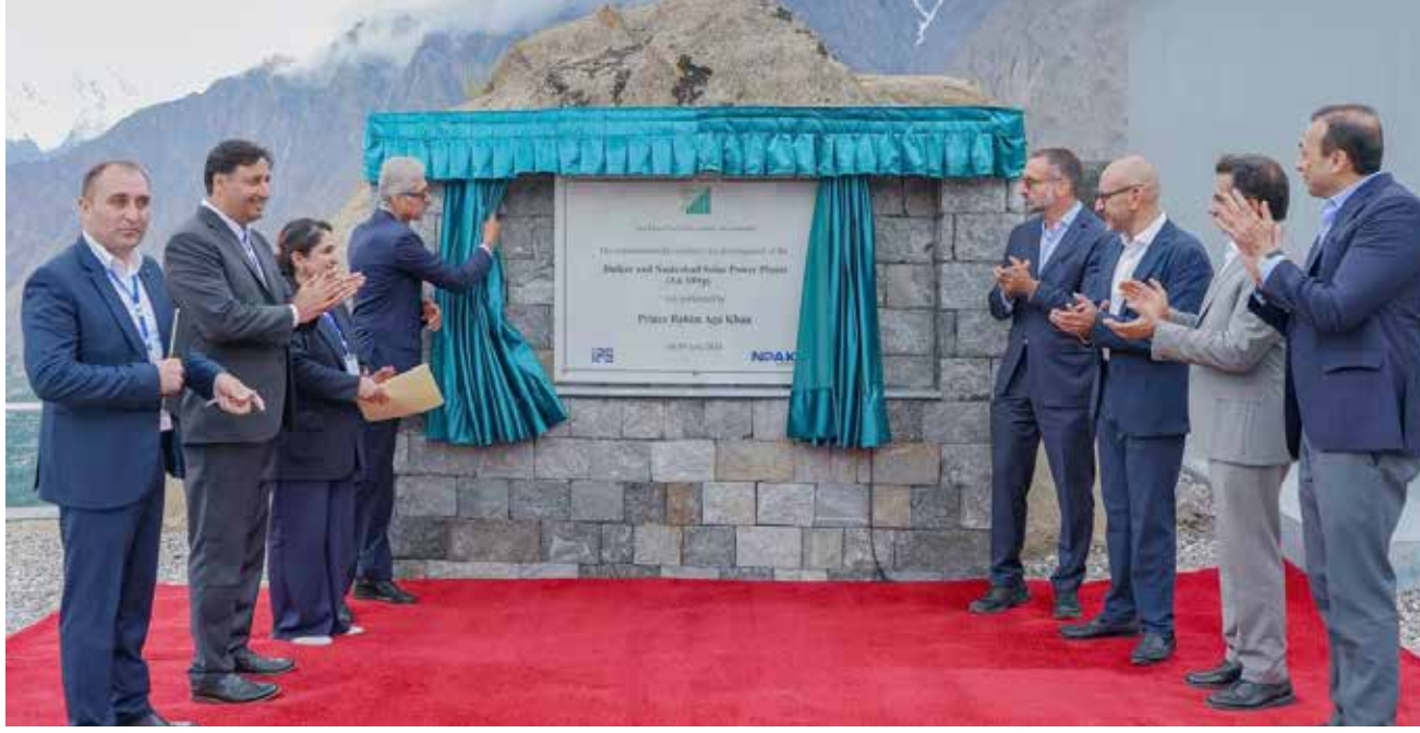
DNA HUNZA: Prince Rahim Aga Khan visited Hunza district in Gilgit-Baltistan to launch the development of Duiker Phase II and Na-

Phase I of Duiker Solar Power Plant, which has a generation capacity of 1MWp and 0.6MWh battery storage, commenced operations in Nov 2023, increasing the daily power availability for more than 11,000 people, from 10 to 17 hours in summer and from 4 to 9 hours in winter