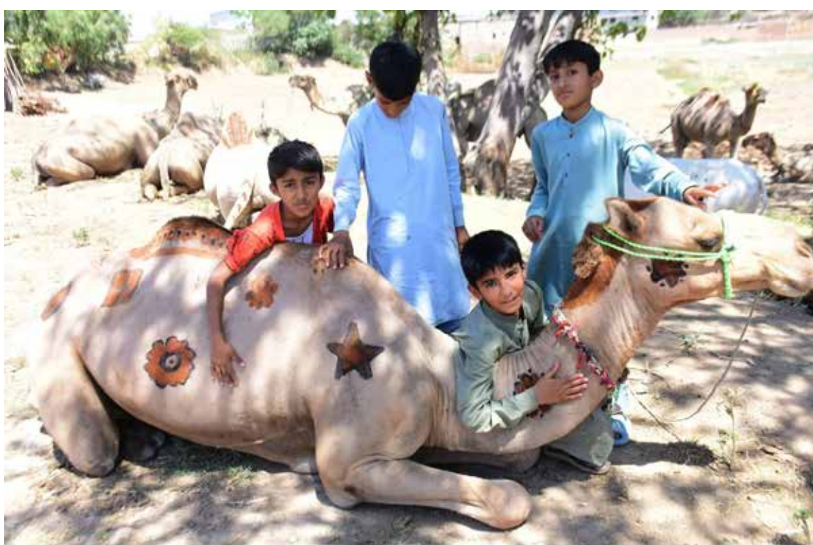
ISLAMABAD: Camels reach at Sector 1-14 Maweshi Mandi a head of Eid-ul-Adha.

to the allied coalition in WWII — served as a reminder that for all of Biden's talk of an unflagging U.S. commitment to Ukraine, recalcitrance among congressional Republicans and an isolationist strain in American politics have exposed its fragility. And, although unremarked upon, the specter of Donald Trump's candidacy loomed over the discussion, as the Republican former president and the presumptive nominee has spoken positively of Russian President Vladimir Putin and sparked Ukrainian concerns that he would call for it to cede territory to end the conflict. Zelenskyy pressed for all Americans to support his country's defense against Russia's invasion, and he thanked lawmakers for eventually coming together to approve the weapons package, which has allowed Ukraine to stem Russian advances in recent weeks.