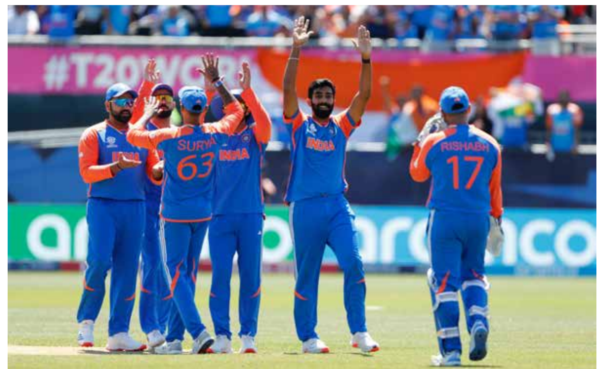
NEW YORK: Indian players celebrate after taking wicket against Pakistan in T20 World Cup match.