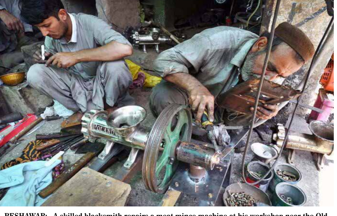
PESHAWAR: A skilled blacksmith repairs a meat mince machine at his workshop near the Old GTS bus stop, ensuring seamless work for the Eid ul-Adha feasts ahead.

ister expressed the desire to enhance the relations in relevant fields, including defence, defence industry and aviation which have immense potential to grow to the benefit of both countries. He also impressed upon the need of continued interaction between higher military and defence level leadership of the two