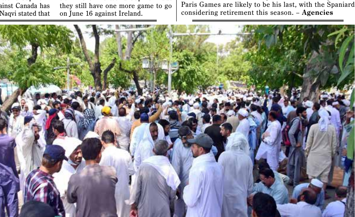
ISLAMABAD: Government employees hold a protest in favor of their demands at Pak-Secretariat in the Federal Capital.

regardless of the team's performance in the first two games of the T20 World Cup 2024, these are the players who are going to play the rest of the tournament and represent Pakistan. "Whatever their performance, they are to play the rest of the tournament. For that, they require all the support." The chairman also assured that the internal matters of the team are being discussed in the PCB at large. However, he also stated that anything revealed about it in public right now is not suitable. "We are discussing matters regarding the team and for now, to talk about it is not suitable." The Pakistan cricket team is on the edge of disqualification in the T20 World Cup 2024 but they still have one more game to go