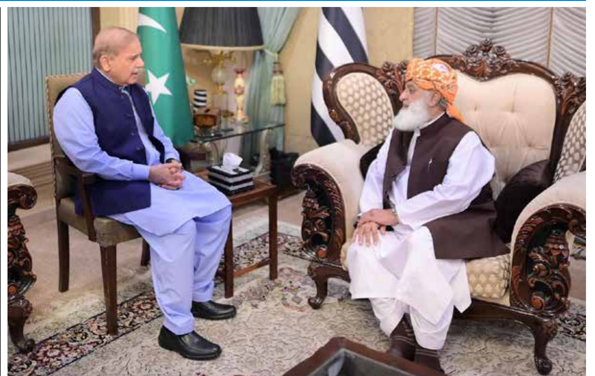
ISLAMABAD: Prime Minister Shehbaz Sharif meets Maulana Fazlur Rehman.