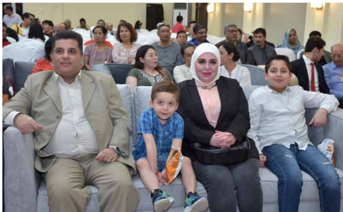
ISLAMABAD: Ambassador of Syria and his family enjoying the Indonesia movie screened at the Indonesia embassy. Detailed news on the Back Page. —DNA

ISLAMABAD: Indus River System Authority (IRSA) on Friday released 295,300 cusecs water from various rim stations with inflow of 257,000 cusecs. According to the data released by IRSA, water level in River Indus at Tarbela Dam was 1445.06 feet and was 47.05 feet higher than its dead level of 1,398 feet. Water inflow and outflow in the dam was recorded as 101,300 cusecs and 120,000 cusecs respectively. The water level in River Jhelum at Mangla Dam was 1183.20 feet, which was 133.20 feet higher than its dead level of 1,050 feet. The inflow and outflow of water was recorded 45,400 cusecs and 65,000 cusecs respectively. The release of water at Kalabagh, Taunsa, Guddu and Sukkur was recorded as 169,200, 153,600, 104,000 and 53,900 cusecs respectively. Similarly, from River Kabul, a total of 74,700 cusecs of water released at Nowshera and 9,600 cusecs released from River Chenab at Marala.—APP