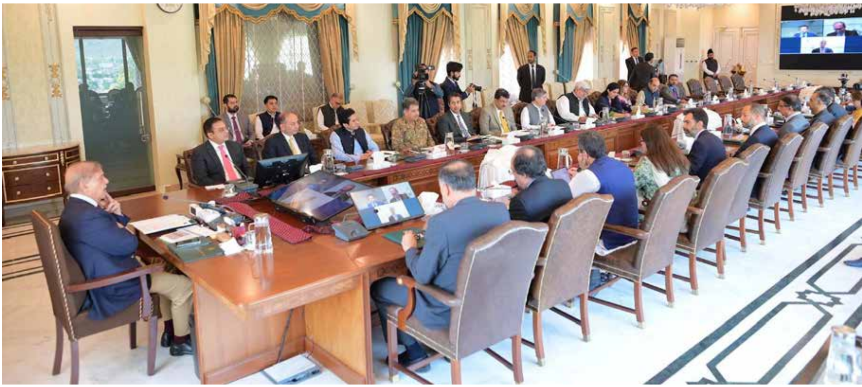
Islamabad: A delegation of an International Consultancy Firm called on Prime Minister Muhammad Shehbaz Sharif.