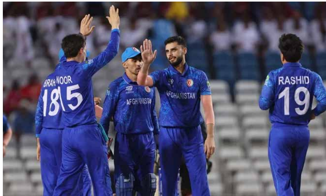
Doriga was the highest score for PNG with 27 runs in 32 balls. Pacer Fazalhaq Farooqi was the pick of the bowlers for Afghanistan

WASHINGTON: Afghanistan defeated Papua New Guinea on Friday by seven wickets at the Brian Lara Stadium, Tarouba, Trinidad, during the ongoing T20 World Cup 2024. The win helped Afghanistan qualify for the Super 8 while also eliminating New Zealand from the T20 World Cup. Chasing a modest target of 95 runs, Afghanistan reached home in 15.1 overs for the loss of three wickets. Openers Rahmanullah Gurbaz (7) and Ibrahim Zadran (0) were dismissed early but Gulbadin Naib scored an unbeaten 49 runs in 36 balls, with the help of four fours and two sixes, to take his side over the line. Earlier, a clinical bowling display helped Afghanistan dismiss PNG for only 95 runs in 19.5 overs. PNG quickly slipped to 17-4 in the fourth over of the innings which severely dented their chances of posting a competitive total on the board. Wicketkeeper-batter Kiplin