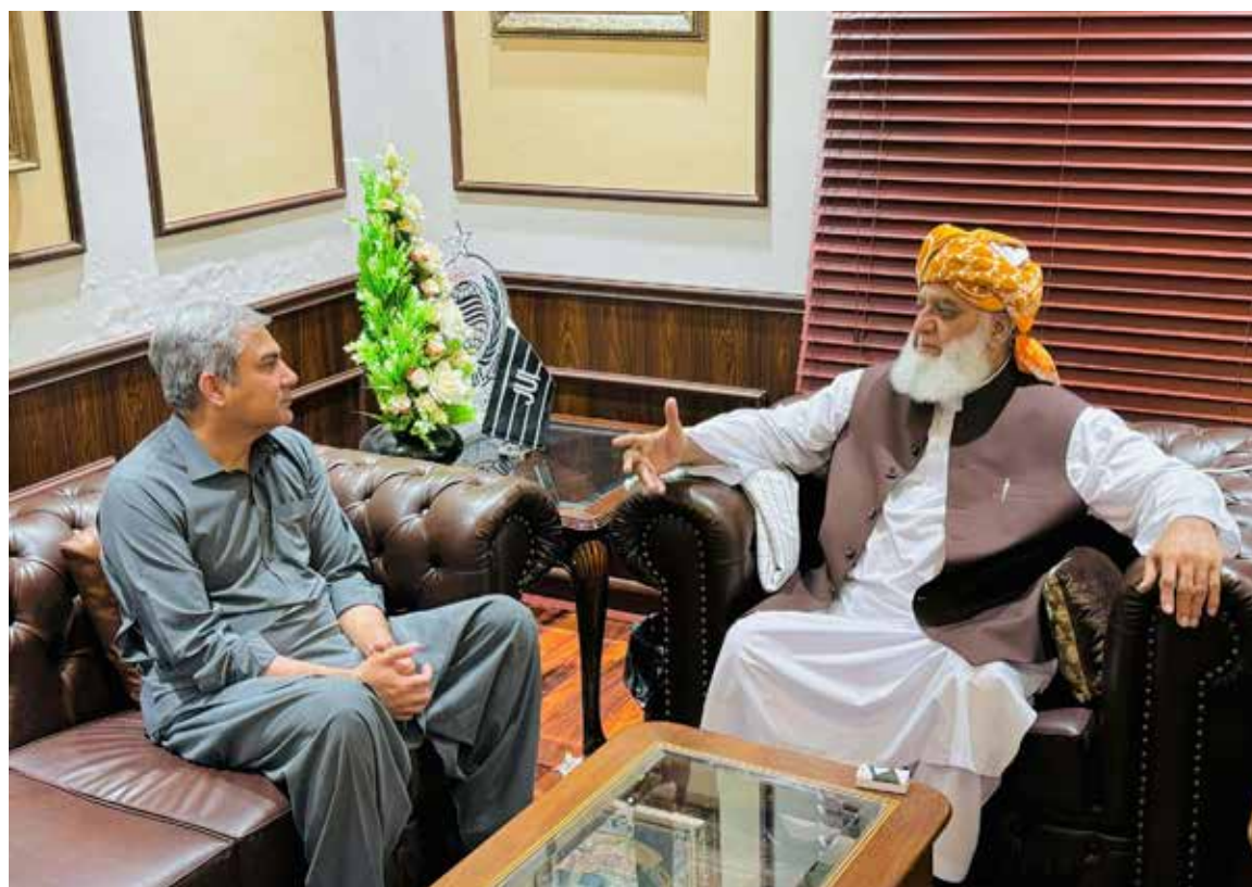
ISLAMABAD: Federal Minister for Interior Mohsin Naqvi in a meeting with JUI (F) Chief Maulana Fazal-ur-Rehman.