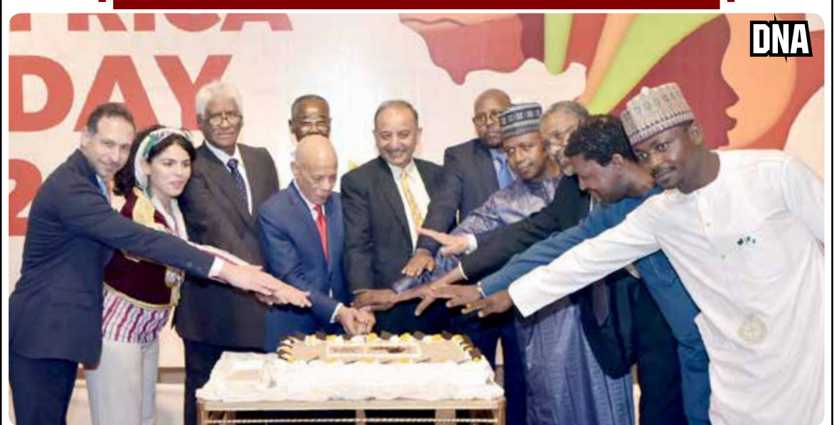
ISLAMABAD: Federal Minister for Energy Mussadaq Masood Malik, Dean of the African group Mohamed Karmoune, Ambassador of Morocco and heads of missions of the African countries cutting cake to celebrate the Africa Day.