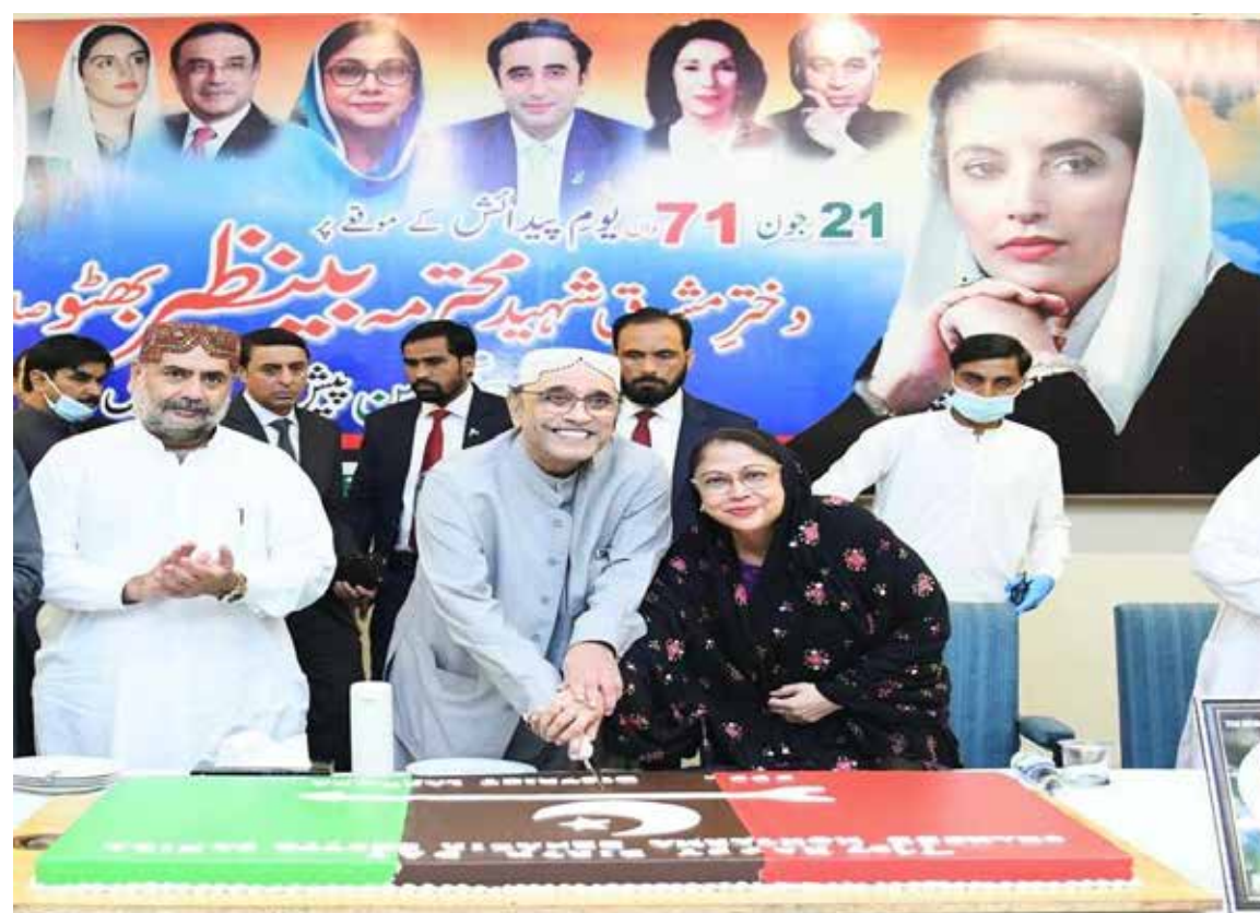
LARKANA : President Asif Ali Zardari cutting cake on the 71st birth anniversary of Shaheed Mohtarma Benazir Bhutto at Garhi Khuda Baksh Bhutto.