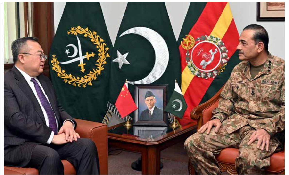
RAWALPINDI Mr. Liu Jianchao, Minister of the International Department of the Central Committee of the Communist Party of China (IDCPC), met General Syed Asim Munir, NI (M), Chief of Army Staff (COAS), at General Headquarters.

Galiyat saw the highest number of visitors with over 237,500 visiting the area during the five days while 151,900 visited Malam Jabba. As many as 92,470 tourists visited Kurnat Valley while 77,372 toured Naran and Kaghan areas, the data showed. Pakistan's inflation last year peaked at 36.4 percent during April 2023 while food inflation surged to 49.1 percent. The South Asian country's inflation outpaced price gains even in Sri Lanka as its currency depreciated and Pakistan hiked fuel and energy prices to comply with the International Monetary Fund (IMF). In March 2024, however, Pakistan's inflation rate measured by the Consumer Price Index (CPI) fell to 20.7 percent, its lowest in 23 months. However, the country continues to face significant financial challenges, with dwindling foreign exchange reserves and a weak national currency.