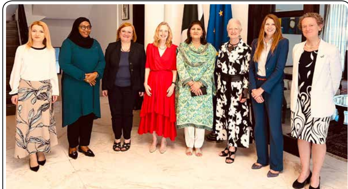
ISLAMABAD: Female ambassadors/high commissioners in Islamabad including Ambassadors of Bulgaria, Italy, the Netherlands, European Union, High Commissioners of UK and Canada had a meeting with the first-ever Lt. General of Pakistan Army Nigar Johar. The participants exchanged views on a variety of issues. - DNA