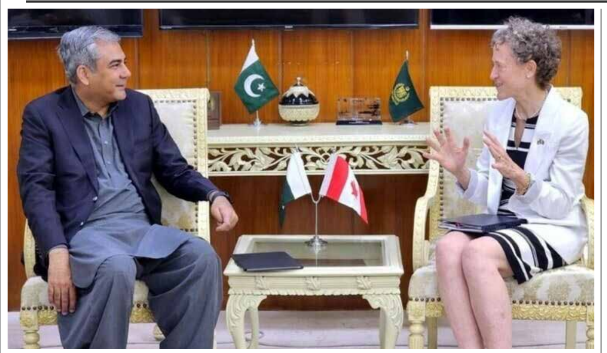
ISLAMABAD: Canadian High Commissioner Scanlon Leslie meets Syed Mohsin Raza Naqvi, Federal Minister for Interior & Anti-Narcotics.

The minister detailed that total receipts were estimated at Rs 201.17 billion, with Rs. 105 billion anticipated from the Federal Government under the Federal Variable Grant, Rs 75 billion from inland revenue, Rs 15 billion from electricity, and Rs 0.45 billion from the Forest Department. -APP