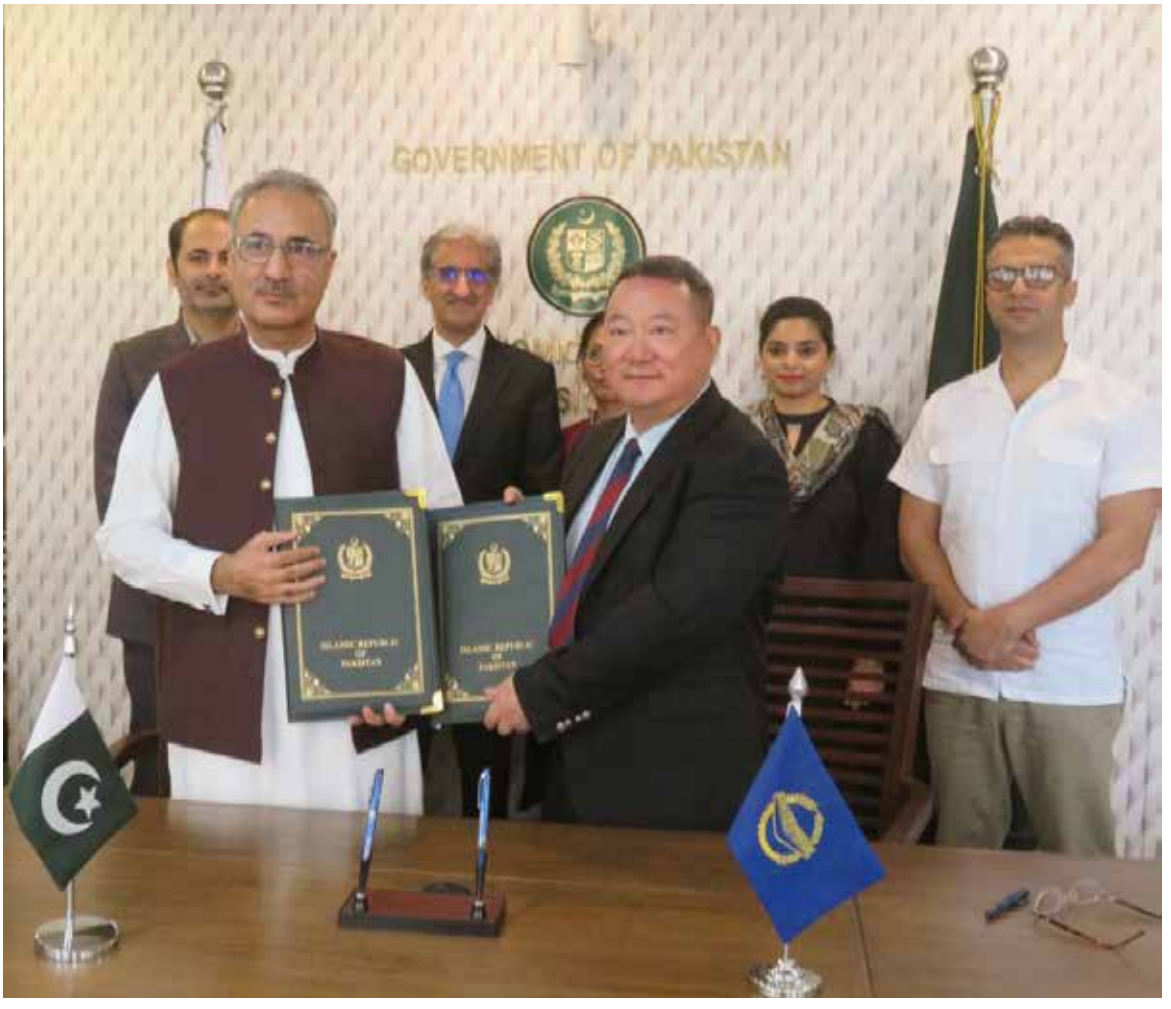
ISLAMABAD: Pakistan and Asian Development Bank have signed a US$ 250 million loan to strengthen Public-Private Partnerships. This initiative aims to enhance infrastructure development and foster sustainable economic growth.