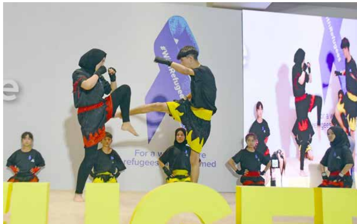
ISLAMABAD: Muay Thai sport performance by the Afghan Refugee Students on the occasion of World Refugee Day in the Federal Capital.

5 sub-inspectors, 10 assistant sub-inspectors, 50 head constables and 500 constables. On the occasion, KP CM said the creation of new posts was aimed at improving the law and order situation in the area. The cabinet also approved the introduction of a traffic warden system in other divisional headquarters on the lines of Peshawar, Swat, and Abbottabad. And for this 1,179 posts to be created for traffic warden in new divisional headquarters. The traffic wardens posts include superintendent of police, traffic officer, senior warden, warden, head constable, and junior patrolling officer.