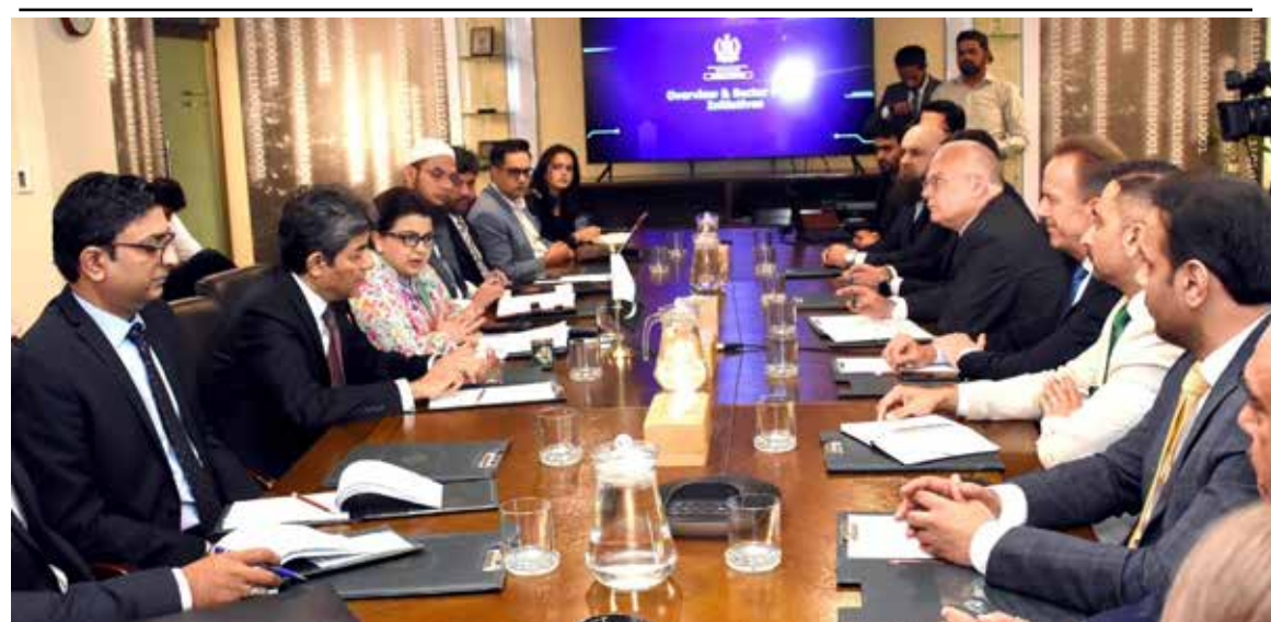
ISLAMABAD: Minister of State for IT and Telecommunication Ms. Shaza Fatima Khawaja addressing Roundtable on IT and Digitalisation with Swedish companies.