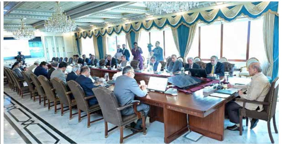
ISLAMABAD: Prime Minister Muhammad Shehbaz Sharif chairs a meeting regarding promotion of Pakistan-Azerbaijan economic ties. - DNA