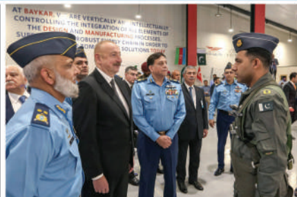
RAWALPINDI: President of Azerbaijan Ilham Aliyev witnessing a military exhibition at the "National Aerospace Science and Technology Park".