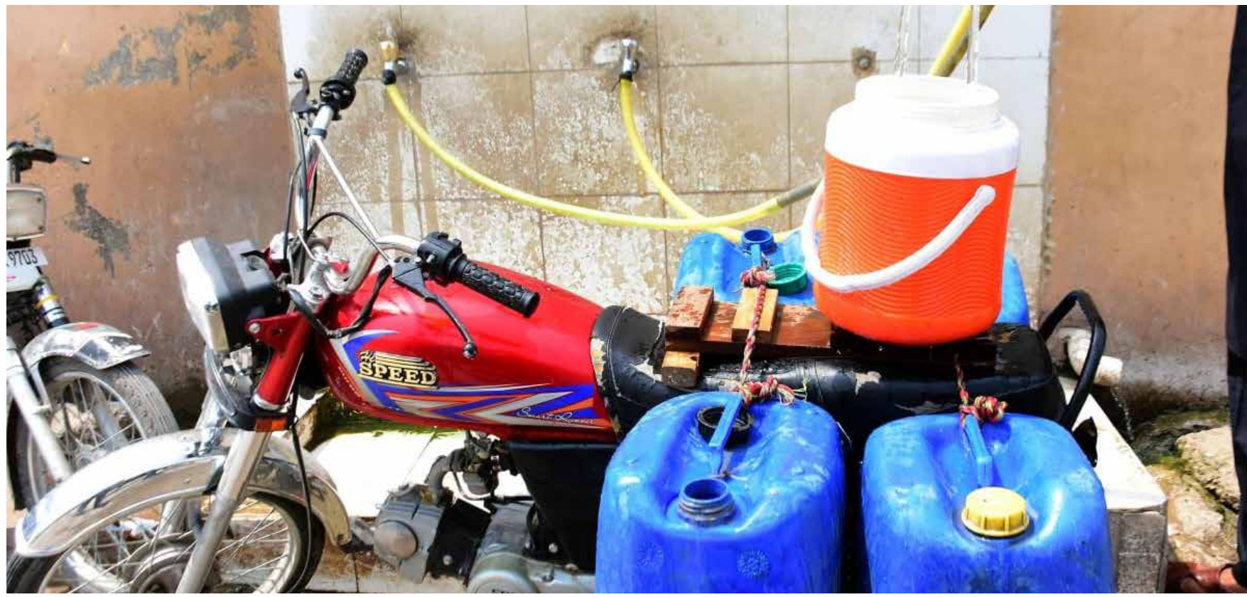
ISLAMABAD: People filling clean drinking water from a filtration plant at sector D-12 in the Federal Capital.

ISLAMABAD: Oil and Gas Development Company Limited (OGDCL) on Monday announced the successful revitalization of the Nashpa-4 well, situated within the Nashpa Development and Production Lease (D&PL) in Karak, Khyber Pakhtunkhwa province. OGDCL thoroughly re-evaluated the well for the potential of the upper zone of the Lockhart formation and achieved a significant increase in the well's production capacity said a news release. The Nashpa-4 well is now producing an additional 330 barrels per day (BBL/day) of oil and 7.7 million standard cubic feet per day (MMSCF/day) of gas at a wellhead flowing pressure (WHFP) of 1570 PSI. Additionally, 21 metric tons per day (MT/day) of LPG is being recovered, contributing to the country's energy supply.—APP