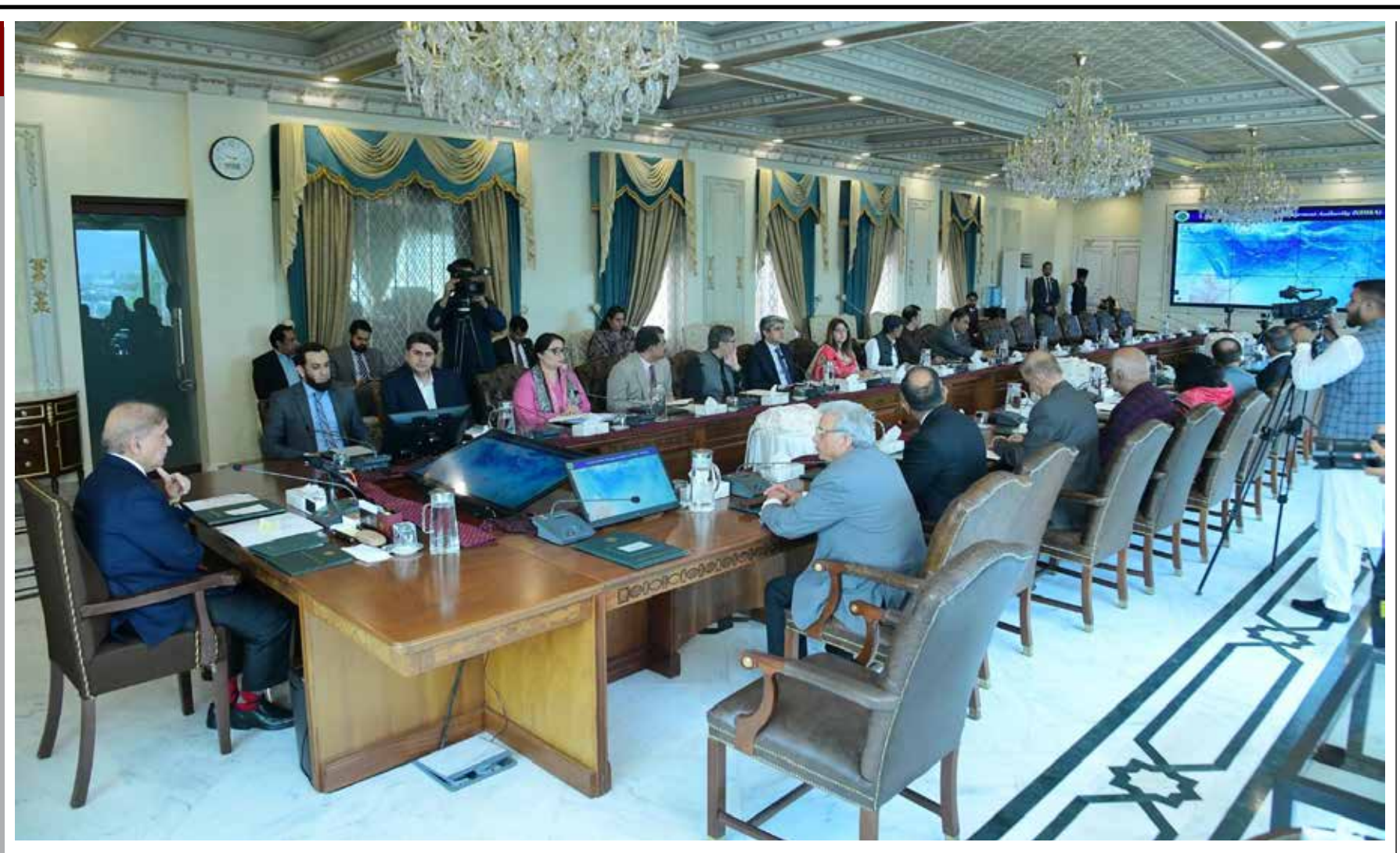
ISLAMABAD: Prime Minister Muhammad Shehbaz Sharif chairs a meeting regarding national preparedness for the Monsoon.