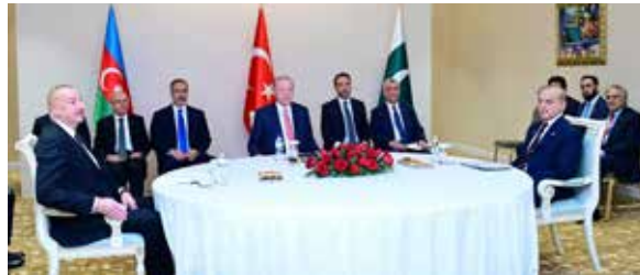
ASTANA: Prime Minister Muhammad Shehbaz Sharif in an inaugural session of Pakistan-Turkiye-Azerbaijan Trilateral Summit alongwith President of Turkiye H.E. Recep Tayyip Erdogan and President of Azerbaijan H.E. Ilham Aliyev, on the sidelines of Shanghai Cooperation Organisation Summit.

PM Shehbaz says bilateral ties neither driven by "geopolitical contingency" nor impacted by relations with other countries