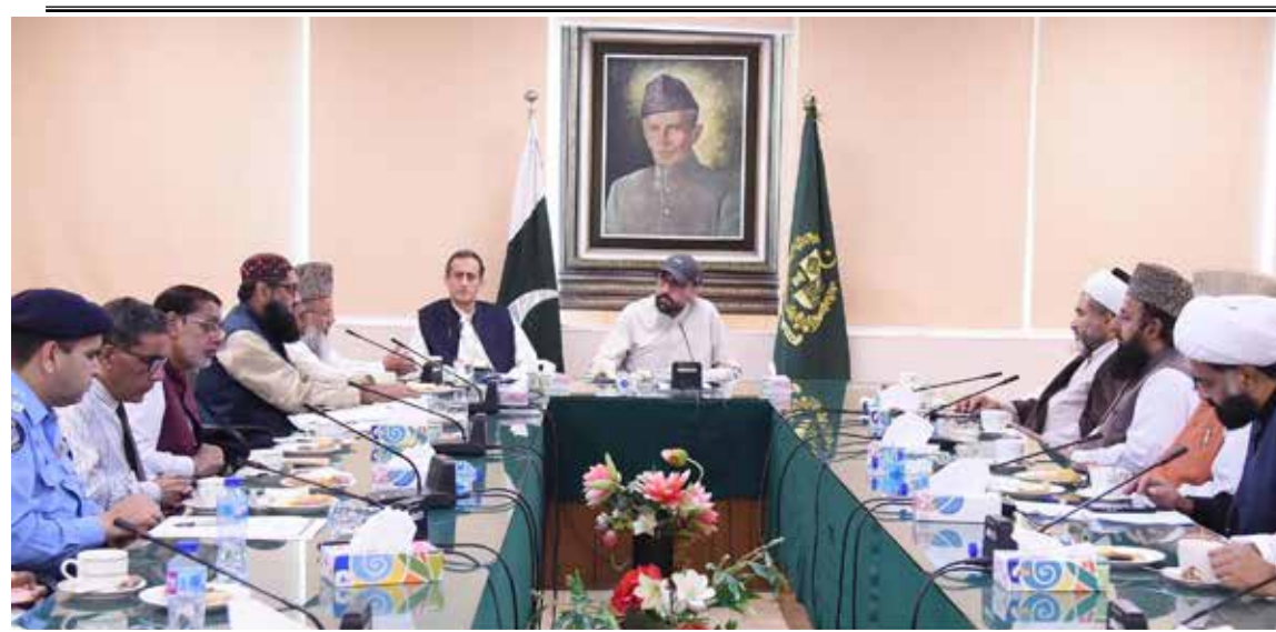
ISLAMABAD: Federal Minister of Religious Affairs and Interfaith Harmony, Chaudhry Salik Hussain chairing a meeting regarding inter-religious harmony during Muharram-ul-Haram.—DNA

ISLAMABAD: The price of per tola of 24 karat gold increased by Rs.800 and was sold at Rs.242,300 on Wednesday against its sale at Rs. 241,500 on last trading day. The price of 10 grams of 24 karat gold also increased by Rs.686 to Rs.207,733 from Rs. 207,047 whereas that of 10 gram 22 karat gold went up to Rs.190,422 from Rs. 189,793, the All Sindh Sarafa Jewellers Association reported. The price of per tola and ten gram silver remained constant at Rs.2,850 and Rs.2,443.41 respectively. The price of gold in the international market increased by $21 to $2,345 from $2,324, the Association reported.—APP