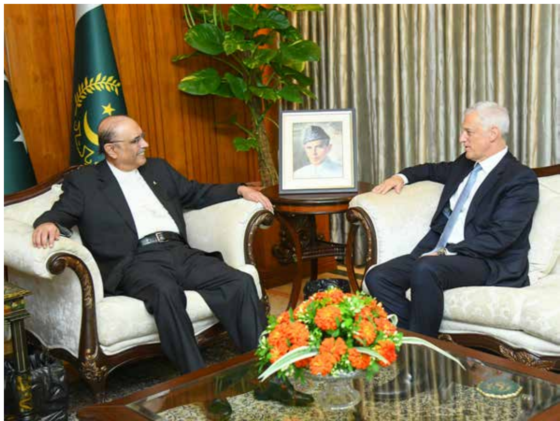
Islamabad: Group Chief Executive of the Standard Chartered Bank, Bill Winters, called on President Asif Ali Zardari, at Aiwan-e-Sadr.