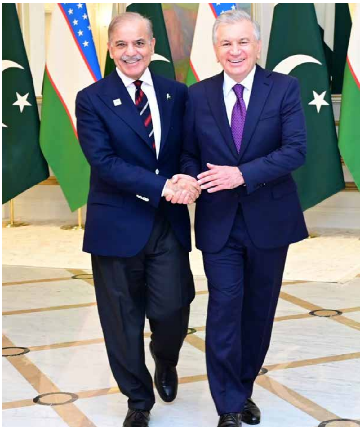
ASTANA: Prime Minister Muhammad Shehbaz Sharif meets with President of Uzbekistan Shavkat Mirziyoyev on the sidelines of Shanghai Cooperation Organisation Summit.