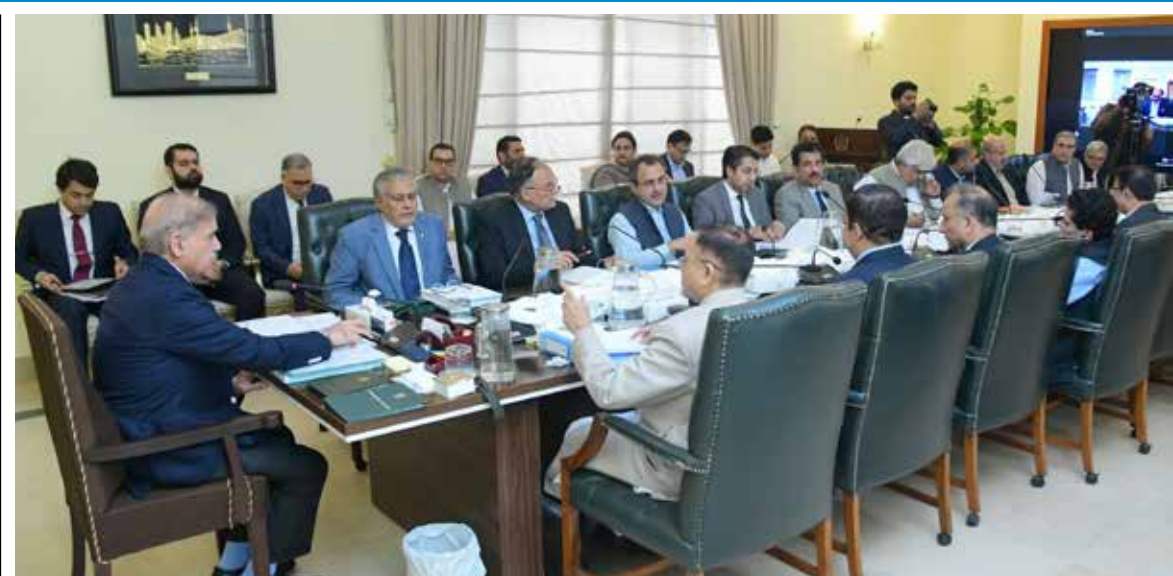
ISLAMABAD: Prime Minister Muhammad Shehbaz Sharif chairs a meeting of Cabinet Committee on Energy in Islamabad.