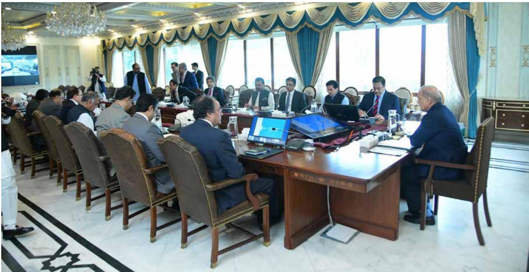
ISLAMABAD: Prime Minister Muhammad Shehbaz Sharif chairs a review meeting on Digitization and Reforms of FBR.

ADDIS ABABA: Ethiopia is grappling with a severe internal displacement crisis, with an estimated 4.5 million people forced from their homes primarily due to conflict as of June, according to a UN report released Thursday. The Somali, Oromia and Tigray regions are the most affected, said the report by the UN Office for the Coordination of Humanitarian Affairs (OCHA), with many displaced for prolonged periods. Over half of the internally displaced persons (IDPs) have been uprooted for more than a year, while an additional 23% have been displaced for two to four years and 11% for five years or more. Efforts to mitigate the crisis have facilitated the return of 3.3 million IDPs to their areas of origin since January 2022. But the total number of internally displaced persons remains high due to ongoing conflicts, and climatic crises have exacerbated the situation.—APP