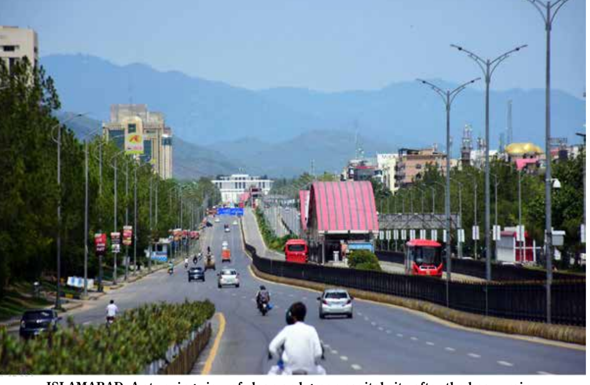
ISLAMABAD: A stunning view of clean and green capital city after the heavy rain, in the Federal Capital.