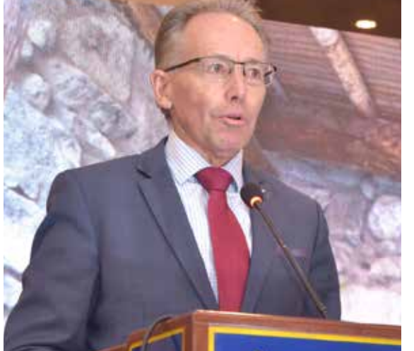
ISLAMABAD: Australian High Commissioner Neil Hawkins speaking on the occasion of book launching ceremony at Islamabad Serena Hotel.

Australian High Commissioner to Pakistan Neil Hawkins called for the development of budget-friendly accommodations in the area