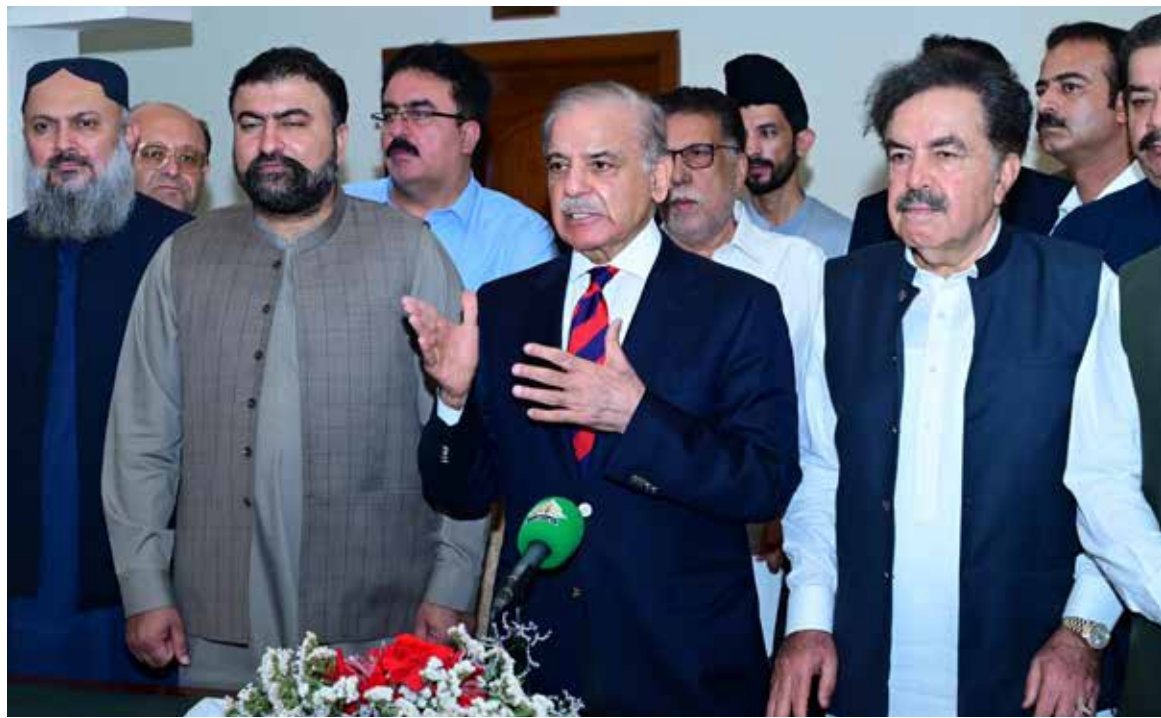
QUETTA: Prime Minister Muhammad Shehbaz Sharif talking to the media after the signing of agreement to solarise agricultural tubewells of Balochistan.