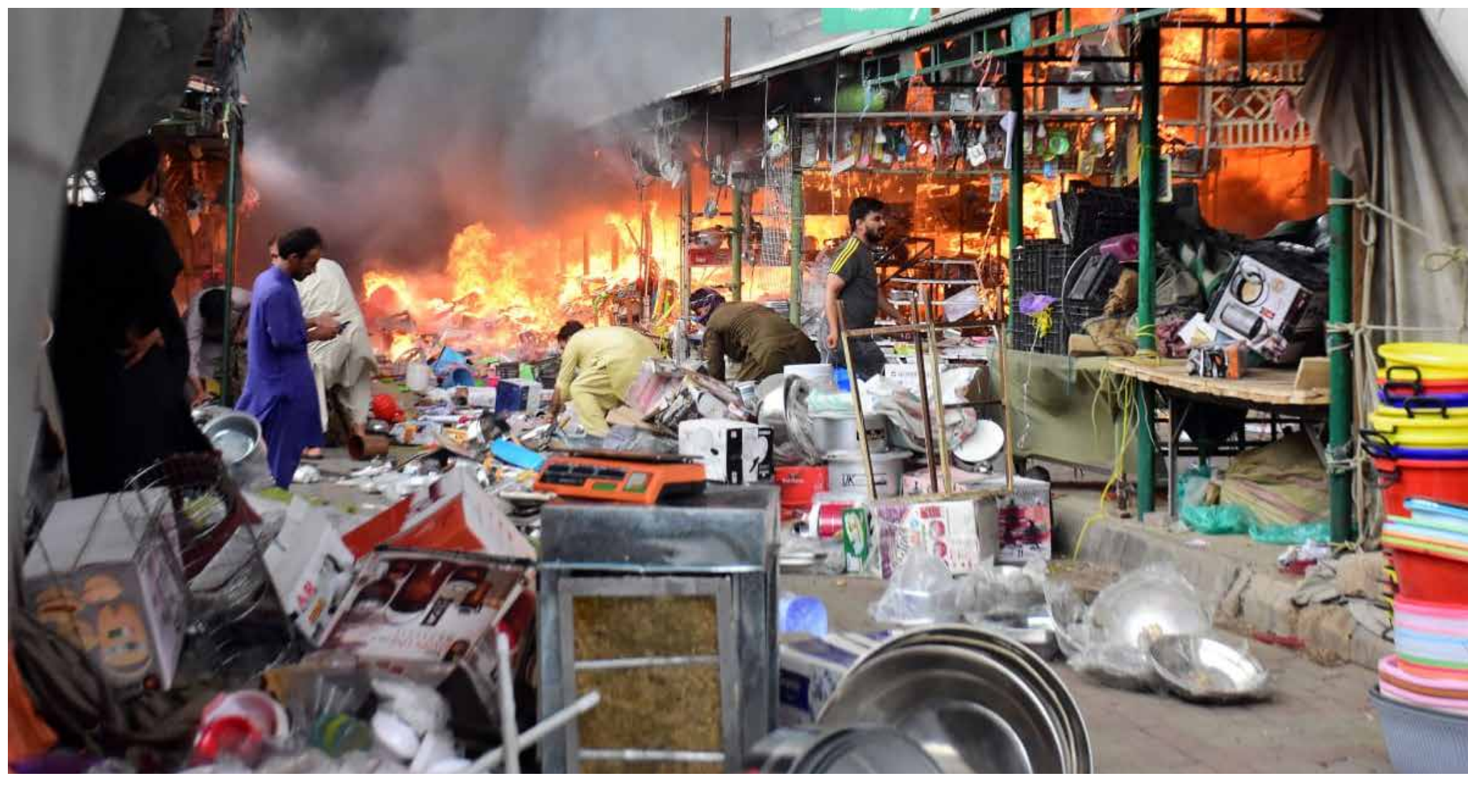
ISLAMABAD: Vendors try to save their belonging from their shops after a massive fire erupted at H-9 Sunday weekly bazaar in the Federal Capital, More than 100 shops were gutted in the fire that broke out in Sunday weekly bazaar.