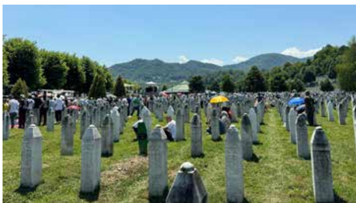
Bosnian Serbs, who continue to play down the crime. Bosnian Serb leader Milorad Dodik has repeat-

edly denied a genocide occurred and says his administration would not recognize the resolution. A