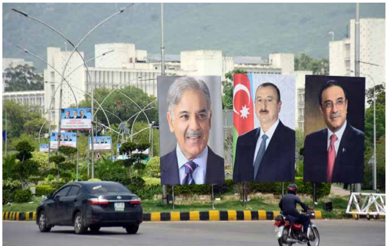
ISLAMABAD: A view of portraits of Prime Minister Shehbaz Sharif, President of Azerbaijan Ilham Aliyev, and President of Pakistan Asif Ali Zardari displayed on a green alongside a road in the Federal Capital. President of Azerbaijan Ilham Aliyev is arrived in Islamabad on July 11 for a two-day official visit to Pakistan at the invitation of Prime Minister Shehbaz Sharif.

ISLAMABAD: The consular office at the Ministry of Foreign Affairs in Islamabad will be closed on Friday (today), 12 July 2024, due to security arrangements for the visit of a foreign dignitary. In a statement released on Thursday, the Ministry announced that while the Islamabad consular office will be temporarily closed, the Liaison Offices in Gujrat, Lahore, Karachi, Quetta, and Peshawar will remain open to provide in-person consular services. To minimize inconvenience, the Ministry has also established courier service collection points for apostille document submission and collection in Islamabad, Lahore, and Karachi. The public is encouraged to utilize these facilities to avoid long queues. "We regret any inconvenience caused by the temporary closure of the consular office in Islamabad," said a spokesperson for the Ministry of Foreign Affairs. "Normal consular services will resume promptly on Monday, 15 July 2024."