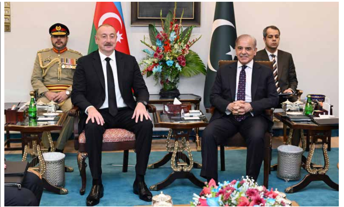
ISLAMABAD: President of the Republic of Azerbaijan Ilham Aliyev holds a meeting with Prime Minister of Pakistan Muhammad Shehbaz Sharif. - DNA