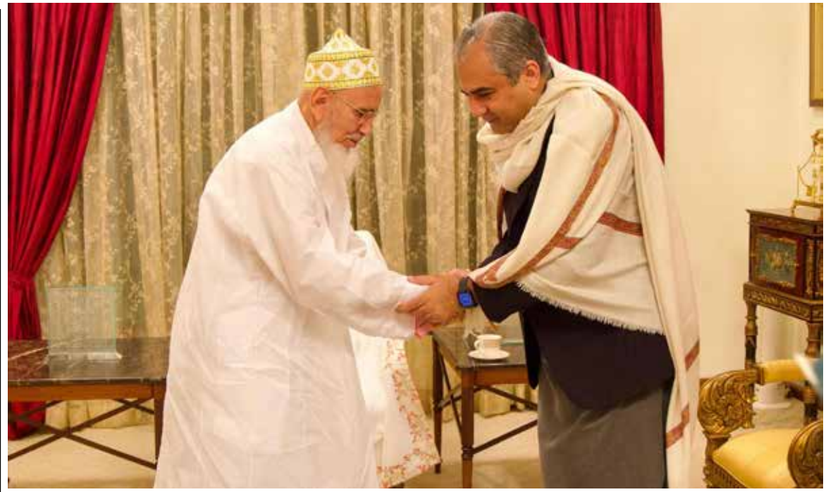
KARACHI: Federal Minister for Interior Mohsin Naqvi meeting with the Leader of Dawoodi Bohra Community Syedna Mufaddal Saifuddin.