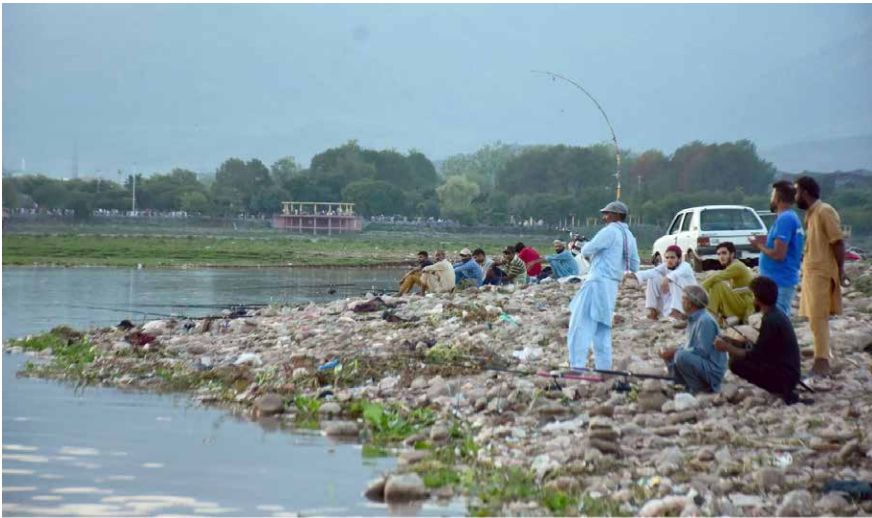
ISLAMABAD: People busy in fishing at Rawal Lake in the Federal Capital, fishing increased after a decrease in water level in the Rawal Lake.