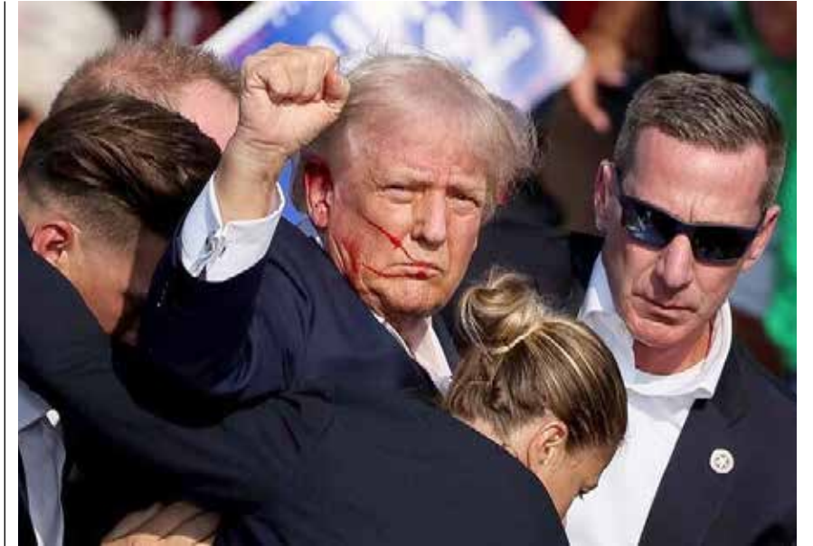
WASHINGTON: Former US President and Republican candidate Donald Trump responding to supporters' chants by waving his fist after assassination attempt.

ISLAMABAD: President Asif Ali Zardari has strongly condemned the attack on former US President Donald Trump's rally in Pennsylvania. He expressed deep shock over the attack, saying that such violence had no place in politics. The President expressed his best wishes for the speedy recovery of Mr Donald Trump and also offered heartfelt condolences over the loss of life in the attack. Prime Minister Muhammad Shehbaz Sharif on Sunday strongly condemned an attack on former US President Donald Trump during an election rally and expressed his deep grief. The prime minister, on X account, said that he just learnt that former President Trump was shot at an election rally. “This is a shocking development. I condemn all violence in politics. Wish the former President swift recovery and good health,” he further posted. PIT founder Imran Khan has also condemned attack on former US President Donald Trump. In his X message he said, ‘I strongly condemn the assassination attempt on former President Donald Trump at a campaign rally. Political violence is a tool of cowards and has no place in a democracy’. Imran Khan also wished him full recovery.