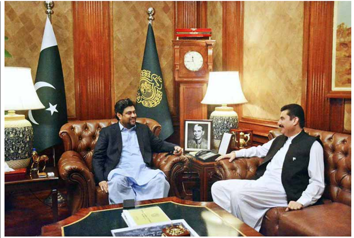
KARACHI: Khyber Pakhtunkhwa (KPK) Governor Faisal Karim Kundi in a meeting with Sindh Governor Kamran Tessori at Governor House.