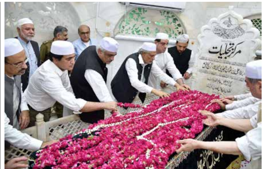
LAHORE: Deputy Prime Minister and Foreign Minister Muhammad Ishaq Dar laying floral wreath during the 981st annual ghusal of the shrine of Al-Shaikh Al-Syed Ali Bin Usman Al-Hajveri popularly known as Hazrat Data Ganj Bakhsh.