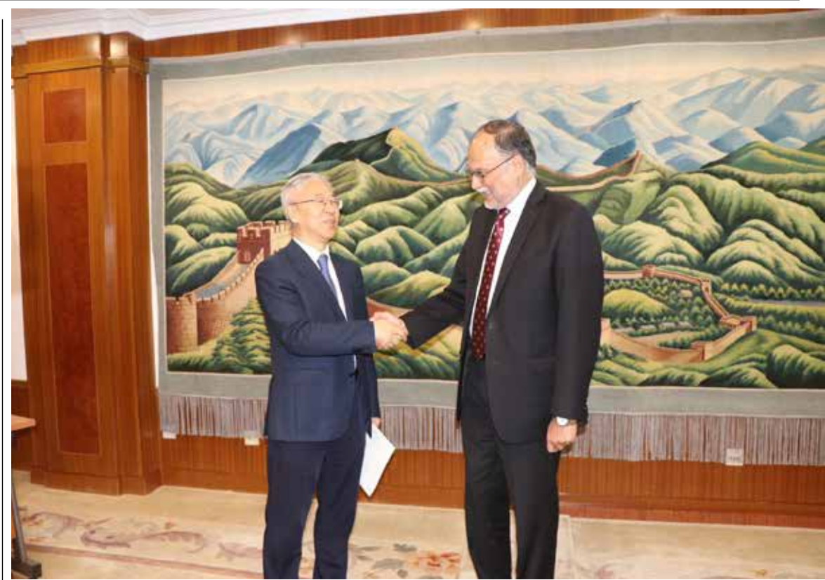
BEIJING: Minister for Planning, Development and Special Initiatives Prof. Ahsan Iqbal shaking hands with Mr. Zhao Chenxin, Vice Chairman of the National Development and Reform Commission (NDRC).