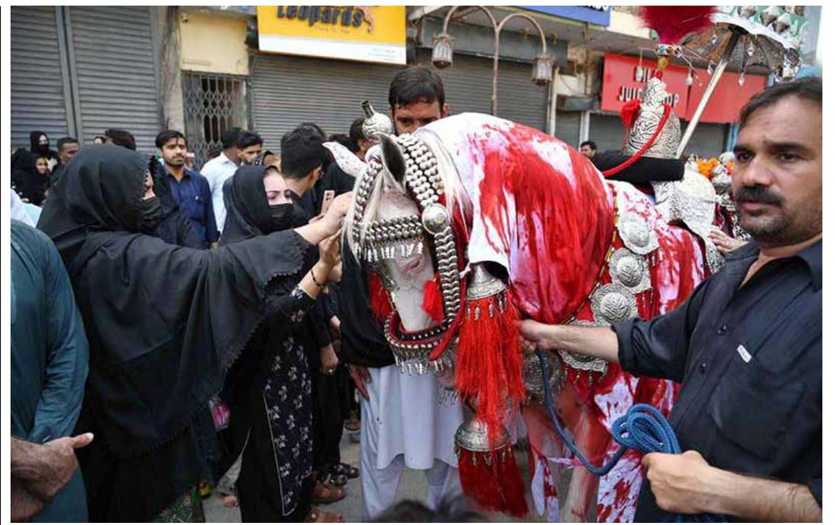
PESHAWAR: A large number of mourners attending the 9th Muharram Zuljinah procession passes through Saadar Road. Muharram Ul Haram is known as the first month of the Islamic calendar and the mourning month in remembrance of the martyrdom (Shahadat) of Hazrat Imam Hussain (RA), the grandson of the Holy Prophet Mohammad (PBUH).