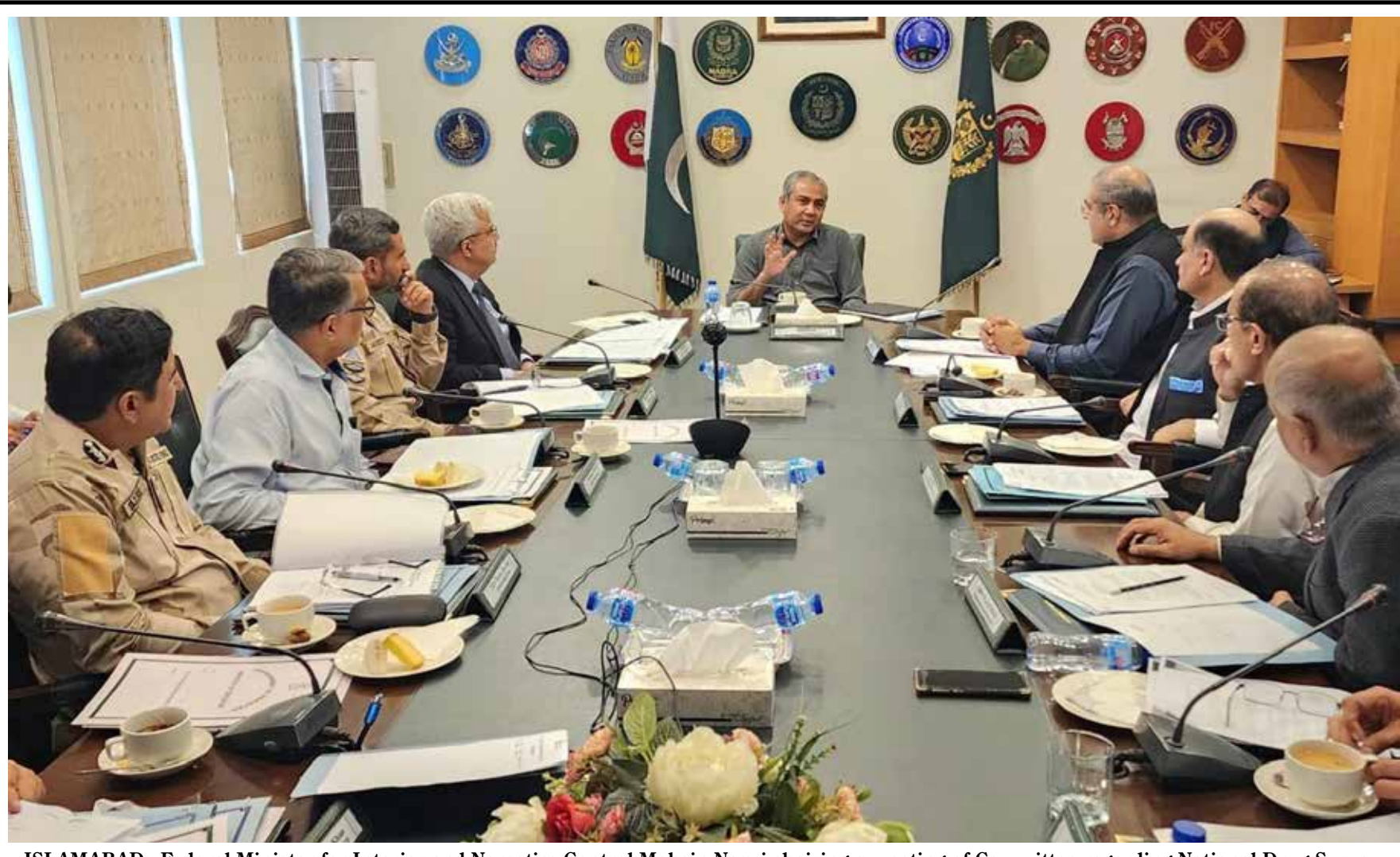
ISLAMABAD: Federal Minister for Interior and Narcotics Control Mohsin Naqvi chairing a meeting of Committee regarding National Drug Survey.