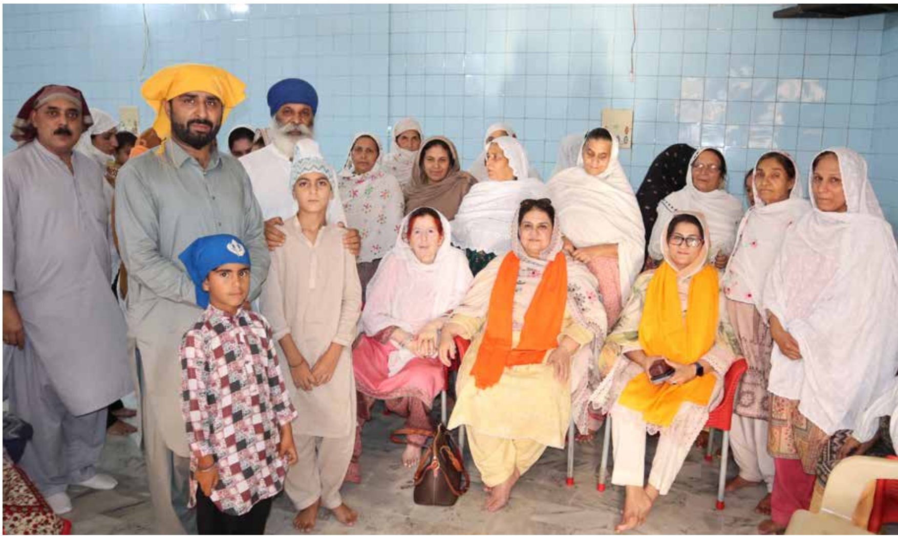
ISLAMABAD: Benazir Income Support Programme (BISP) staff registering Sikh families