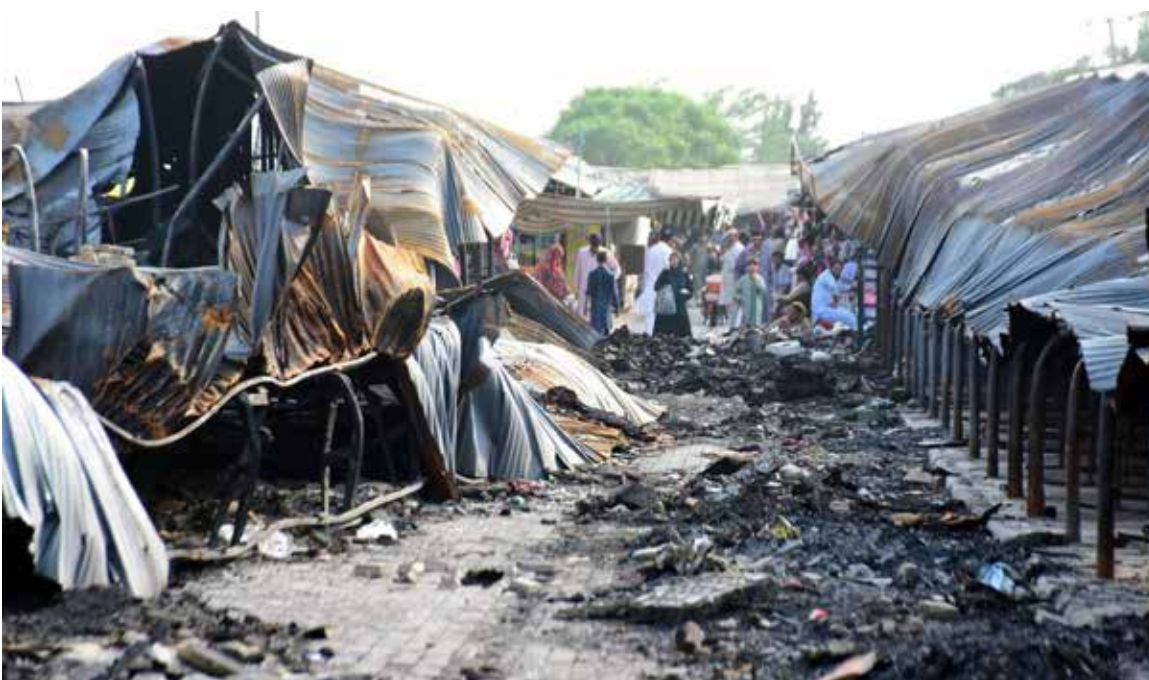
ISLAMABAD: A view of burned shops at H-9 Sunday Bazaar in the Federal Capital.

at their stands, Internet distribution centers, and areas where people gather, including where women fill water containers or prepare food, in addition to the ongoing targeting of homes and shelter centers," it noted. The human rights organization said, "Blocking any attempt to restore even the barest necessities of life in Gaza City and North Gaza governorates, the Israeli army appears to aim to force residents to comply with the orders it continues to issue to evacuate all inhabitants of the two governorates." "The IOF sent voice messages to residents of these two governorates, requesting that they evacuate to the south of the Gaza Valley amid the ongoing airstrikes and artillery shelling," the Euro-Med added. It revealed that it had received testimonies that "the Israeli army tracks individuals moving through the designated passageways on Salah al-Din Road and Al-Rashid Street in Gaza City using electronic monitoring equipment."