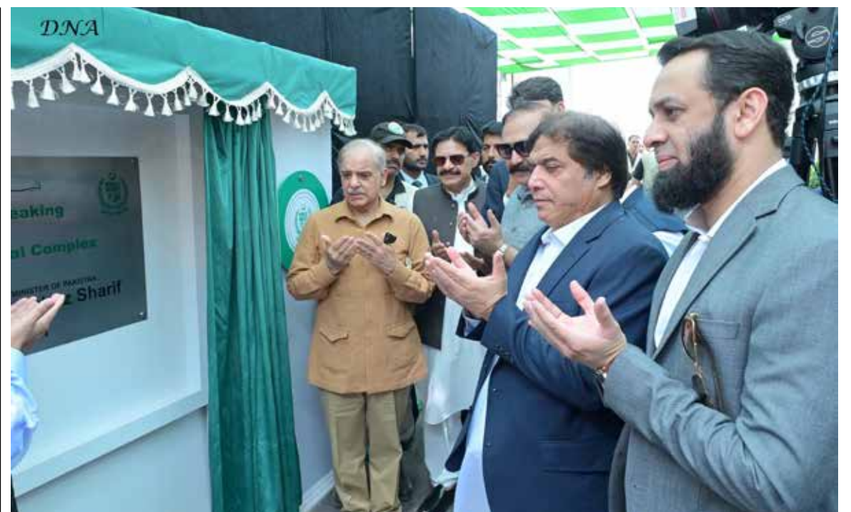
ISLAMABAD: Prime Minister Muhammad Shehbaz Sharif unveiling a plaque during the groundbreaking of Jinnah Medical Complex.

gated after the video went viral. It is, however, unclear as to what was the cause of the incident.