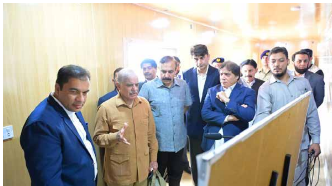
ISLAMABAD: Prime Minister Muhammad Shehbaz Sharif receives briefing regarding the construction of Jinnah Medical Complex in Islamabad.

A leading expert in infectious diseases Dr Waqar Naem talking to a Private news channel stressed the importance of awareness and preparedness in preventing monsoon-related ailments. "Monsoon diseases like cholera, typhoid, and dengue are a major health concern, and it's essential that citizens are aware of the risks and take necessary precautions, he added. The health expert also emphasized the importance of seeking medical attention immediately if symptoms persist. "Early detection and treatment are crucial in preventing complications and saving lives," Dr added.—APP