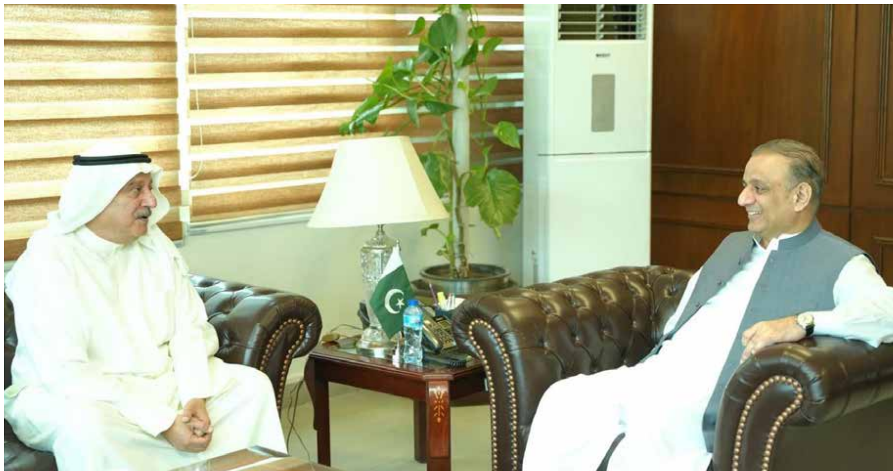
ISLAMABAD: Ambassador of Kuwait to Pakistan, Abdul Rehman Jay. Al-Mutiari called on Federal Minister for Board of Investment, Privatization and Communications, Abdul Aleem Khan.