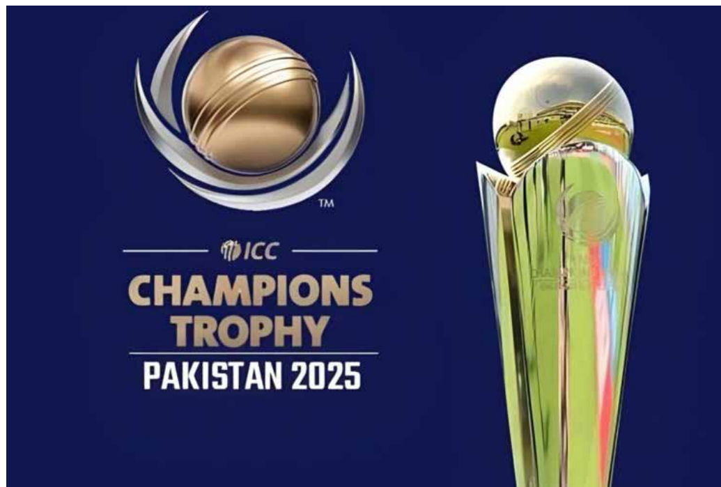
matches on a neutral venue. However, the PCB strongly believes that since the event is of Pakistan, it should be completely staged in Pakistan. The International Cricket Council's (ICC) annual meeting