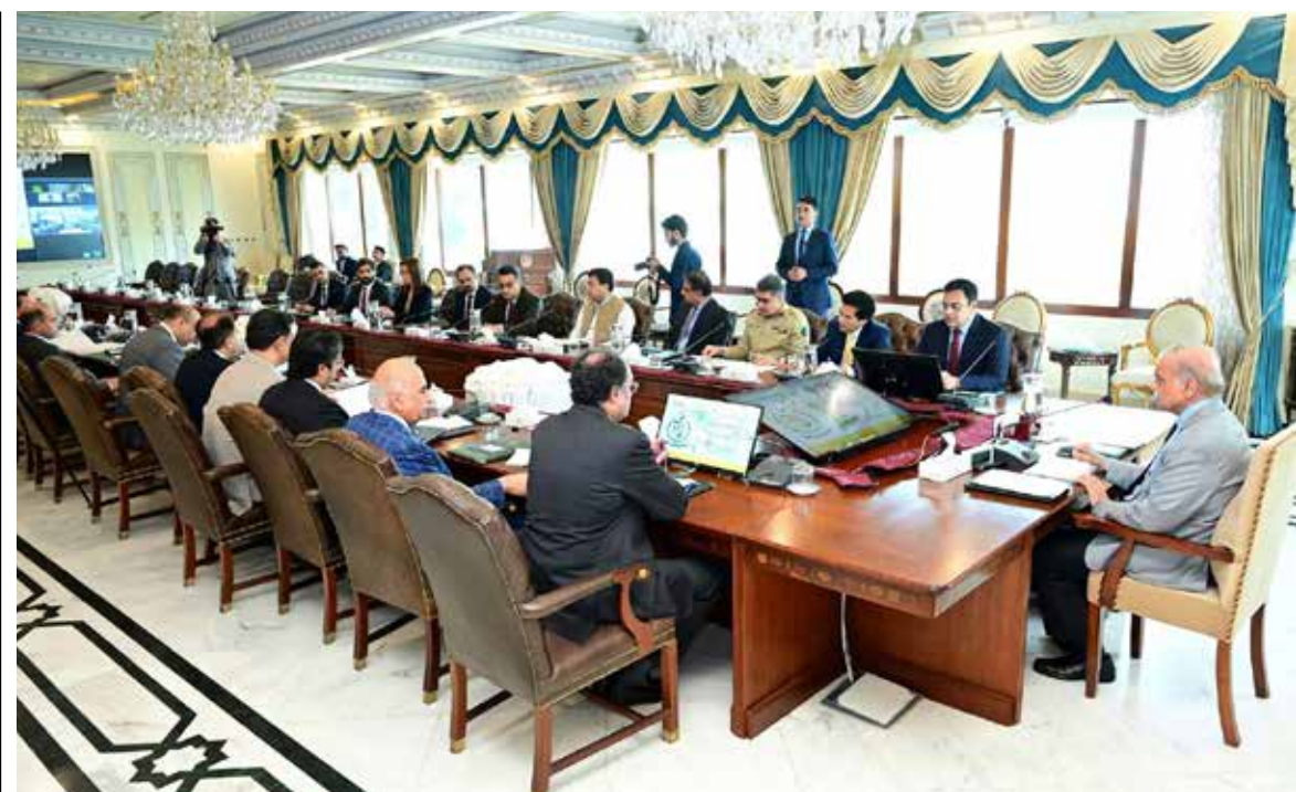
ISLAMABAD: Prime Minister Muhammad Shehbaz Sharif chairs a meeting on increase in investment and capacity of federal government Ministries.