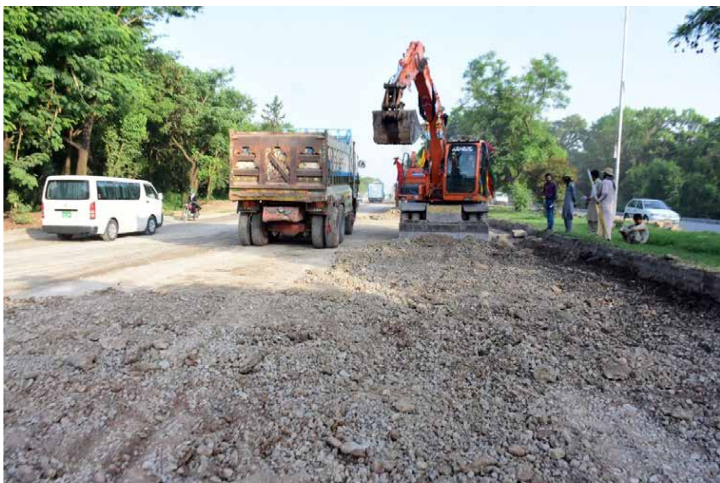
ISLAMABAD : Work in progress on Park Road expansion project in the Federal Capital.—ONLINE

age caused by recent fire incidents due to heat waves on the Margalla Hills will be addressed. The minister has also ordered digital monitoring of the planted saplings. He noted that instead of decorative trees, fruit and flowering plants will be planted to make Islamabad greener. The campaign will continue for 60 days.—APP