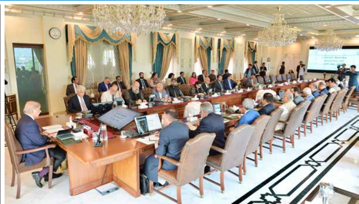
ISLAMABAD: Prime Minister Shehbaz Sharif chairs a meeting of the Federal Cabinet.