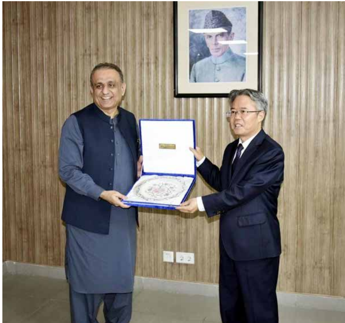
ISLAMABAD: Federal Minister Board of Investment, Abdul Aleem Khan meets with the Chinese Ambassador, His Excellency Jiang Zaidong to Bolster Economic Cooperation.