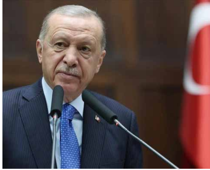
Turkish Cypriots are fed up with federalism-based proposals, he

ANKARA: Türkiye monitors all steps of Greece and intervenes in case of need, Turkish President Recep Tayyip Erdogan said on Wednesday. Speaking at a parliamentary group meeting in Ankara, Erdogan said Türkiye will continue protecting the Turkish minority in Western Thrace. Erdogan emphasized that the same situation applies to the rights of the Turkish Cypriot people, who have been subjected to "injustice, unlawfulness, and discrimination for nearly three-quarters of a century since the 1960s." He noted that Western institutions and organizations have done nothing while these oppressions occurred. Türkiye and the