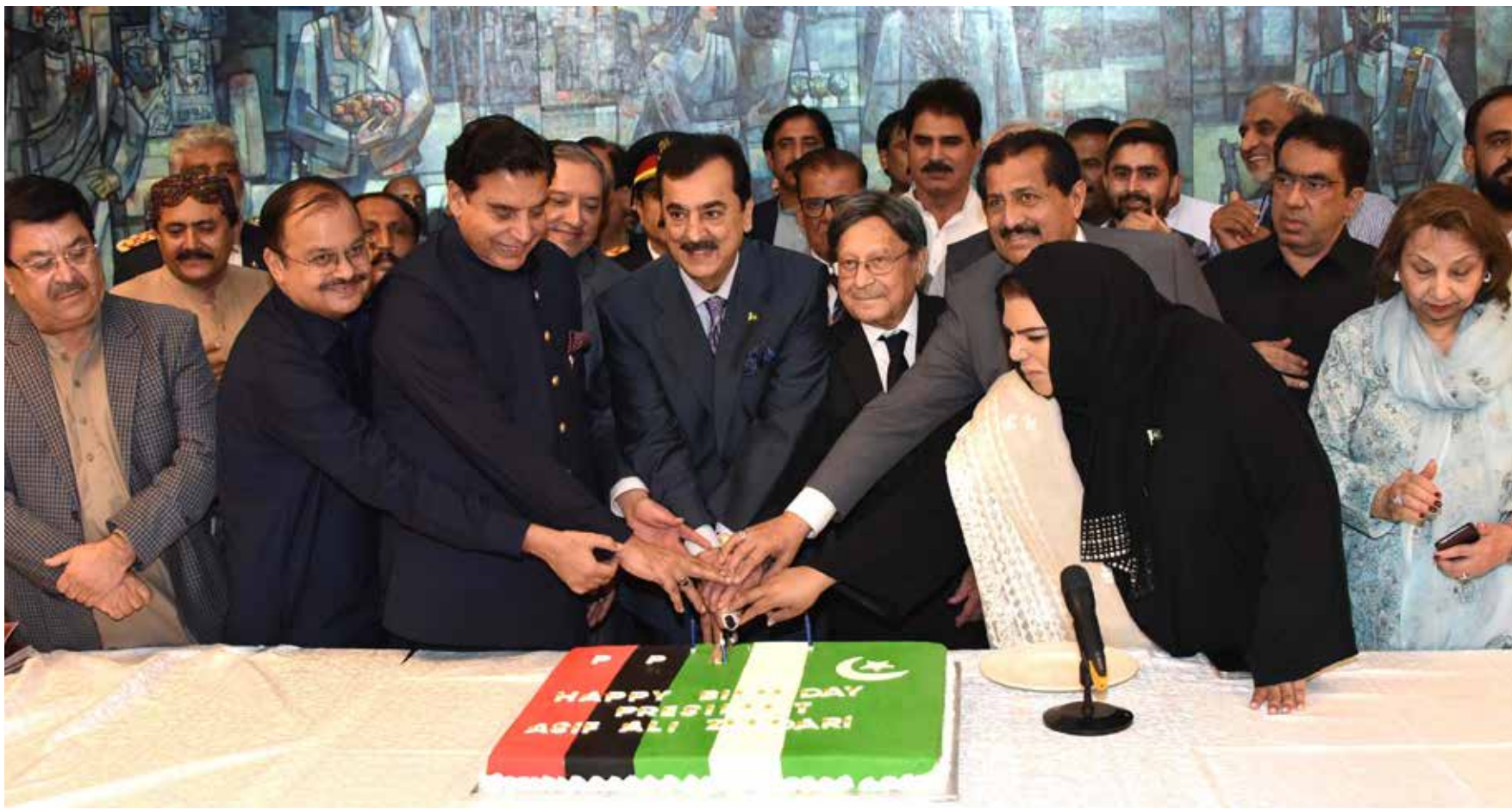
ISLAMABAD: Chairman Senate, Syed Yousuf Raza Gilani, Former Speaker National Assembly, Raja Pervaiz Ashraf, Senator Saleem Mandviwalla and Parliamentarians cutting cake to celebrate birthday of President of Islamic Republic of Pakistan Asif Ali Zardari At Parliament House.

ISLAMABAD: Pakistan's exports to the seven regional countries witnessed an increase of 20 per cent during the fiscal year (2023-24) as compared to the corresponding period of last year. "The country's exports to the regional countries including Afghanistan, China, Bangladesh, Sri Lanka, India, Nepal, and the Maldives account for a small amount of $4334.467 million, which is 13.94 per cent of Pakistan's overall exports of $31,090.229 million during July-June (2023-24)," State Bank of Pakistan (SBP) reported. China tops the list of countries in terms of Pakistan's exports to its neighbouring, leaving behind other countries such as Bangladesh and Afghanistan. Pakistan carried out its border trade with the farther neighbour Sri Lanka, India, Nepal, and Maldives. Pakistan's exports to China witnessed an increase of 33.64 per cent to $2,707.225 million during fiscal year under review from $2,025.741 million last year while exports to Afghanistan also witnessed an increase of 6.07 percent from $522.271 million to $554.008 million. The country's exports to Bangladesh decreased by 13.27 percent to $666.516 million from $768.548 whereas exports to Sri Lanka rose by 37.81 percent to $391.226 million from $283.882. The exports to India increased to $3.569 million from $0.329 million in the previous year. Exports to Nepal decreased by 4.67 per cent to $2.711 million from 2.844 million while to Maldives increased by 7.86 cent to $9.212 million.—APP