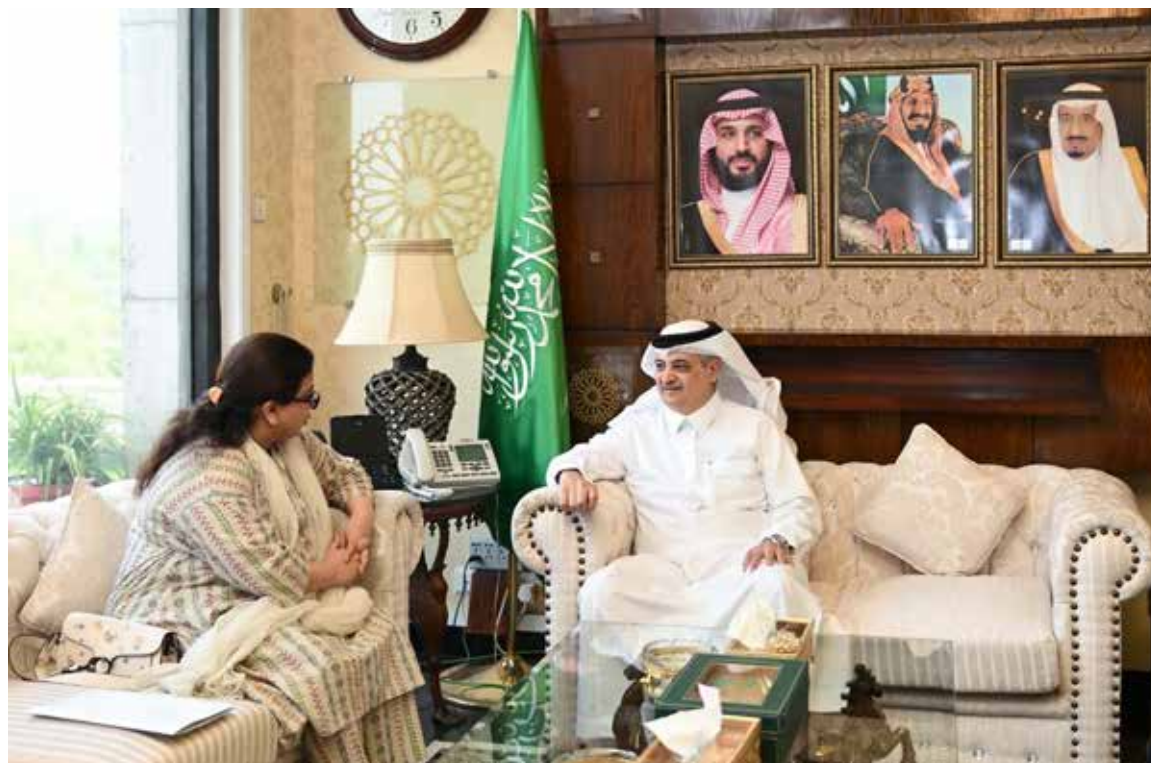
ISLAMABAD: Minister of State for IT and Telecommunication Ms. Shaza Fatima Khawaja in a meeting with Ambassador of the Kingdom of Saudi Arabia to Pakistan H.E. Nawaf bin Saeed Ahmad Al-Malkiy.

Likewise, under the Prime Minister Green Youth Program, 268 universities across the country would be targeted for training youth on climate change prevention and eco-innovation. "Preparation of National Youth Employment Policy 2024 is in final stages," the meeting was told. The focus of the policy would be to create decent employment opportunities for the youth and increase the proportion of women in the workforce. Similarly, it was told that PM Digital Hub was also being prepared which would be a one-window operation dashboard. The meeting was attended by Federal Minister for Economic Affairs Ahmad Khan Cheema, Information Minister Attullah Tarar, Minister of State for Information Technology & Telecom Shaza Fatima Khawaja, Chairman PM Youth Programme Rana Mashhood, Coordinator to PM Rana Ihsan Afzal and other relevant high officials.