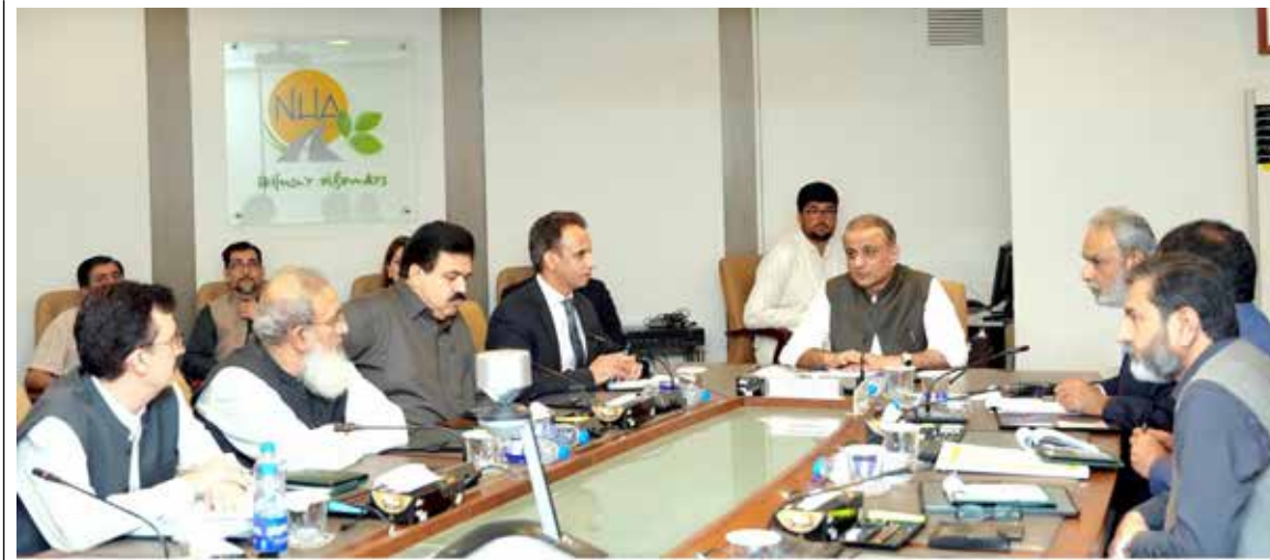
Islamabad : Federal Minister for Communications, Privatization and Board of Investment, Abdul Aleem Khan chaired a high-level meeting of the National Highway Authority.