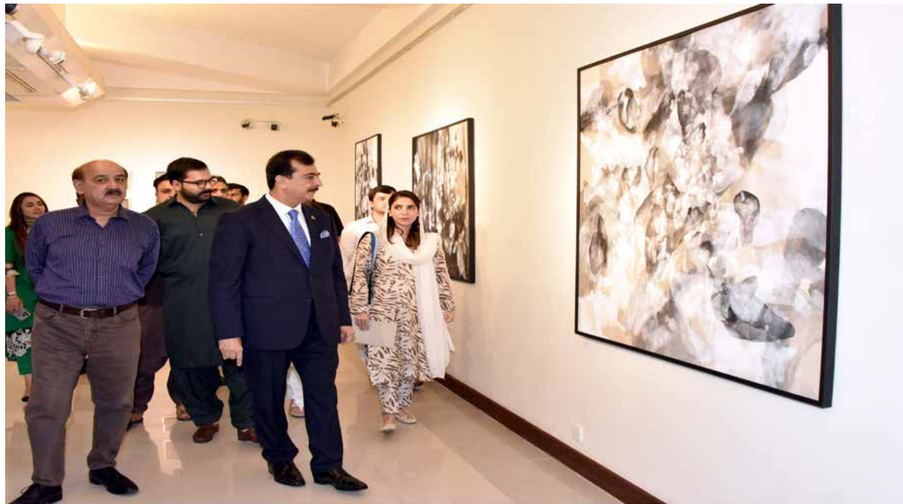
ISLAMABAD: Chairman Senate, Syed Yousuf Raza Gilani witnessing the art exhibition at Pakistan National Council of Arts (PNCA).