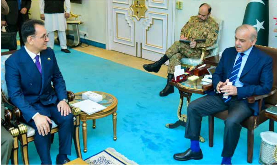
ISLAMABAD: Ambassador of Tajikistan, Amb. Sharifzoda Yusuf Toir, paid a courtesy call on Prime Minister Muhammad Shehbaz Sharif at the Prime Minister House.