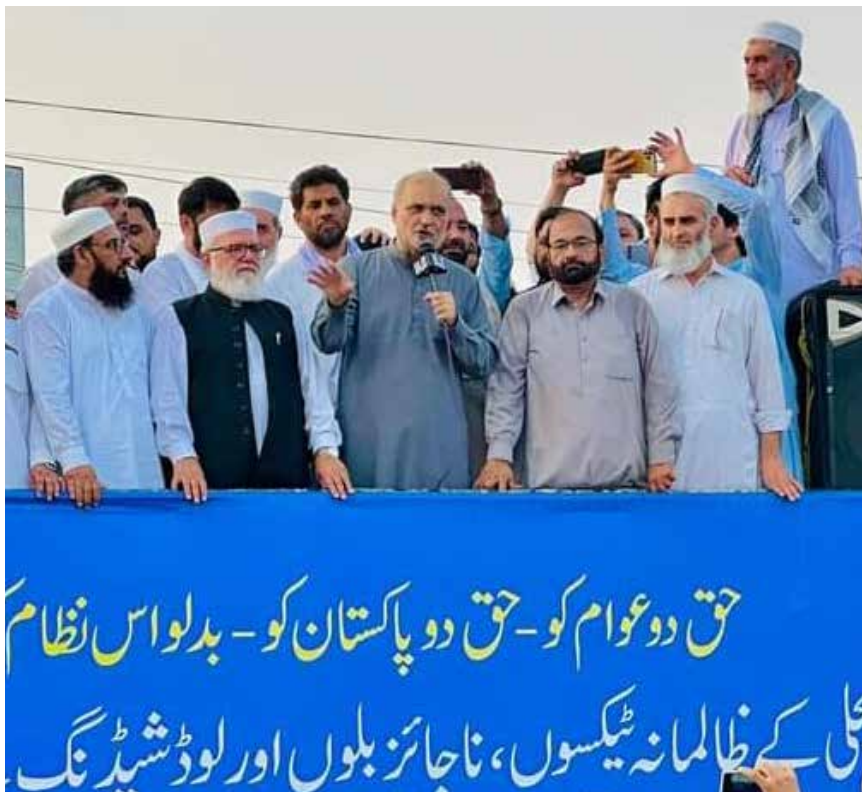
ISLAMABAD: Amir Jamaat e Islami, Hafiz Naem Ur Rehman addressing Dharna participants at H-8 bridge.