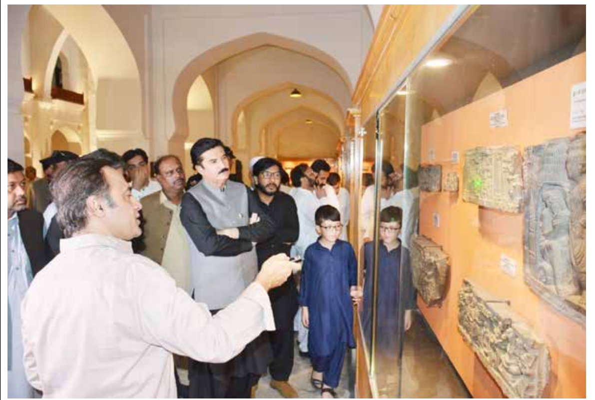
PESHAWAR: Governor KP Faisal Karim Kundi visits KP Museum, highlighting rich heritage including the Gandharan civilization and various religious traditions.

NPD staff members. A special audit is crucial to uncover any financial irregularities in the procurement processes for equipment, vehicles, and other project-related expenses. This audit should be conducted by an independent body to ensure impartiality and transparency. It should also include a thorough examination of the field visits reported by NPD officials to determine their legitimacy. By identifying instances of fraud and mismanagement, the audit can help hold accountable those responsible for undermining the UGPP. The inquiry should also evaluate the educational qualifications and professional experience of the NPD Office staff. This assessment will help determine whether the current team possesses the requisite expertise to manage and implement an afforestation project. If deficiencies are identified, it may be necessary to recruit qualified personnel with a background in forestry and environmental management. This step is essential to ensure that the UGPP is guided by knowledgeable and competent professionals. Strict legal action should be taken against any MOCC officials found guilty of corruption or negligence. This will serve as a deterrent to future misconduct and reinforce the importance of integrity and accountability in public service. Policy reforms may be needed to strengthen the governance and oversight of environmental projects. Implementing stringent checks and balances can help prevent similar issues from arising in the future.