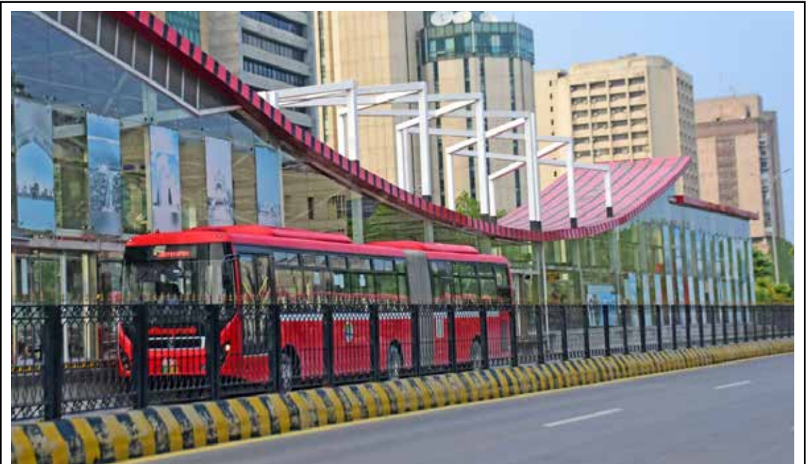
ISLAMABAD: The Metro Bus Service, which was shut owing to the Jamaat-e-Islami dharna, has partially been opened. Full resumption of the service depends upon the sit-in plans. Commuters of twin cities have been facing severe problems due to disruption in the bus service.

ISLAMABAD: The Privatisation Commission Board has approved the privatisation of several power distribution companies (DISCOs) in a bid to strengthen the national economy. The decision was made during a meeting chaired by Federal Minister for Investment, Communications, and Privatisation Abdul Aleem Khan. The board decided to complete the legal formalities for privatisation by 2025, starting with three DISCOs in the first phase. The appointment of a financial advisor to facilitate this process was also approved. The federal minister emphasised the importance of a transparent and swift privatisation process, stating that privatising these institutions is crucial for economic recovery. He noted the strong potential for making these institutions profitable once they transition to the private sector.