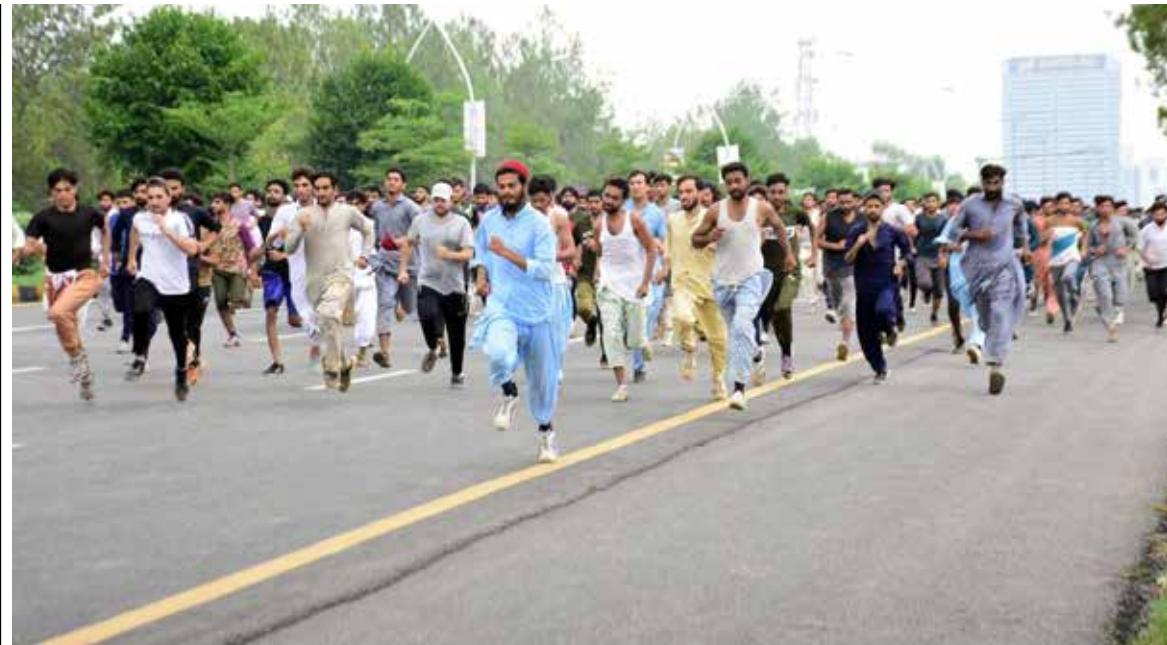
ISLAMABAD: Youth participating in the race on Jinnah Avenue for recruitment in Islamabad Police. --ONLINE

SHANGHAI: A landslide caused by flooding in central China's Hunan province destroyed a local guesthouse and killed 11 people on Sunday, with at least one person still missing, state media reported. Official broadcaster CCTV said it had "been initially confirmed that 18 people were buried". As of Sunday afternoon, 11 bodies and six injured survivors had been recovered, it added. The landslide was caused by flash flooding on a mountain, according to CCTV. More than 240 emergency personnel had been dispatched to the scene, with "rescue work continuing urgently", the broadcaster said. A video published by the state-run Beijing Youth Daily showed a swath of mud and debris cutting through a green hillside, and an uprooted tree lying in front of a three-storey building. China has suffered a summer of extreme weather, with flash floods in the north and southwest killing at least 20 people earlier this month. In May, a highway in southern China collapsed after days of rain, leaving 48 dead. Scientists say climate change is making extreme weather more frequent and intense, and China is the world's largest emitter of greenhouse gases. Landslide kills eight in China after heavy rainfall Long dependence on polluting energy sources such as coal, Beijing has pledged to bring emissions of planet-heating carbon dioxide to a peak. --APP