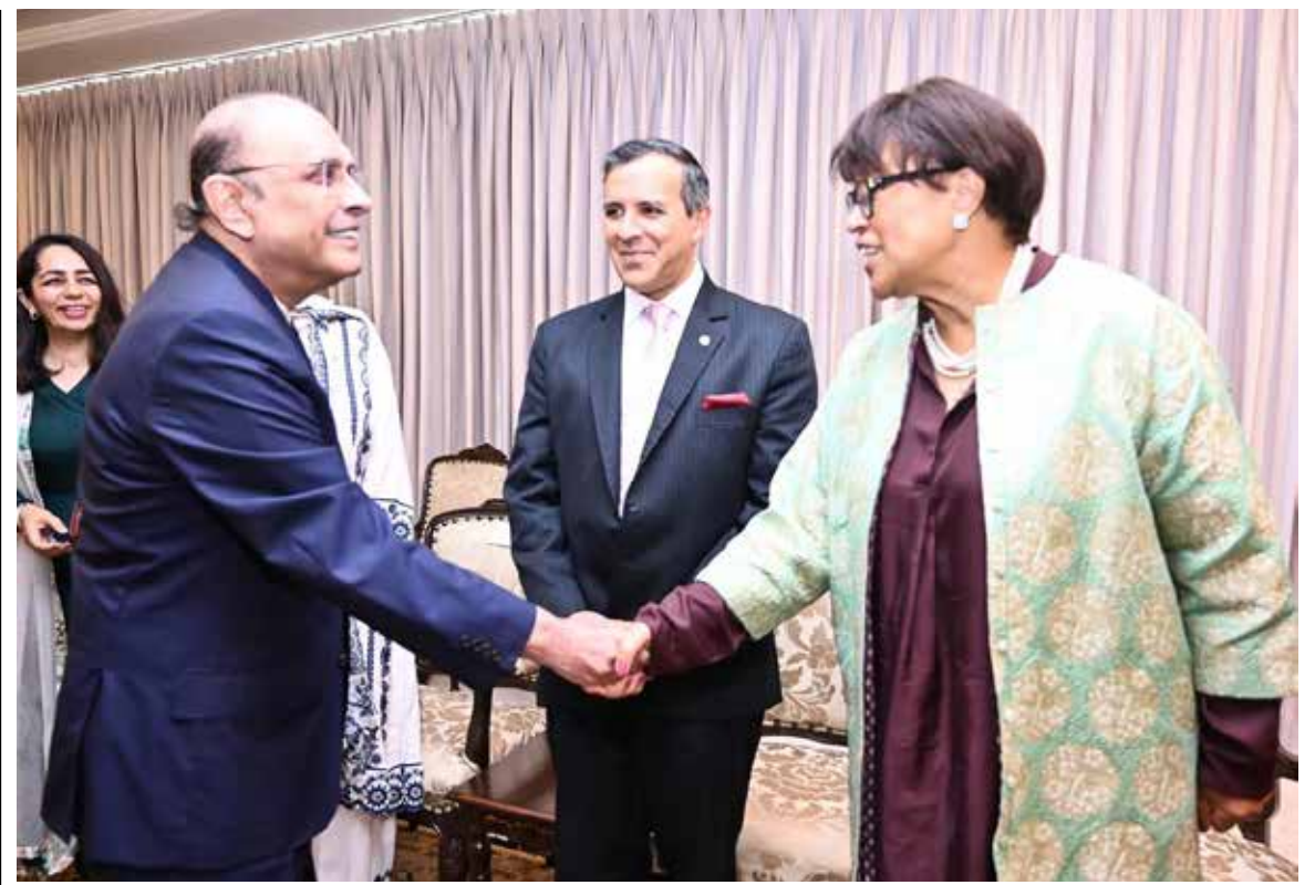
ISLAMABAD : President Asif Ali Zardari welcoming the Secretary-General of Commonwealth, Patricia Scotland, at Aiwan-e-Sadr.

Help-Desk Team: for technical support, contact the OEC-Helpdesk team at UAN: 0311-0011-632 or Email: helpdesk@oec.gov.pk The applicant will submit/attach the deposited Bank challan amounting to Rs. 1000/- generated at the time of online application submission.