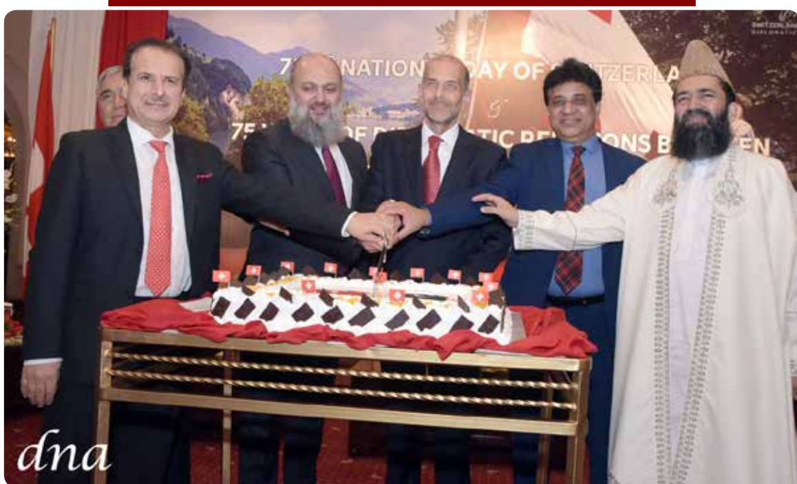
ISLAMABAD: Federal Commerce Minister Jam Kamal, Ambassador of Switzerland Georg Steiner and others cutting cake to celebrate the National Day of Switzerland.