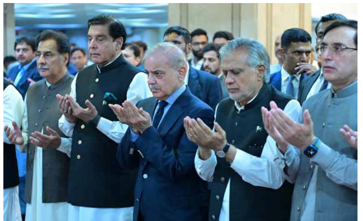
ISLAMABAD: Prime Minister Muhammad Shehbaz Sharif, Chairman PTI Barrister Gohar and Parliamentarians offering funeral prayer of Shaheed Ismail Haniyeh.