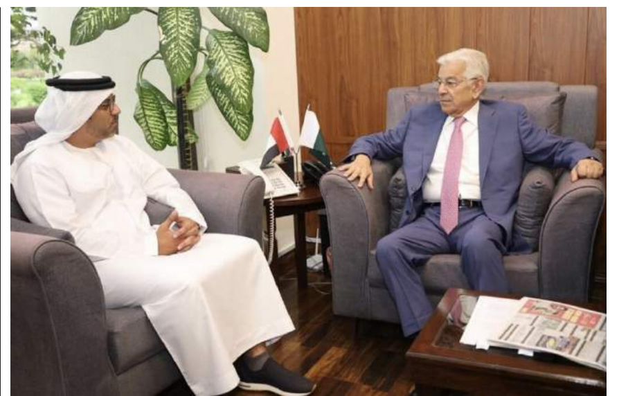
ISLAMABAD: Ambassador of United Arab Emirates, Ibrahim Salem Alzaabi calls on Khawaja Muhammad Asif, Defence Minister of Pakistan.