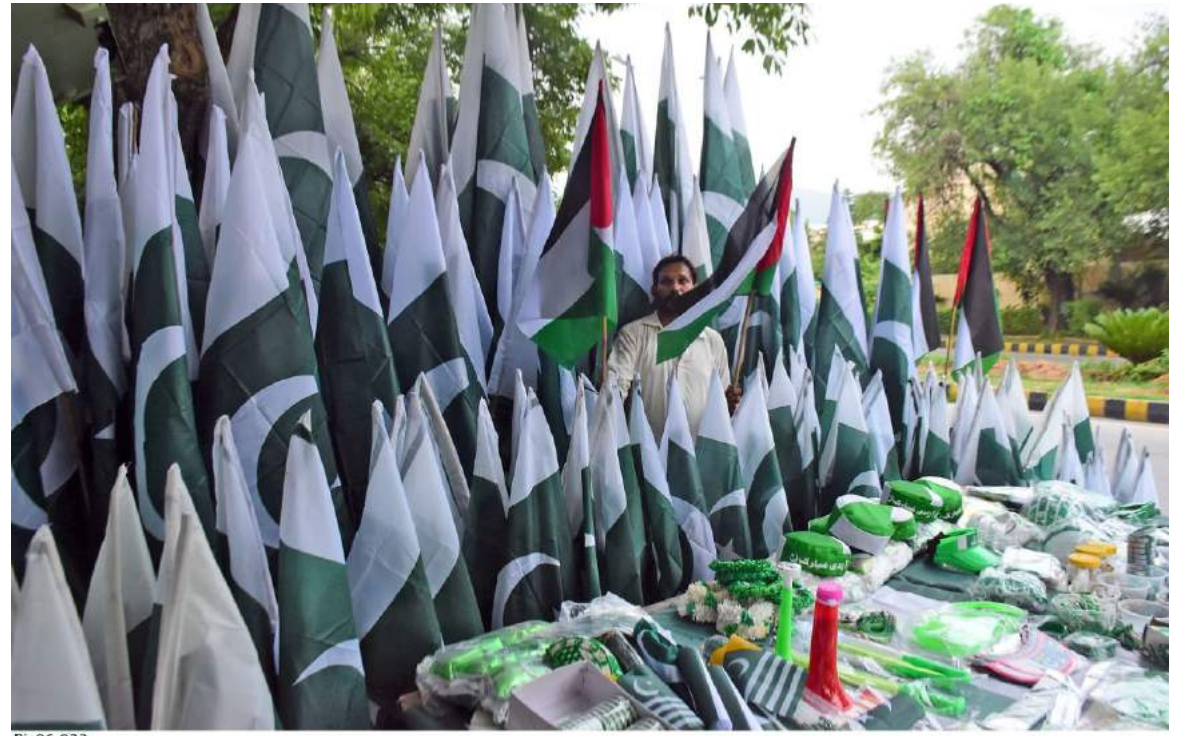
ISLAMABAD: A vendor is selling national flags of Pakistani, Kashmiri, and Palestine at his roadside workplace in the Federal Capital, ahead of upcoming Independence Day on 14th August.

an example. He said that at a time when Pakistan is facing difficulties, the government and people of Saudi Arabia stand with Pakistan. He said that the services of Saudi Arabia for Muslim countries and the Islamic world are not hidden from anyone. He said that Hajj is such an organized and purposeful grand gathering which, putting aside the differences of color, caste and language only for the sake of Allah's pleasure. The Governor paid tribute to Tahir Ashrafi and invited him and his team to visit the Governor House Peshawar where the inter-faith and inter-religious harmony conference will be held. Keeping the philosophy and purpose of the Muslim Ummah in front, practical steps will be taken for the unity of the Muslim Ummah and the exaltation of the religion of Islam.