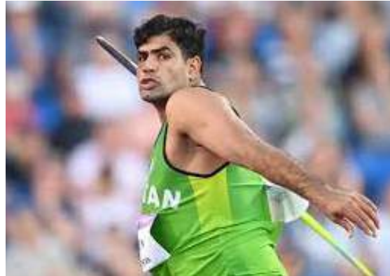
Anderson Peters (Grenada) – 88.63m throw Julian Weber (Germany) – 87.76m throw Arshad Nadeem (Pakistan) – 86.59m throw Julius Yego (Kenya) – 85.59m throw Luiz Maurício da Silva (Brazil) – 85.91m throw Jakub Vadlejch (Czech Republic) – 85.63m throw

place in the final round where they will compete for the medal. Pakistan sent a total of seven athletes and six of them have been out of their respective events. The 27-year-old is Pakistan's last and biggest hope for a medal in the Olympics. This marks Nadeem's second consecutive Olympic final, following his impressive fifth place finish in Tokyo. The final of the Javelin Throw event will be played on Thursday, August 8, at 11:25pm Pakistan Standard Time (PST). Athletes to qualify for Javelin Throw Final: Neeraj Chopra (India) – 89.34m throw