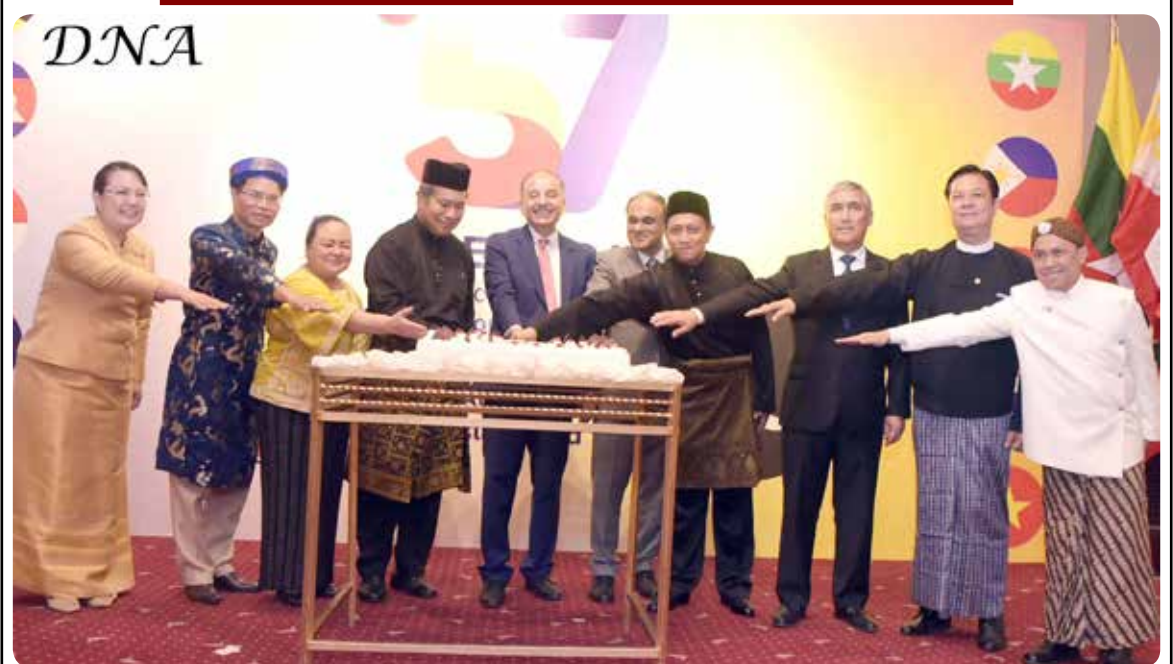
ISLAMABAD: Federal Minister for Petroleum Mussadaq Malik, Chairman of ASEAN Islamabad Committee Haji Kamal Bashah High Commissioner of Brunei, Heads of missions of the ASEAN states cutting cake to celebrate the 57th Anniversary of the ASEAN Day, at Islamabad Serena Hotel.