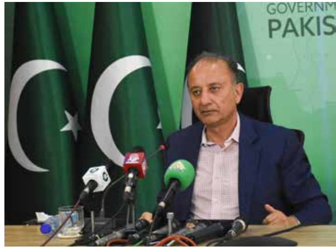
representatives to highlight their issues and resolve problems. The minister highlighted the positive impact of the government's economic policies under the leadership of Prime Minister Shehbaz

ISLAMABAD: Federal Minister for Petroleum, Dr. Musadik Masood Malik on Thursday reaffirmed the government's commitment to the welfare of the poor, youth and women of Pakistan. Addressing a press conference, he said, "We are following the vision of 'One Pakistan,' working towards the uplift of the poor people and creating opportunities for the youth and women of the country." He criticized the Opposition for focusing on negativity, destruction and divisive politics. He lamented that the Opposition has not offered any constructive suggestions for the progress, prosperity or development of the country. He said that the people of Pakistan have elected their