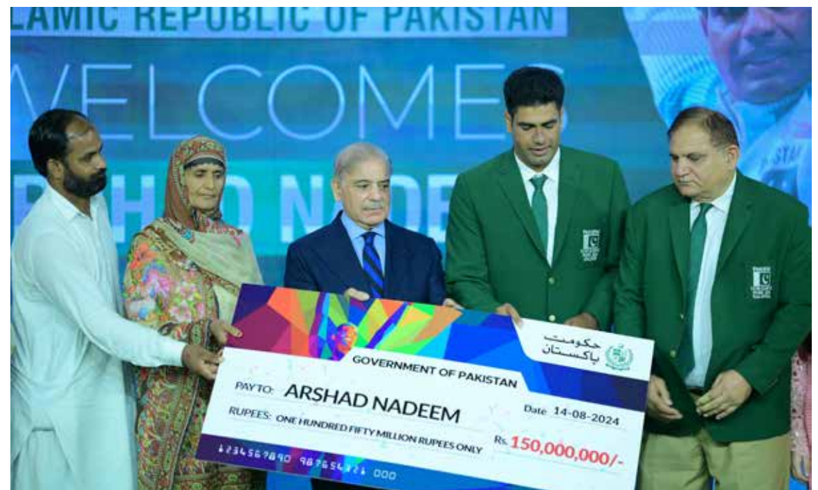
ISLAMABAD: Prime Minister Muhammad Shehbaz Sharif presenting a cheque of Rs.150 million to Mr Arshad Nadeem for winning gold medal in javelin throw at Paris Olympics 2024.