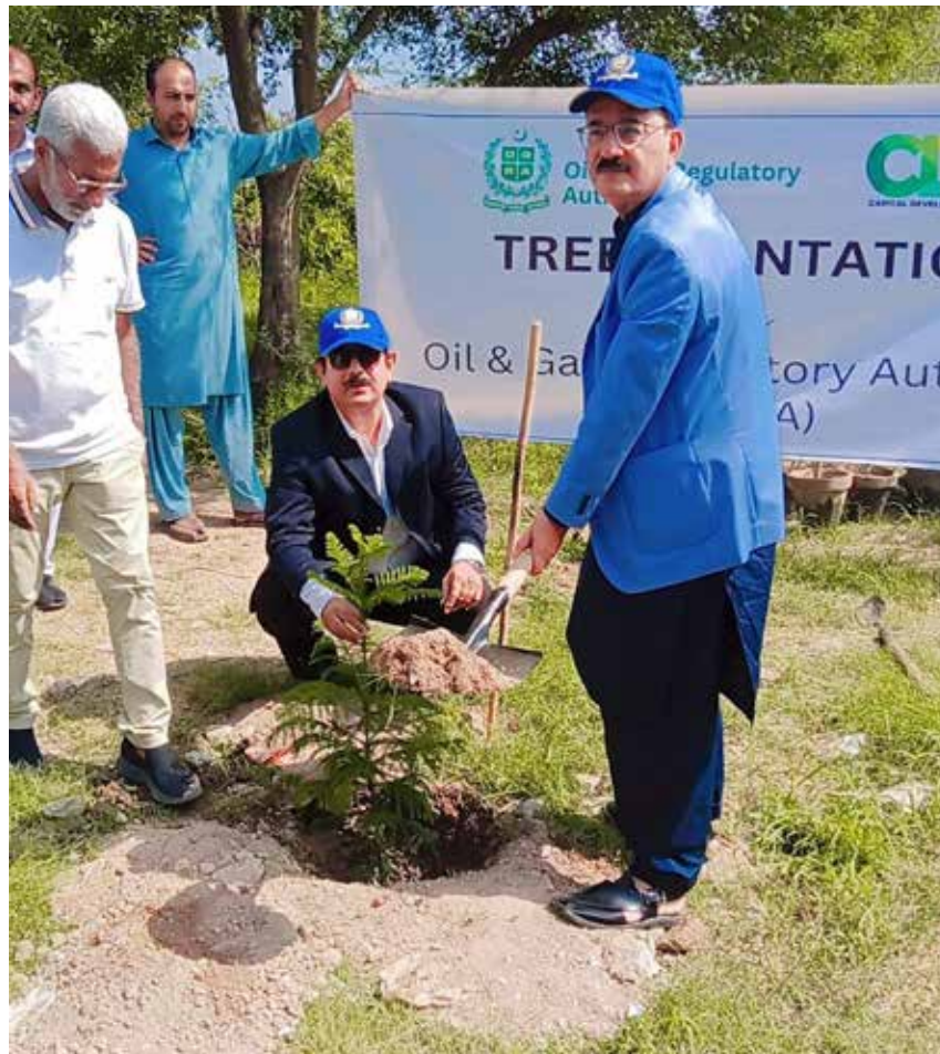
by planting as many trees as possible," Masroor Khan also called upon all OGRA licensees to actively participate in the "Plant for Pakistan" drive, reinforcing the organization's commitment to environmental sustainability.

ISLAMABAD: In commemoration of Pakistan's 77th Independence Day, the Oil and Gas Regulatory Authority (OGRA) has launched the "Plant for Pakistan" initiative, reflecting the nation's commitment to combating the adverse impacts of climate change. The eco-friendly drive was inaugurated by OGRA Chairman, Masroor Khan, who planted a tree alongside Members of the Authority and OGRA employees. The initial phase saw the planting of over 200 trees on the green belt in front of the OGRA Headquarters in Islamabad, in collaboration with the Capital Development Authority (CDA). Chairman Masroor Khan commended the Capital Development Authority for its support during the drive. He emphasized the importance of collective efforts in safeguarding the environment, stating, "As we celebrate our Independence Day, let us pledge to serve our nation with dedication and to protect our environment from the dangers of climate change. Together, we can make a difference