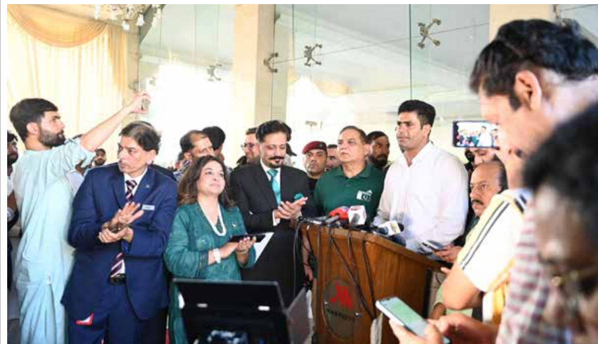
ISLAMABAD: Arshad Nadeem, Pakistan's Olympic gold medalist, addressing the media at the Islamabad Marriott Hotel.