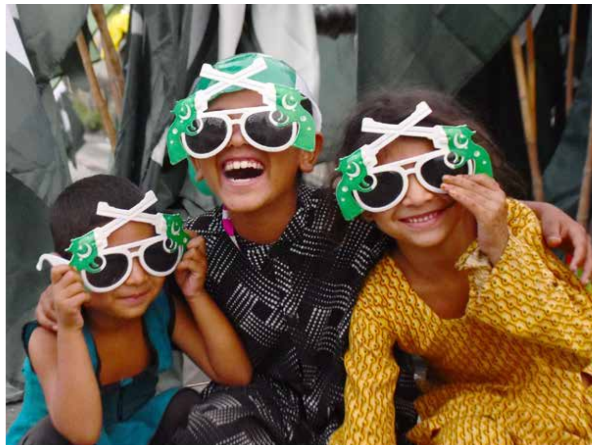
ISLAMABAD: Aug11-Citizens taking interest in Flags and other stuff road stalls in the Federal Capital in celebration of August 14 Pakistan Day.