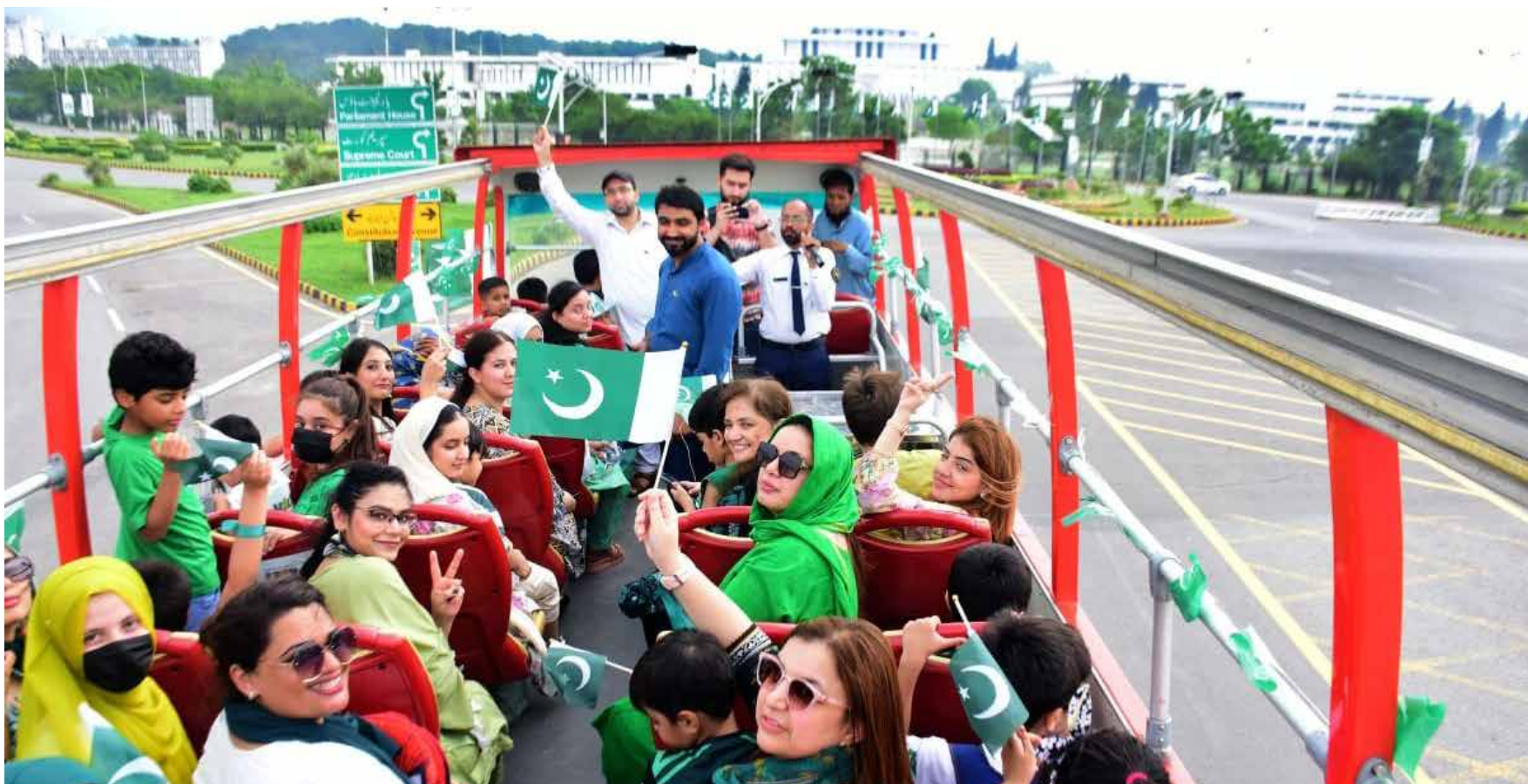
ISLAMABAD: Special children enjoying Independence Day along with their teachers visiting Federal Capital.

MANILA: A Thai court has dismissed Prime Minister Srettha Thavasin for appointing to his cabinet a former lawyer who was once jailed. The Constitutional Court ruled that Mr Srettha had violated the "rules on ethics" with "the display of defiant behaviour". The 62-year-old Srettha, who has been in power for less than a year, is the third PM in 16 years to be removed by the same court. He will be replaced by an interim leader until Thailand's parliament convenes to elect a new prime minister. "I'm confident in my honesty ... I feel sorry, but I'm not saying I disagree with the ruling," he said at a press conference shortly after the ruling. The court's ruling is final and cannot be appealed. Mr Srettha's dismissal means he has now gone the way of so many other parties and administrations in Thailand - felled by the disproportionate power of the country's constitutional court. Politics in Thailand is not known for its ethics; bribery is commonplace and ministers with more serious convictions have been allowed to serve in the past. - Agencies