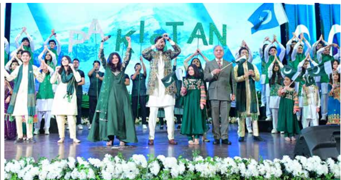
ISLAMABAD: Prime Minister Muhammad Shehbaz Sharif with the singers and students who performed at the Independence Day event.