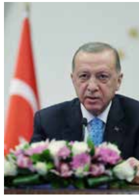
fundamentally," Erdogan's comments came after Guterres' statement, saying:

ANKARA: Turkish President Recep Tayyip Erdogan has strongly endorsed UN Secretary-General Antonio Guterres' recent remarks on reforming the Security Council, emphasizing the need for a more equitable global system that includes African representation. In a statement addressing Guterres' X post, Erdogan said: "The structure of UN Security Council, which is far from fulfilling its duty to ensure global peace and security, must be changed