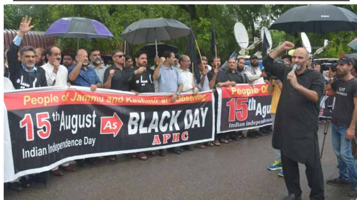
ISLAMABAD: People of Jammu and Kashmir observed Black day on the occasion of Indian Independence day in the Federal Capital.