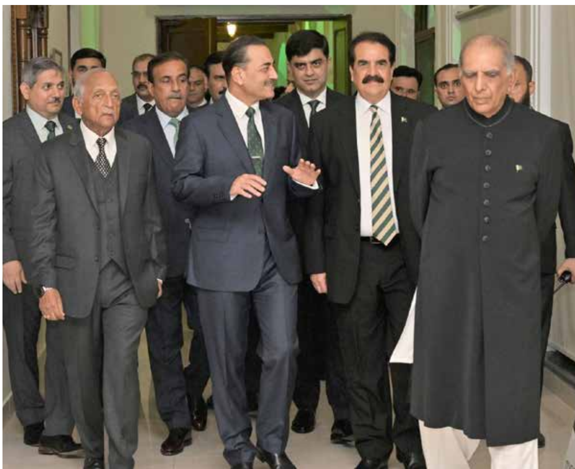
RAWALPINDI: Chief of Army Staff General Asim Munir welcoming retired military officers during reception on Independence Day.