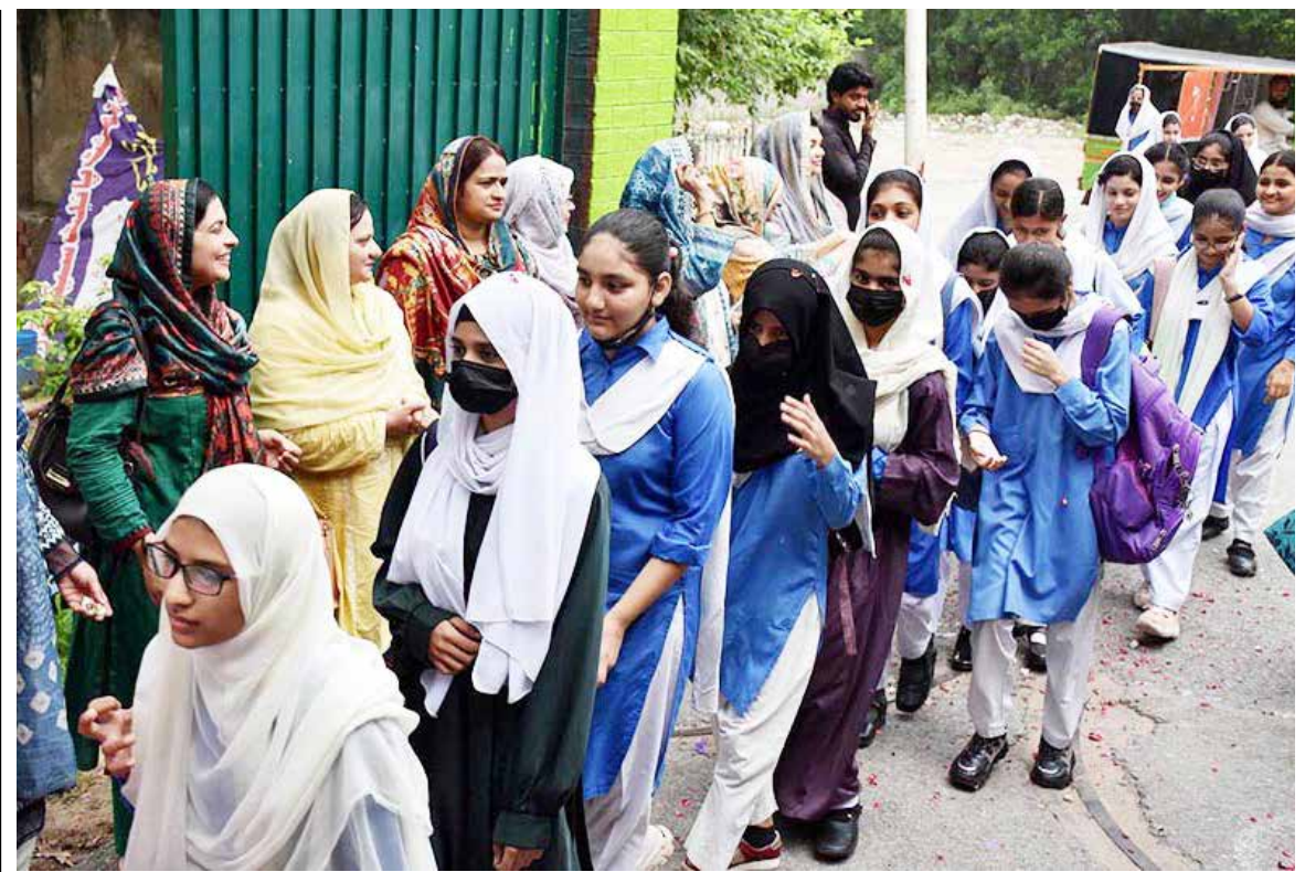
LAHORE: School teachers welcome the students on the opening day after Summer Vacation as Students arrive to attend their first day of school.