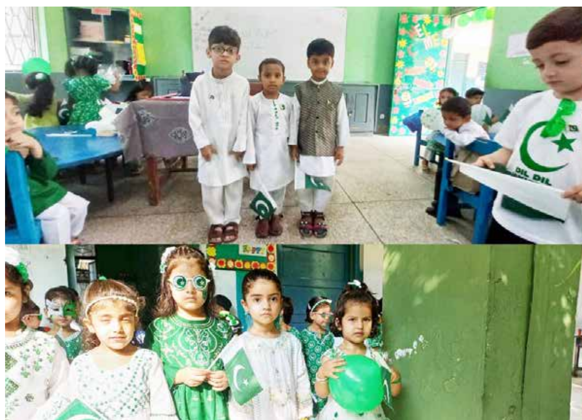
ISLAMABAD: Independence day celebrated at Islamabad Model school (I-V) G-9/2. —DNA

tivity, having successfully hosted more than 25 international delegations in last six months. These visits have not only strengthened existing business relationships but have also opened up new markets for local companies, enhancing their export capabilities. One of the key highlights of the visit was the discussion on GBC's export initiatives. Chairman GBC shared that the center's ambitious export plan has already begun yielding positive results, with products now being exported to three countries: Sri Lanka, South Sudan and Uganda. This expansion into international markets underscores GBC's commitment to drive economic growth and positioning Gujranwala as a key player in the global marketplace. He also elaborated on GBC's future plans, stating that the center is actively exploring additional markets in Africa, Southeast Asia and the Middle East. The ongoing success of GBC's export initiatives is a testament to the quality and competitiveness of products manufactured in Gujranwala, and the center is poised to continue its upward trajectory in the coming years.