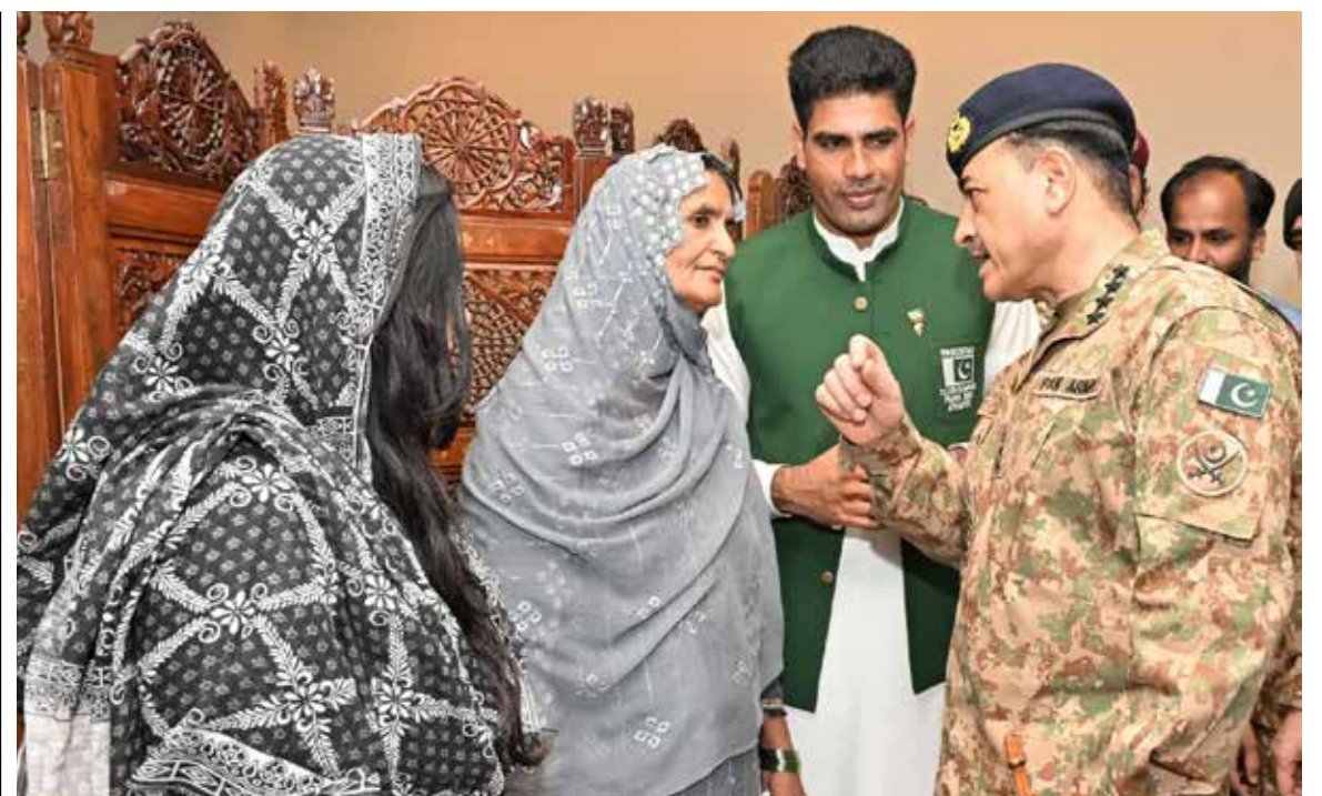
RAWALPINDI: COAS Gen Asim Munir interacting with family of Olympian Arshad Nadeem during a ceremony at Army Auditorium GHQ to honour his achievement.