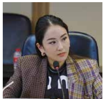
picture of her lunch - chicken rice - with the caption: "The first meal after listening to the vote." Roll of the dice Paetongtarn has never served in government and the decision to put her in play is a roll of the dice for Pheu Thai and its 75-year-old figurehead Thaksin. She will immediately face challenges on multiple fronts, with the economy floundering, competition from a rival party growing,

its bitter enemies in the military to form a government. She will become Thailand's second female prime minister and the third Shinawatra, opens new tab to take the top job after aunt Yingluck Shinawatra, and father Thaksin, the country's most influential and polarising politician. In her first media comments as prime minister-elect, Paetongtarn said she had been saddened and confused by Srettha's dismissal and decided it was time to step up. "I talked to Srettha, my family and people in my party and decided it was about time to do something for the country and the party," she told reporters. "I hope I can do my best to make the country go forward. That's what I'm trying to do. Today I'm honoured and I feel very happy." Paetongtarn won easily with 319 votes, or nearly two-thirds of the house. Her response after winning was posting on Instagram a