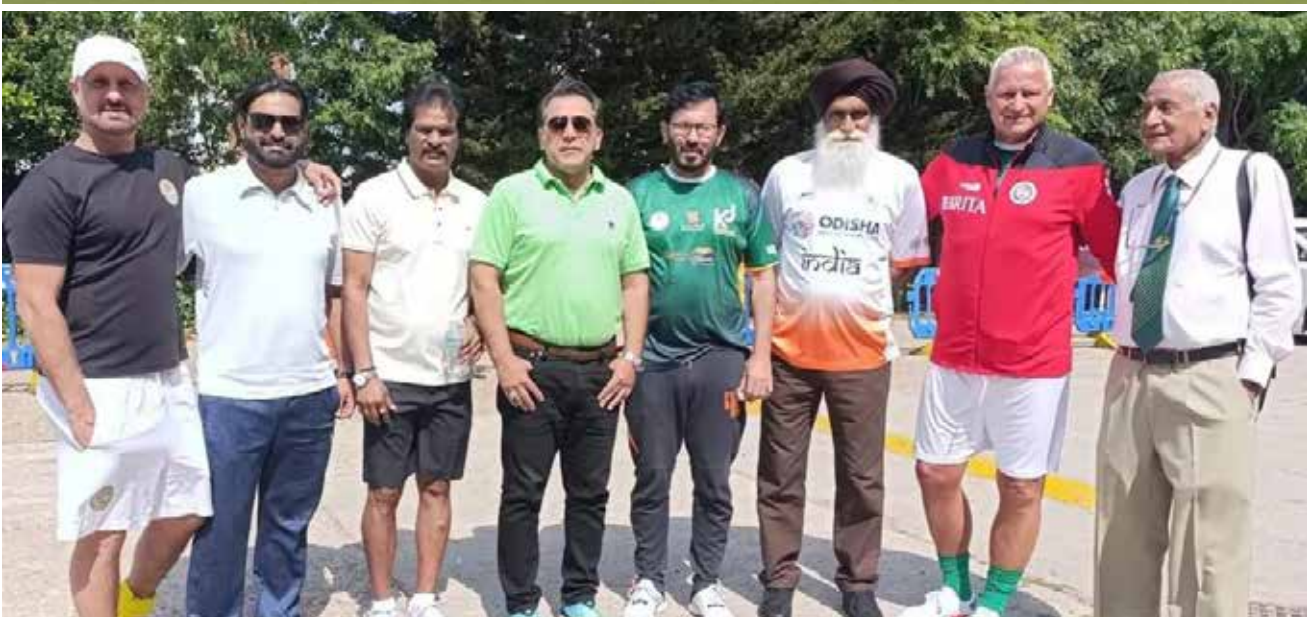
the event and expressed his willingness to participate in future events in Pakistan. He emphasized the importance of strategic