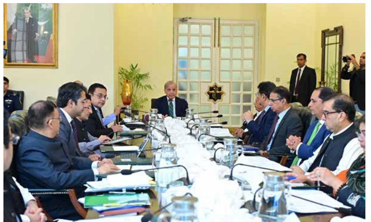
ISLAMABAD: Prime Minister Muhammad Shehbaz Sharif chairs a meeting on matters related to Small and Medium Enterprises Development Authority.