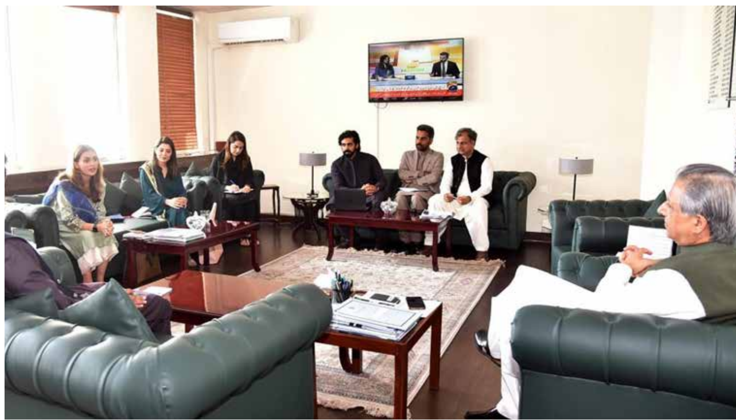
ISLAMABAD : A delegation from Legal Aid Society had a meeting with Federal Minister for Law and Justice and Human Rights Senator Azam Nazeer Tarar.—DNA